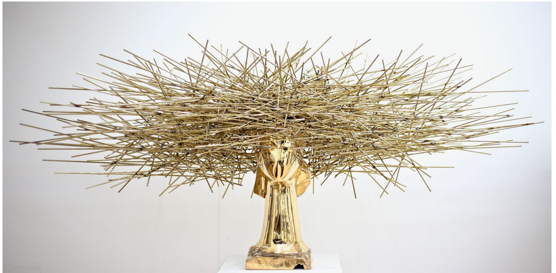
Manolo Valdés, Clio Dorada , 2018 Bronze with gold patina and steel wires, edition of 9, 114 x 255 x 90 cm

Within the exhibition, the work of Manolo Valdés alone constitutes a whole universe of forms with a set of six sculptures. As one of the founding members of Equipo Crónica, a group of artists who drew inspiration from Pop Art to question Franco's Spanish dictatorship and art history itself, the Spaniard also appropriates masterpieces. By decontextualising these images, he frees them from all temporality and formal identification, allowing the material to express itself: "I have to create something in which the materials are dominant, the subject is an excuse."