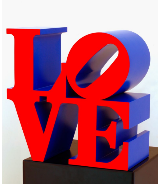
Robert Indiana, Love 1966 - 2000 / Red faces blue sides Polychrome aluminium, 4 AP, 61 x 61 x 30.5 cm