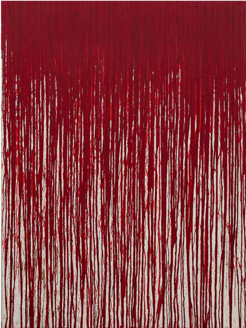
Hermann Nitsch HF_ManeL_21 2021

Acrylic on canvas Signed and dated on the reverse 200 x 150 cm | 78.7 x 59.1 in