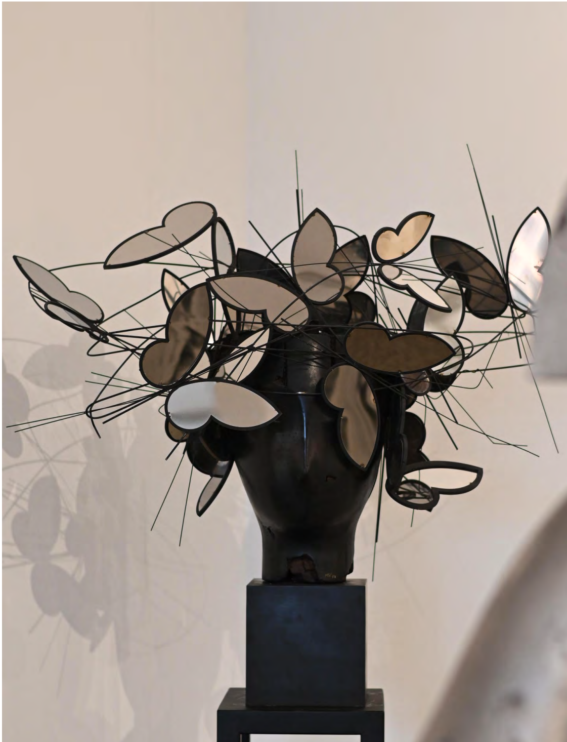
Manolo Valdés (Spanish, born in 1942) Mariposa en Espejos 2022

Bronze and resin 96,5 x 96,5 x 76,2 cm | 38 x 38 x 30 in