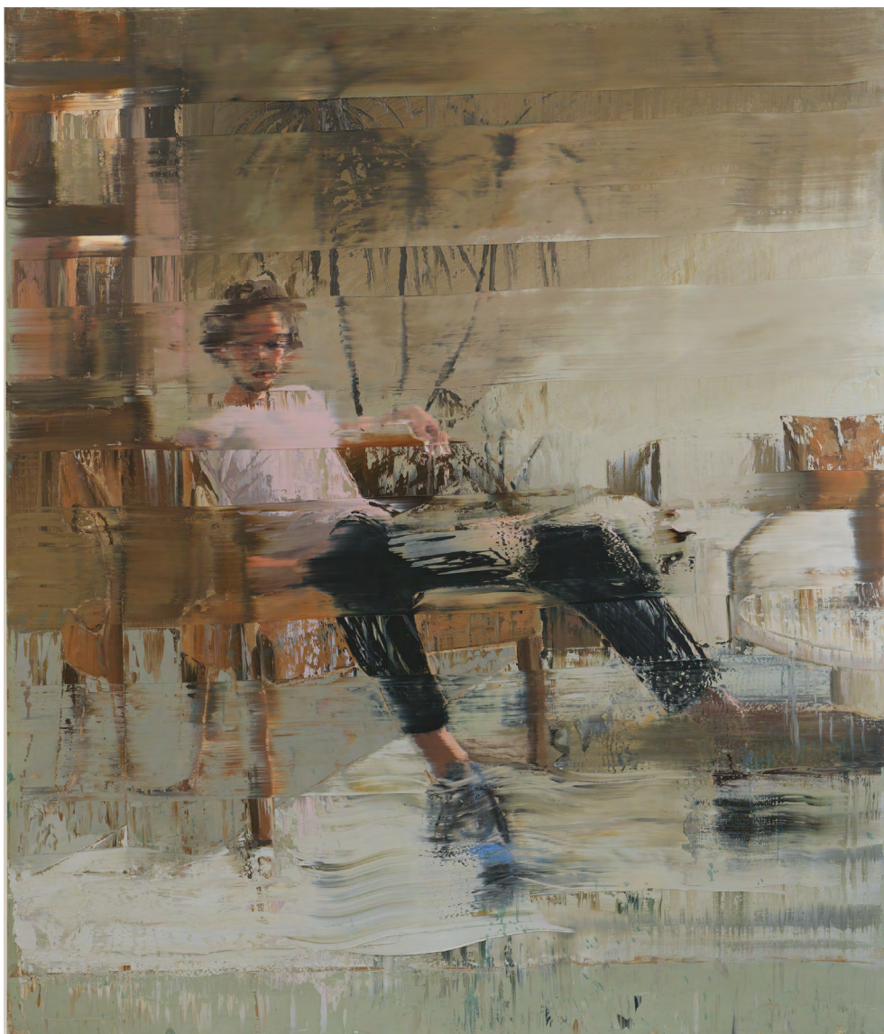
Andy Denzler (Swiss, born in 1965) Fragmented Chair 2022

Oil on canvas 210 x 180 cm | 82.7 x 70.9 in