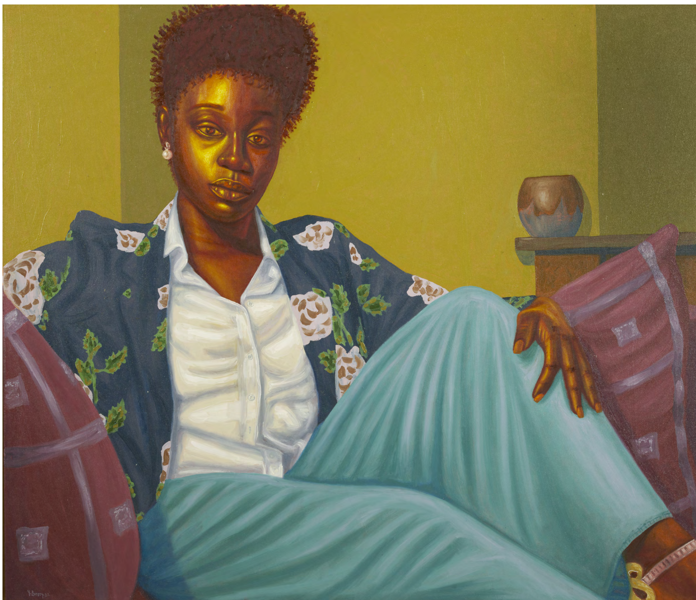
Barry Yusufu (Nigerian, born in 1996) Lady Na Master 2022

Oil on canvas 177.8 x 152.4 cm | 70 x 60 in