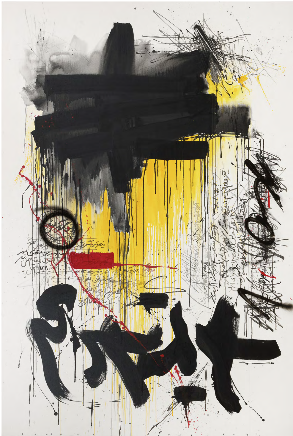
Golnaz Fathi (Iranian, born in 1972) Untitled 2021

Mixed media on canvas Signed at the bottom 190 x 130 cm | 74.8 x 51.2 in