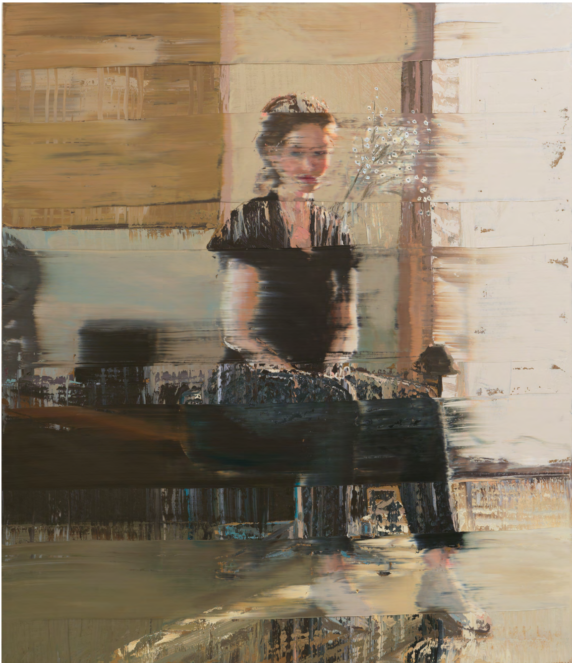
Andy Denzler (Swiss, born in 1965) Woman with Tapedeck 2022

Oil on canvas 140 x 120 cm | 55.1 x 47.2 in