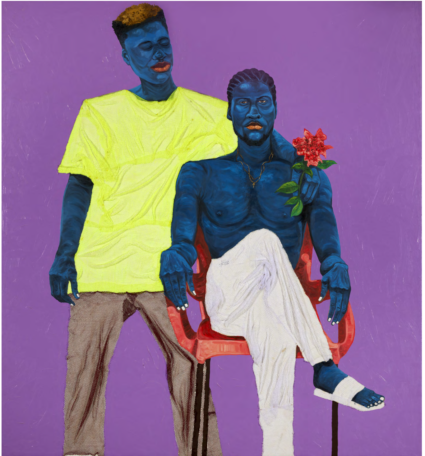
Adjei Tawiah (Ghanaian, born in 1987) Untitled 2022

Mixed media on canvas 230 x 210 cm | 90.6 x 82.7 in