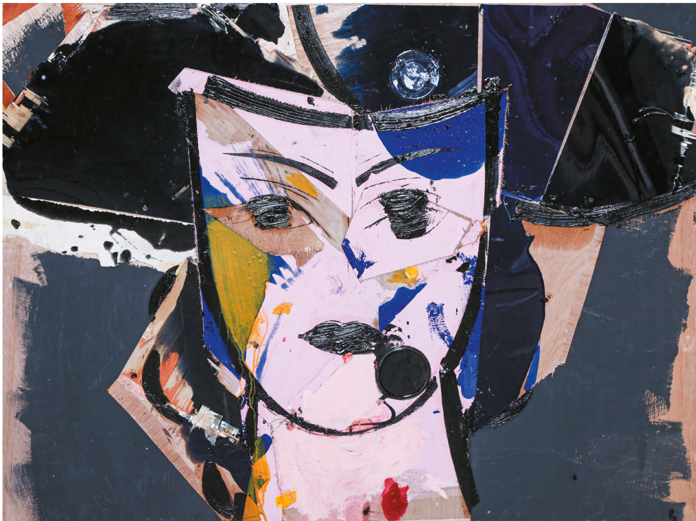
Manolo Valdés (Spanish, born in 1942) Matisse como Pretexto XVI 2022

Mixed media on wood Signed, titled and dated on the reverse 100.3 x 129.5 cm | 39.5 x 51 in