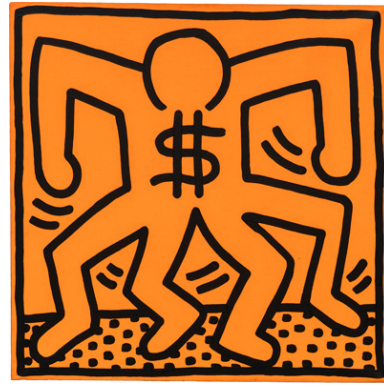
(L-R) Andy Warhol, Marilyn Reversal , 1979, acrylic and silkscreen ink on canvas, 45.5 x 38 cm | 17.9 x 15 in; Kenny Scharf, HAPOINTY GUY , 1986/2023, painted aluminium, 63 x 47.5 x 29.5 cm | 24.8 x 18.7 x 11.6 in; Keith Haring, Untitled, September 28 , 1984, acrylic on canvas, 61 x 61 x 3.5 cm | 24 x 24 x 1.4 in