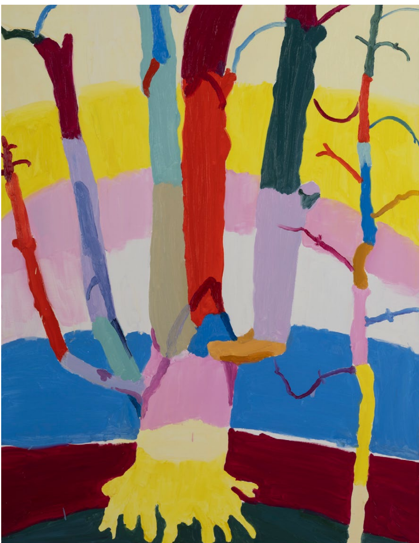
Same Blood 2024