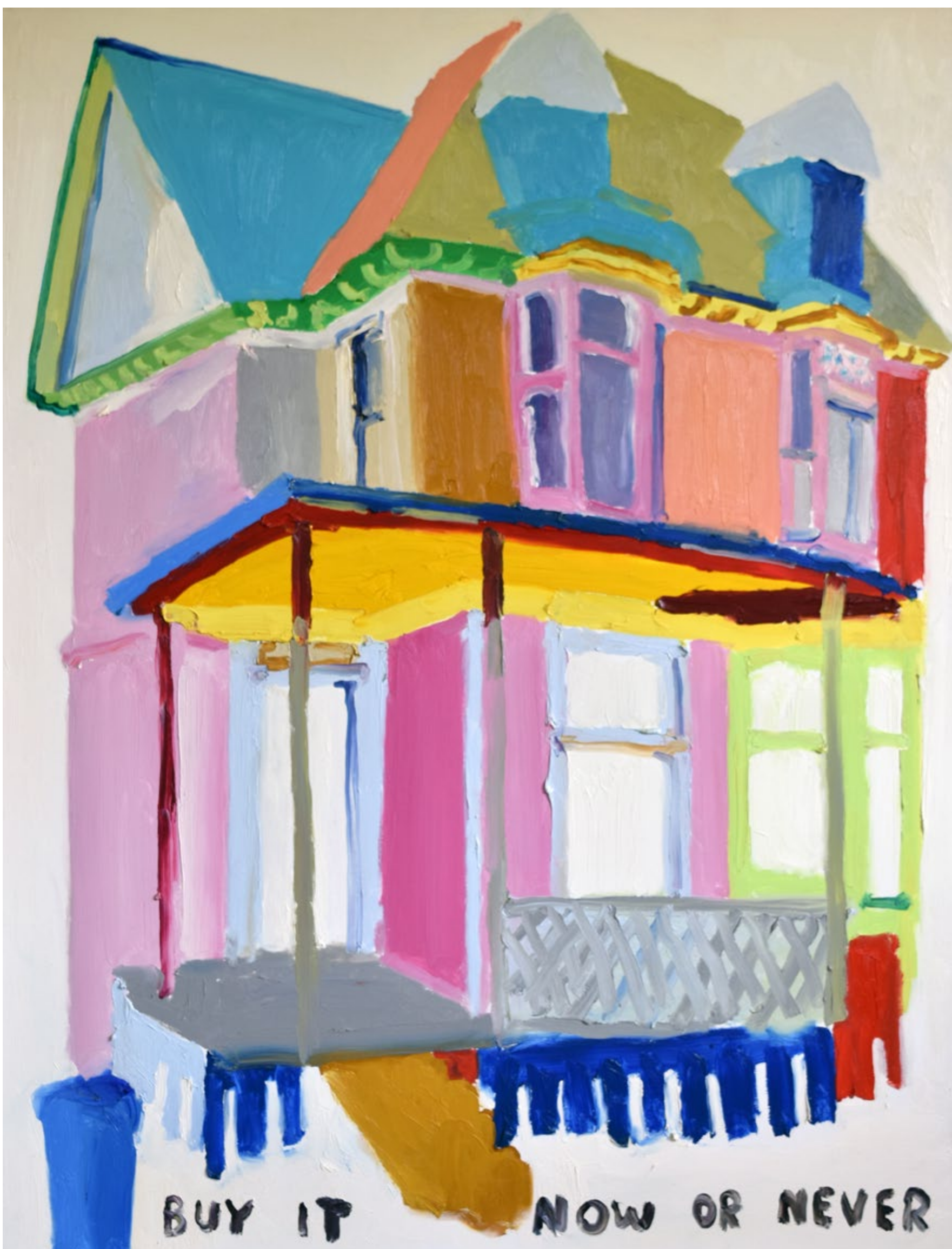
House 11 2023