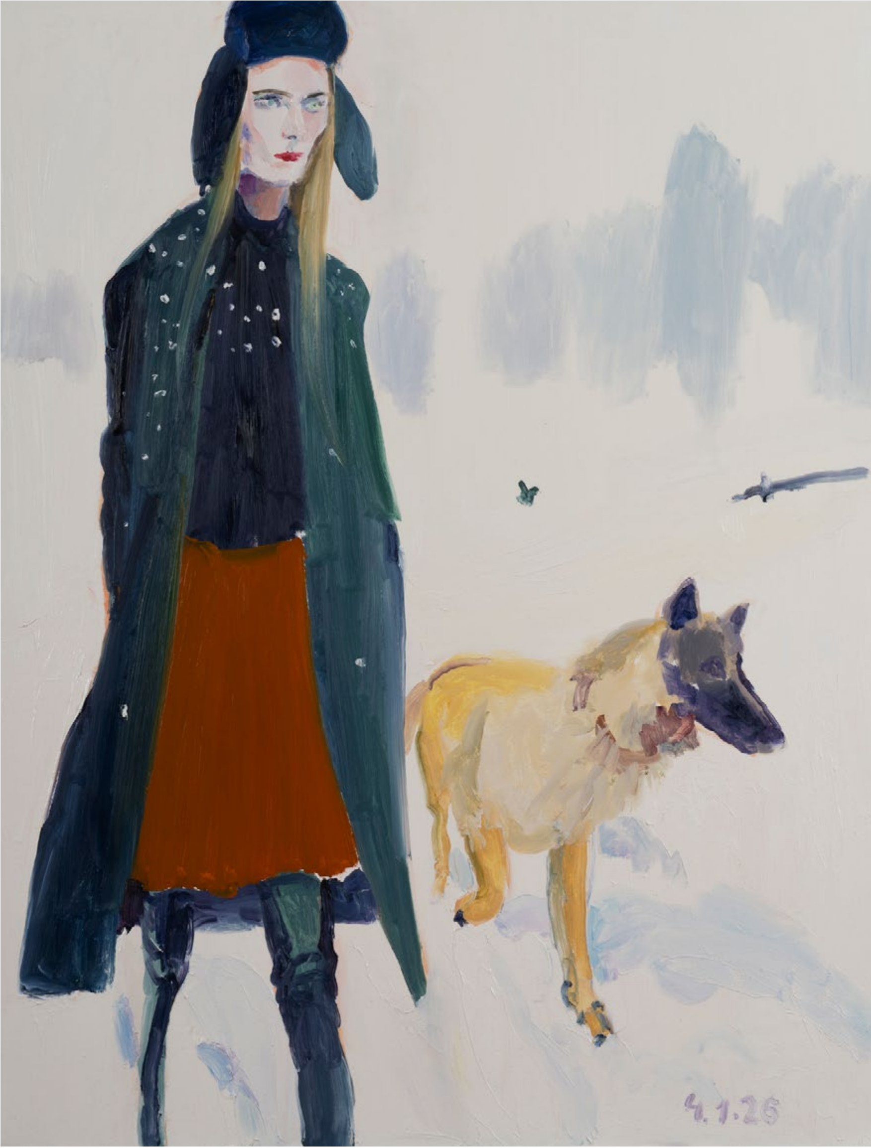
Best Friend 2026