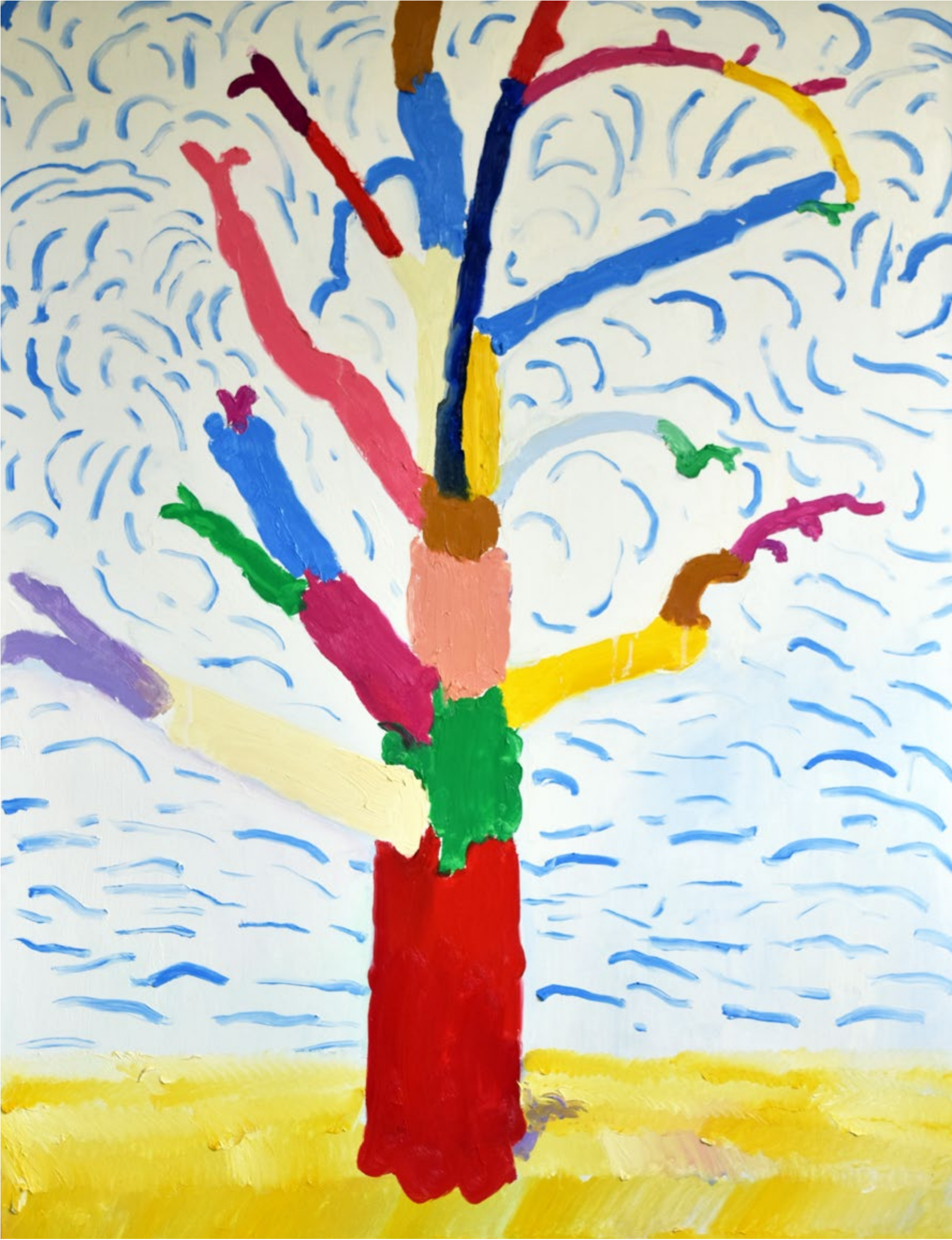
Van Van 2023