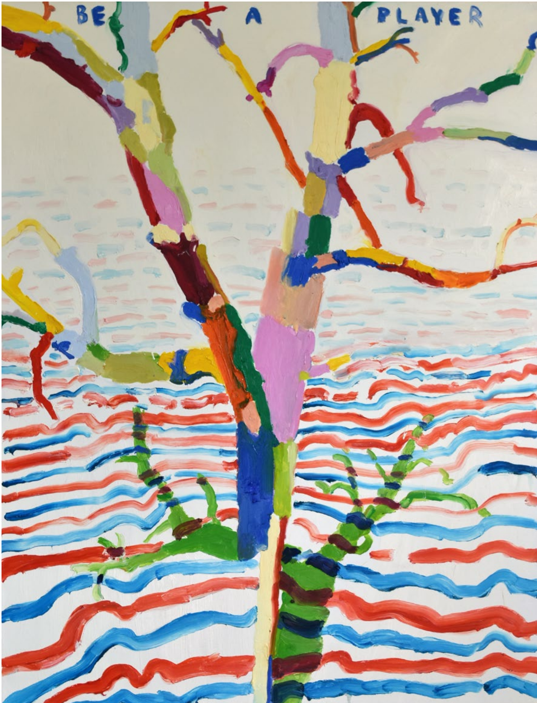
Be a Player 2023