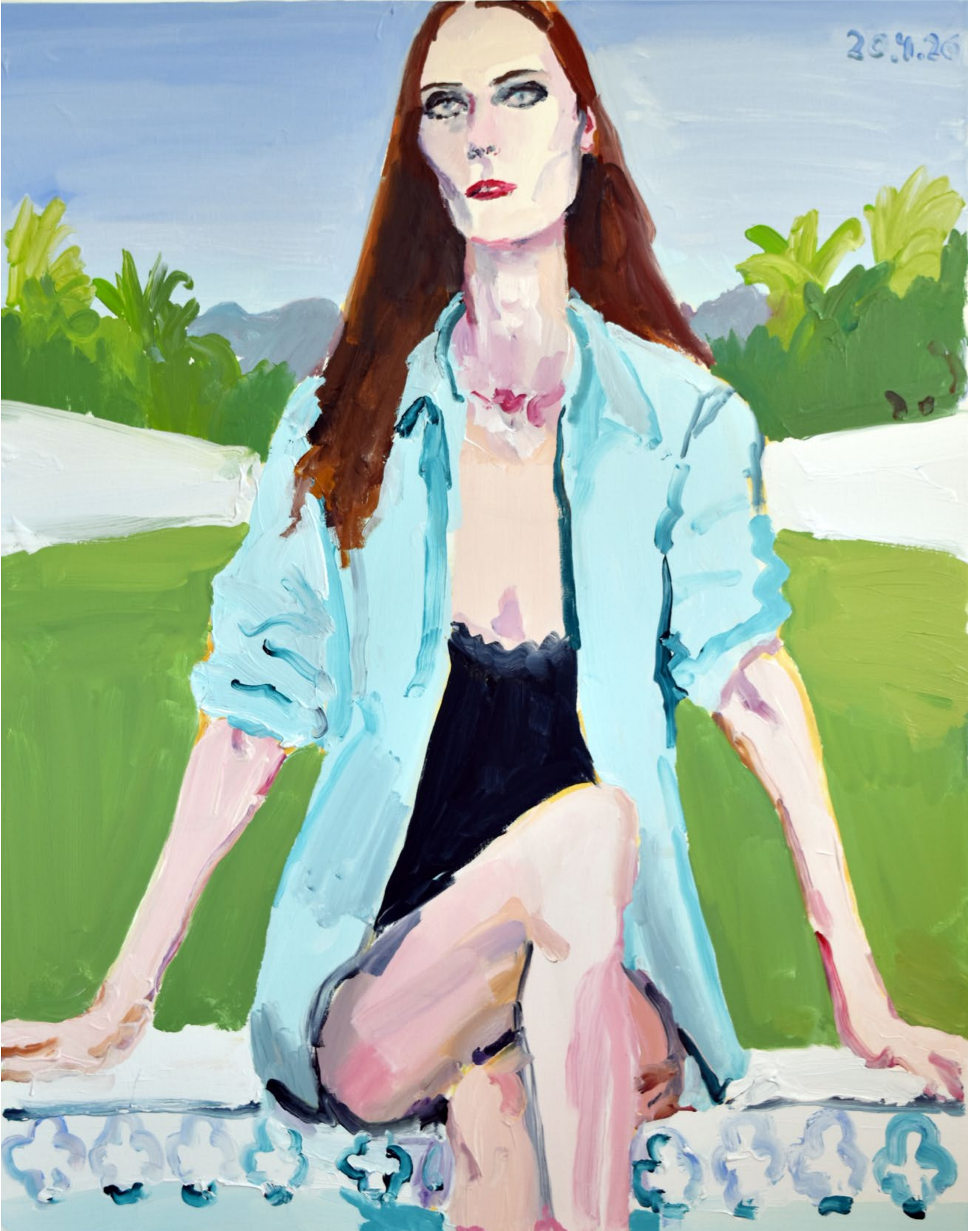
Au Bord 2020