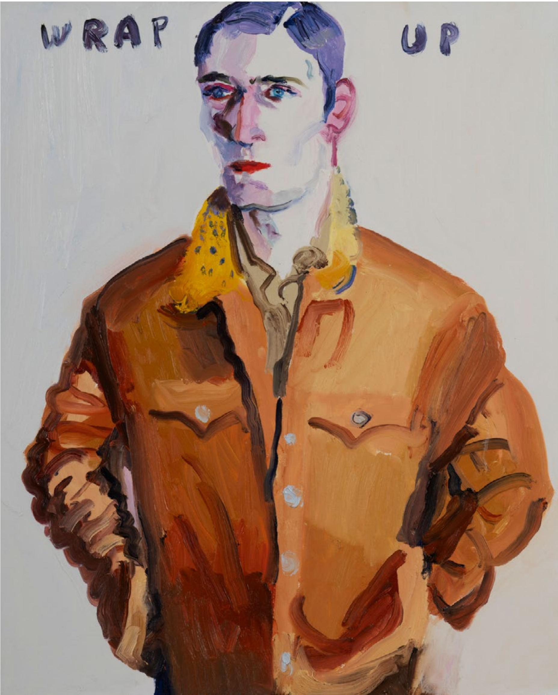
Wrap Up 2023