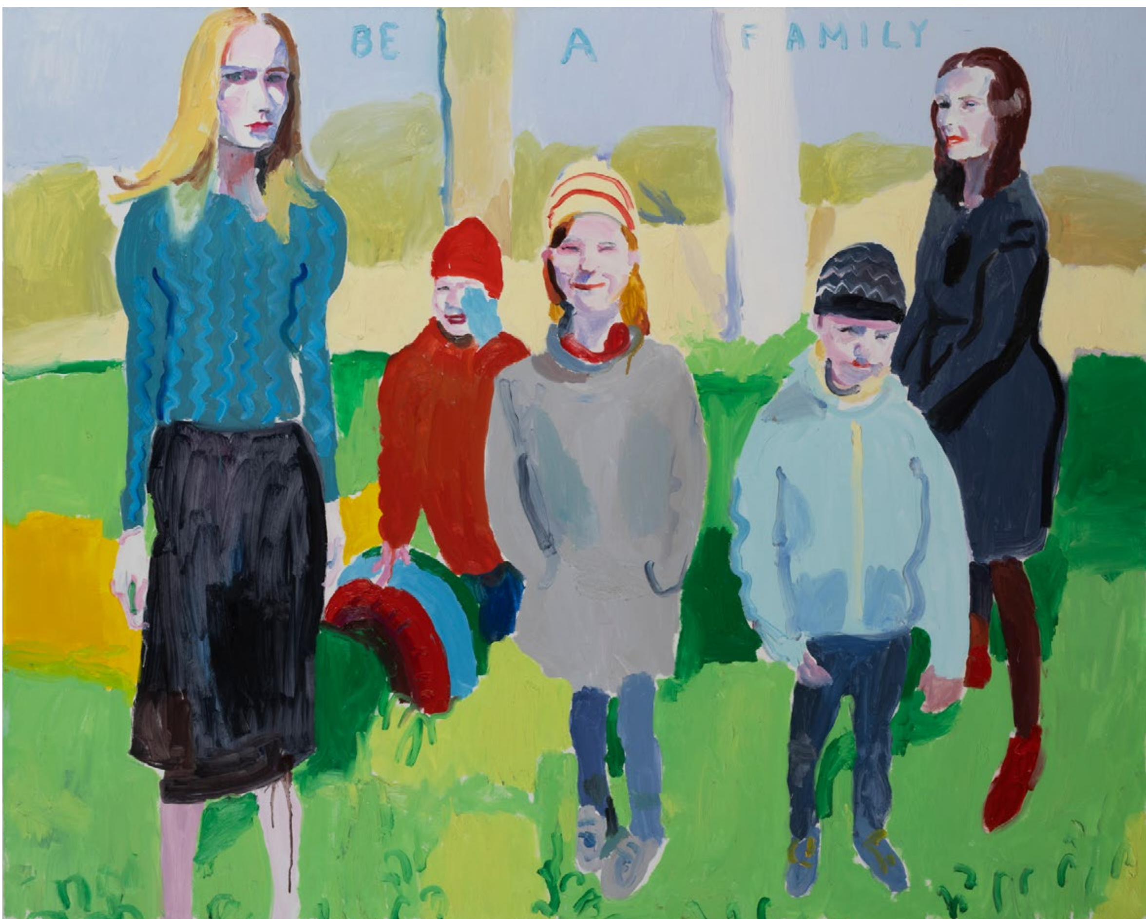
Be a Family 2023