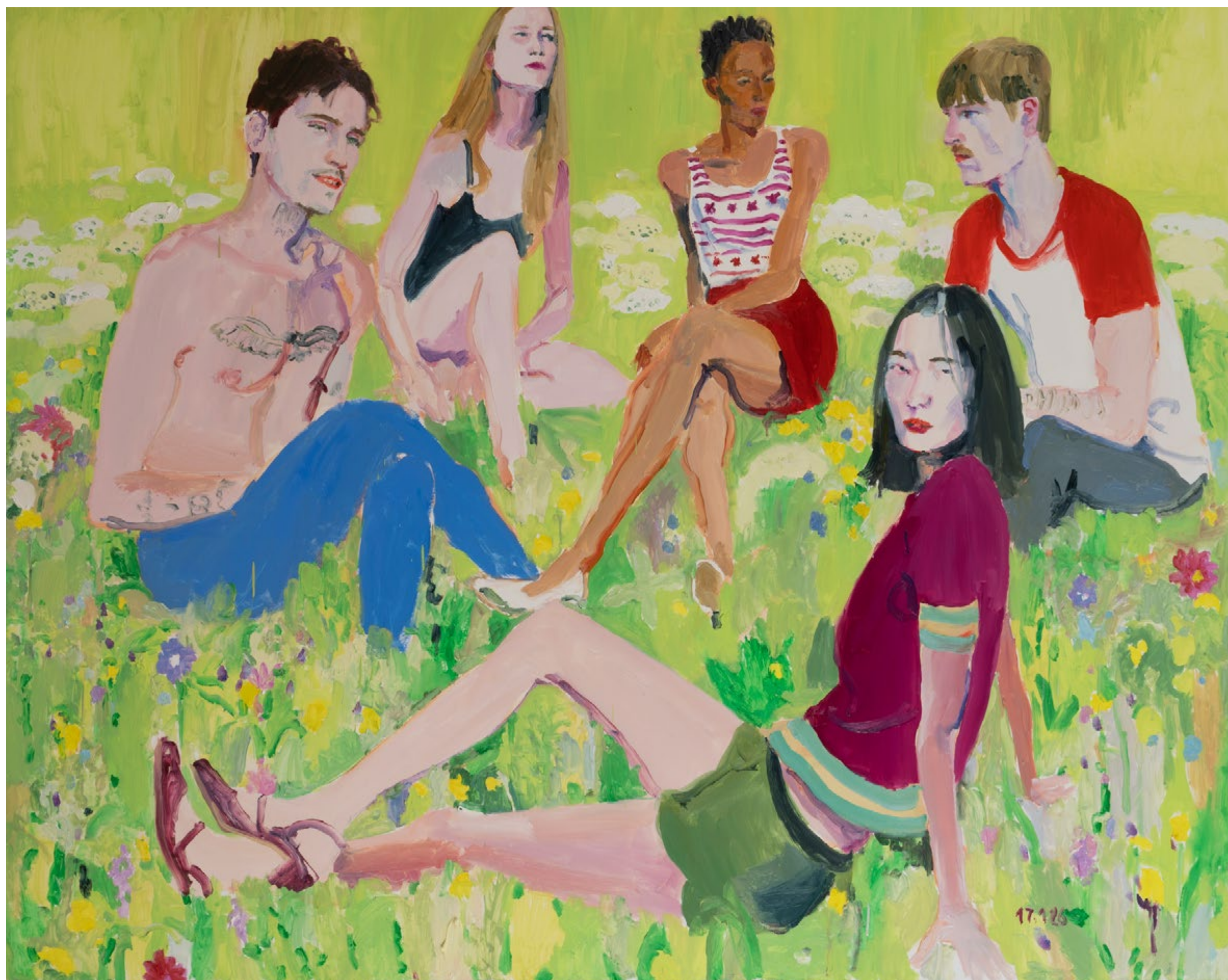
Green Grass 2026