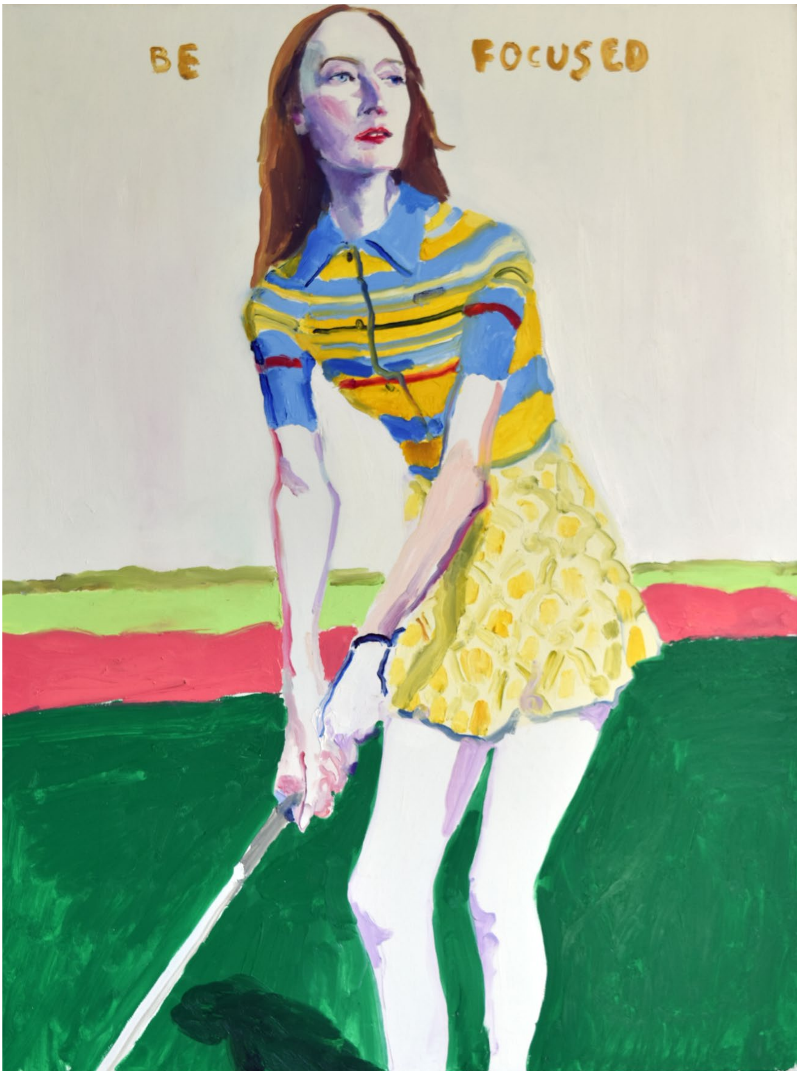
Be Focused 2023