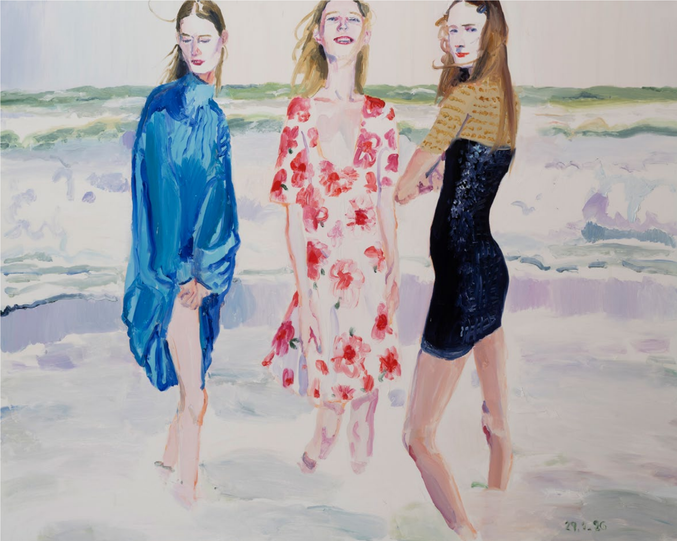
Three Graces 2026