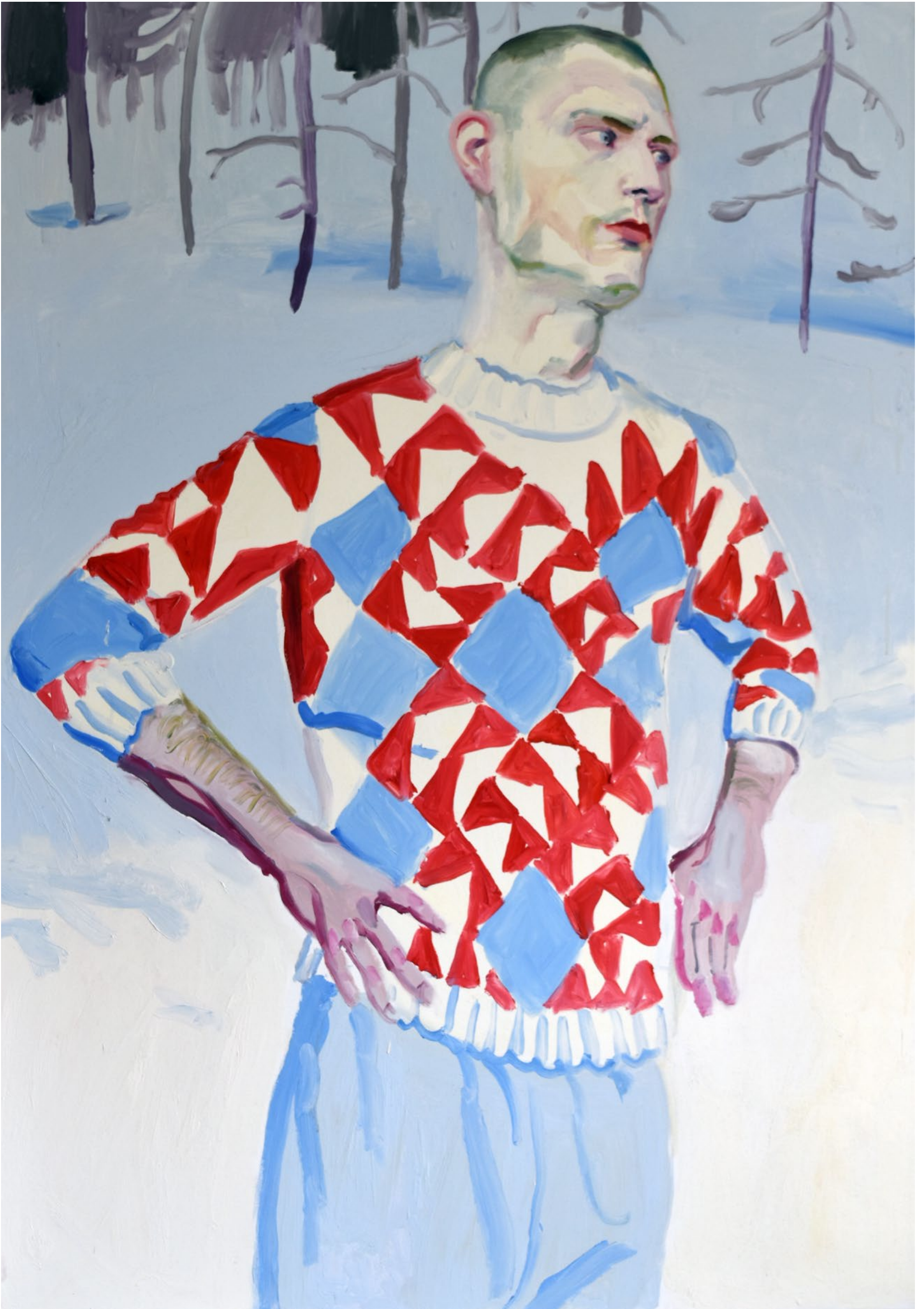
Last Christmas 2022