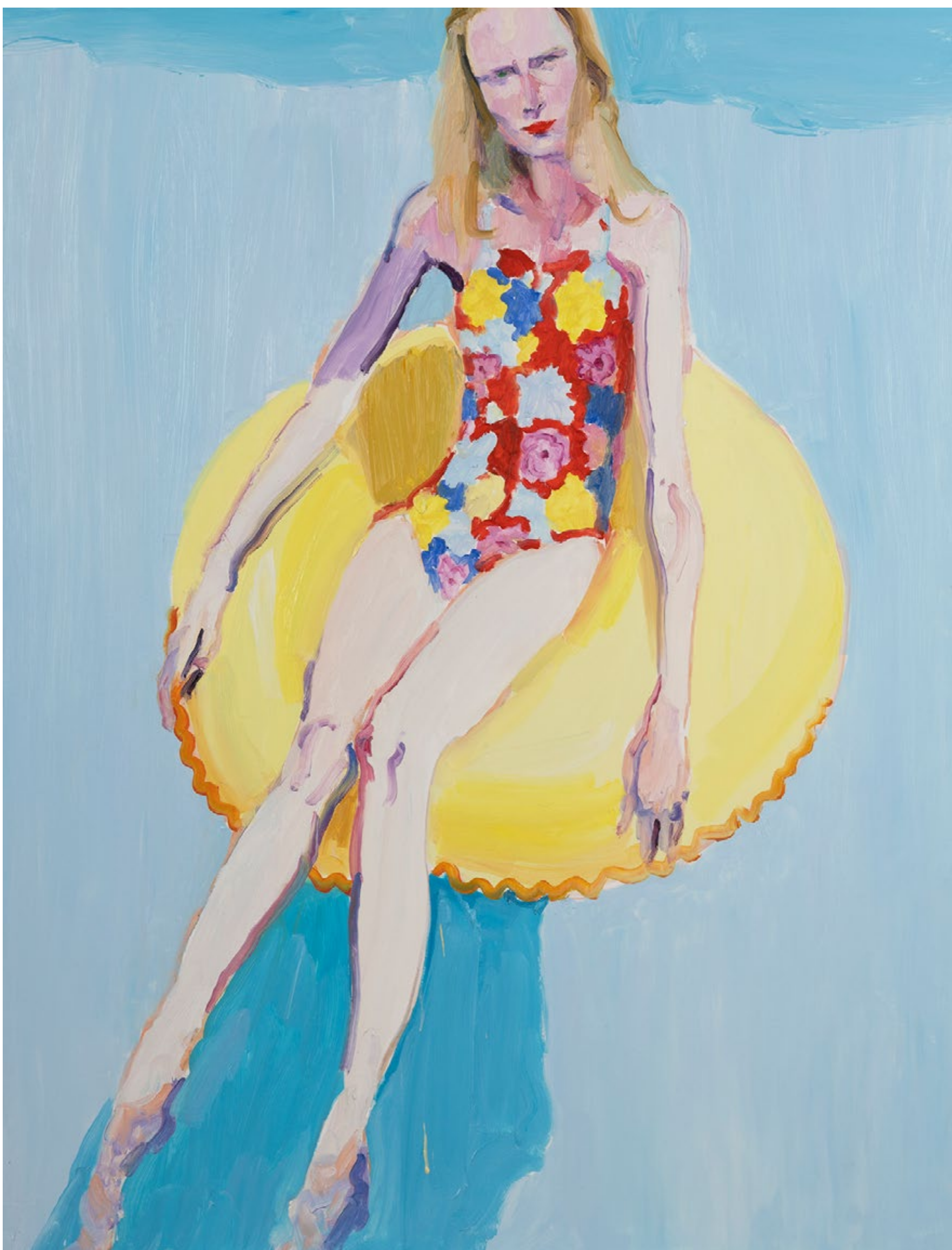
Pool Flower 2025