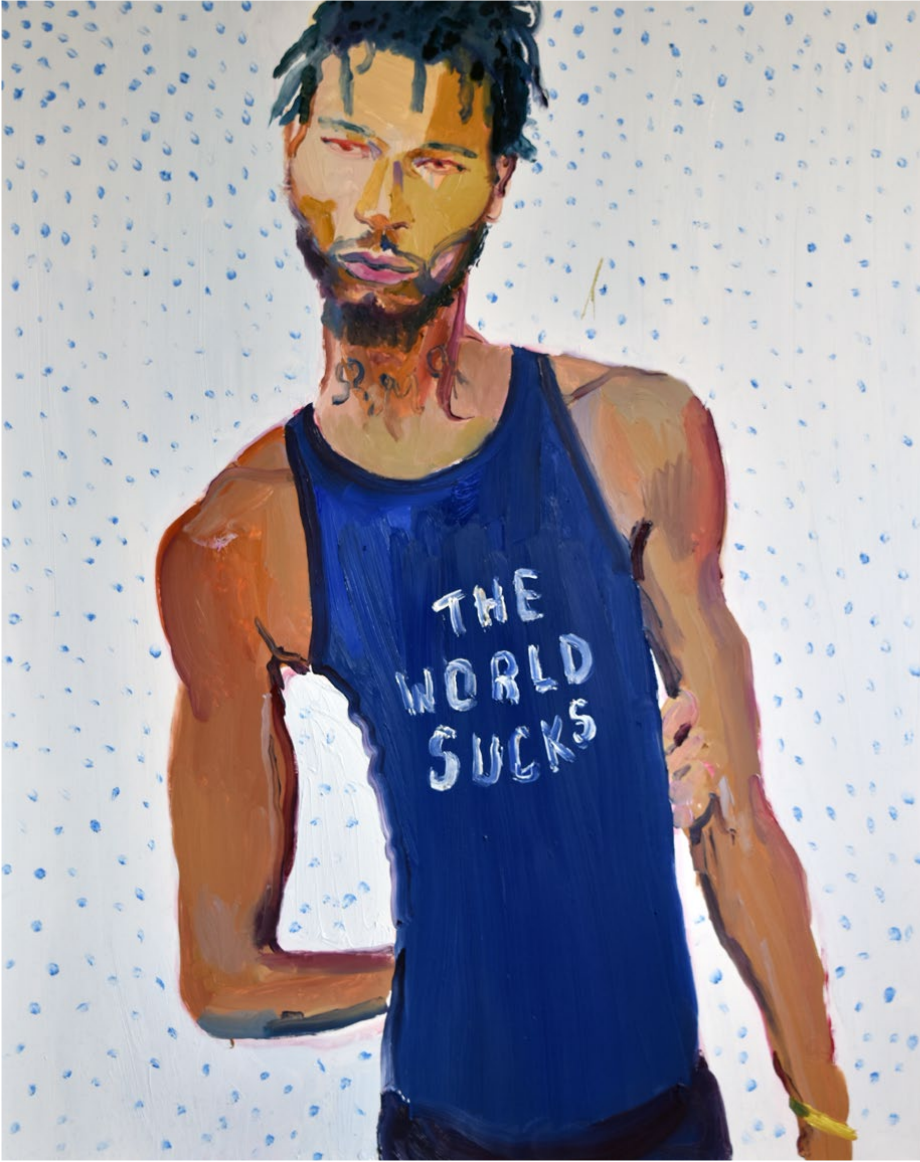
The World 2025