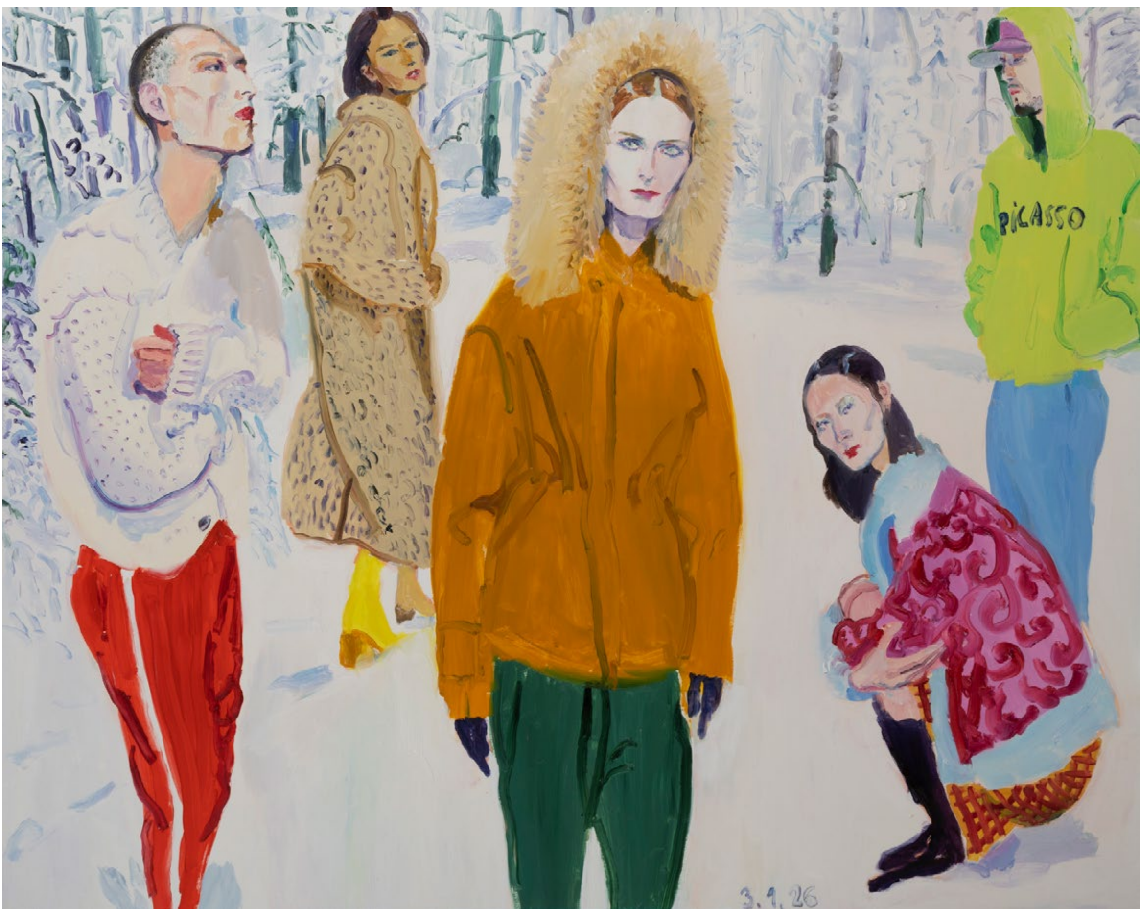
Cold Meeting 2026