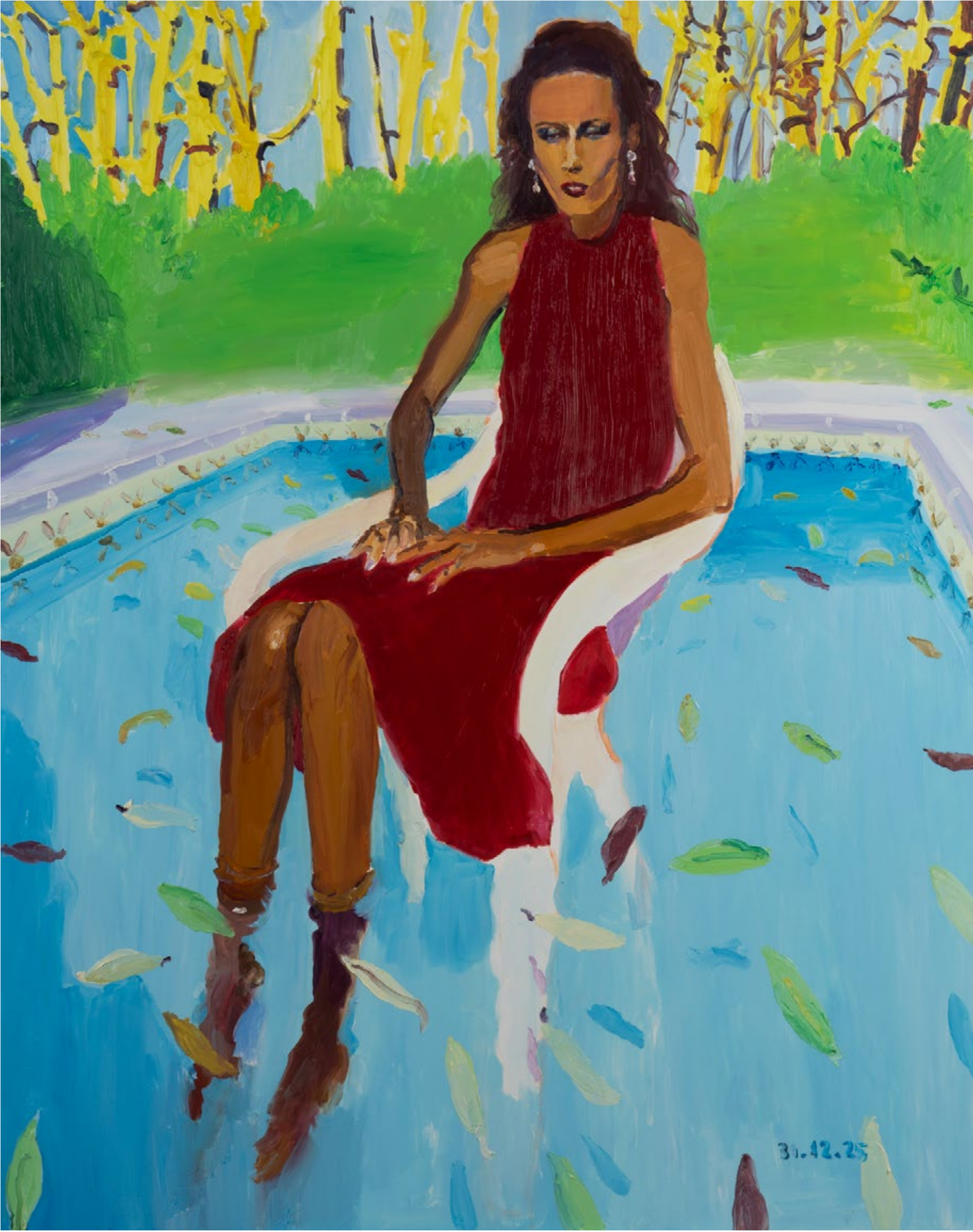
Leaves in the Pool 2025