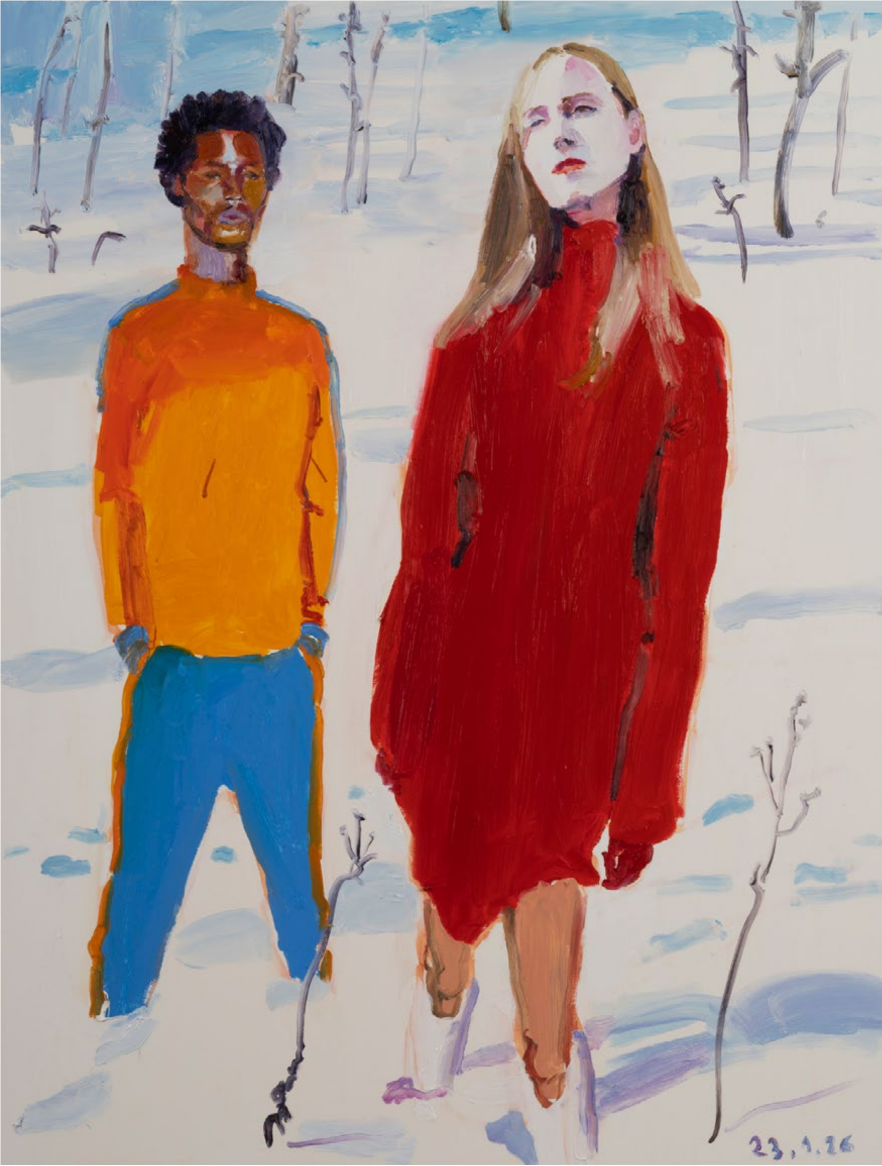
Cold Sun 2026