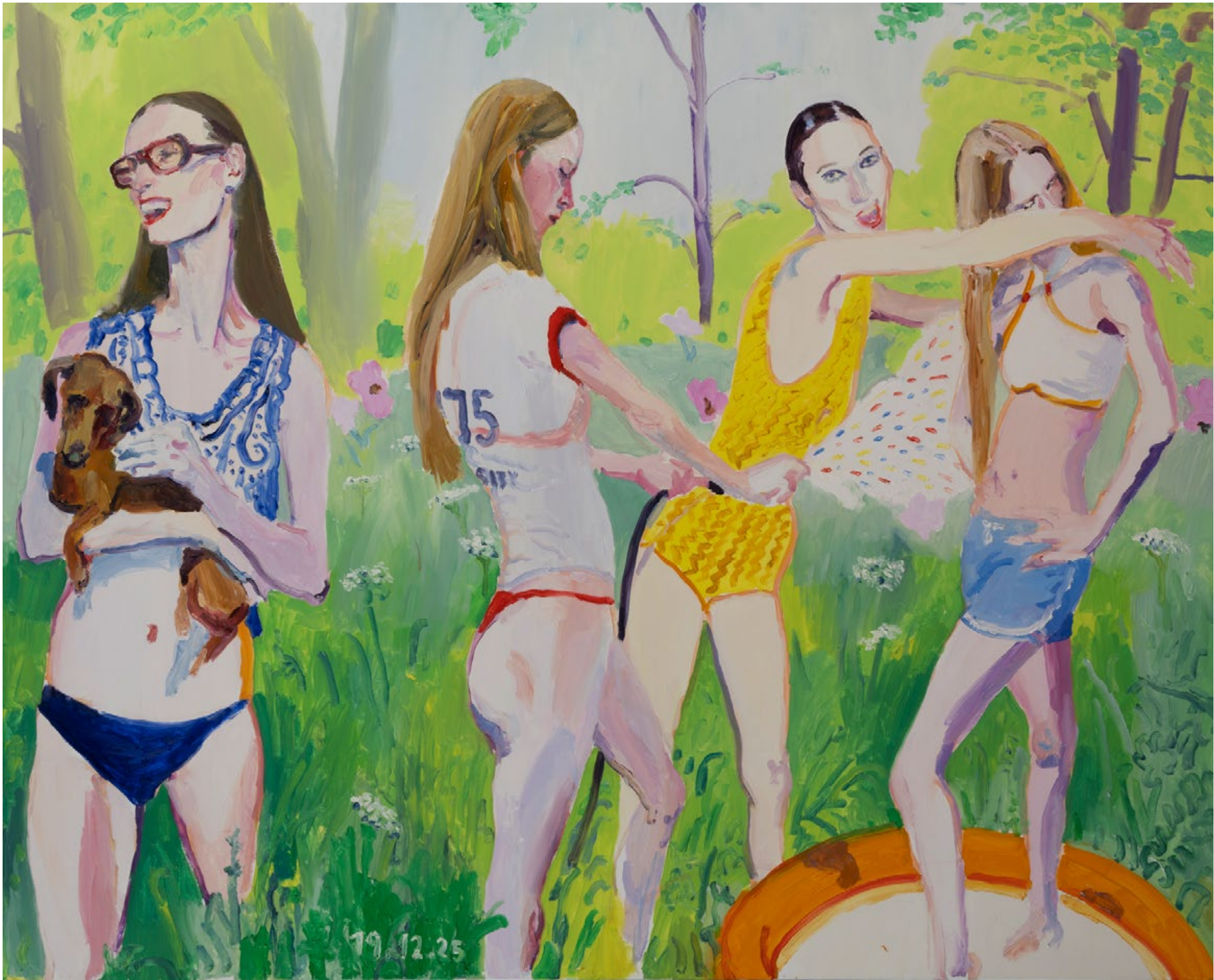
Hot Meeting 2025