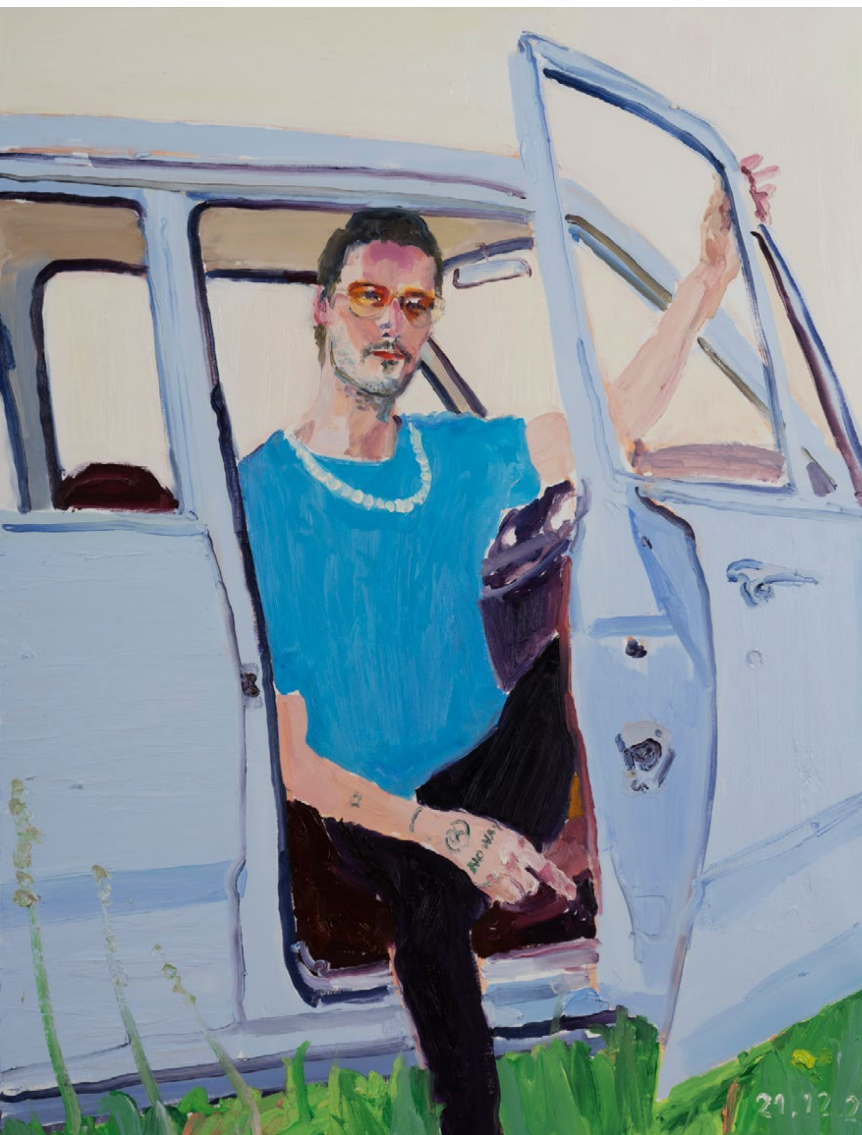
Blue Car 2026