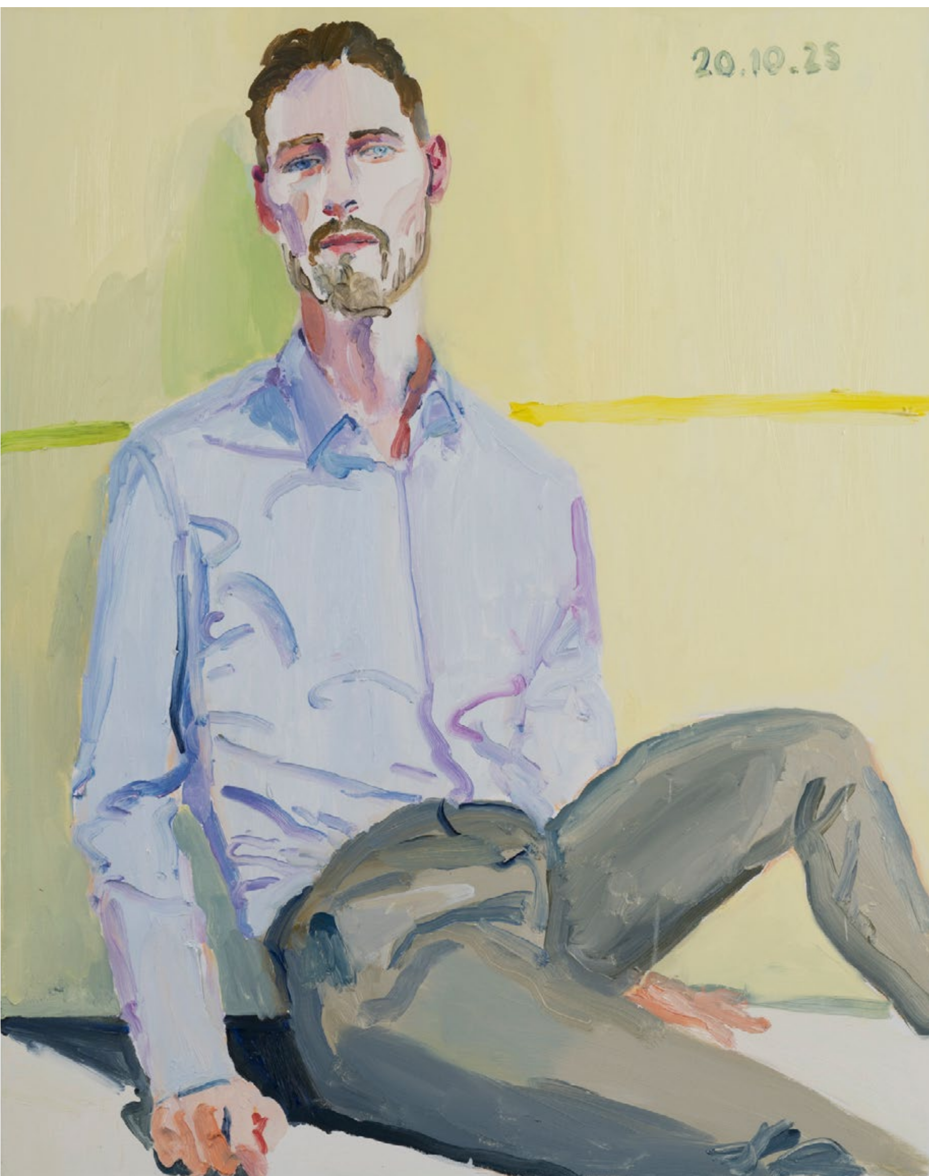
End of Summer 2025