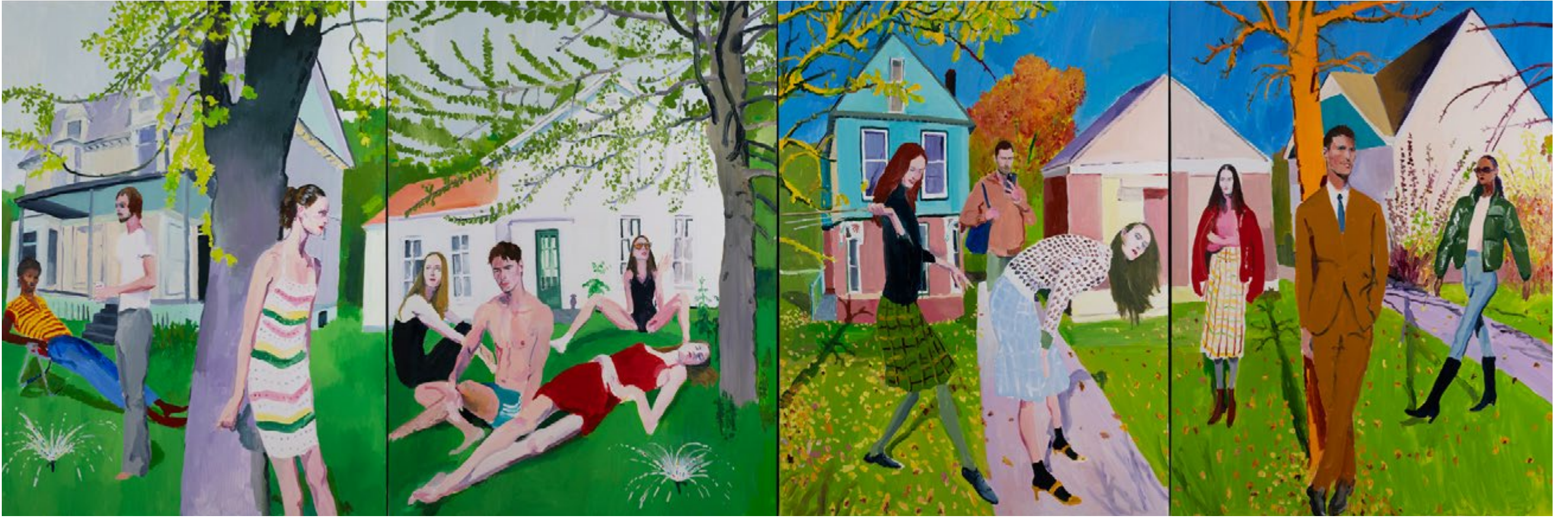
Street I 2026