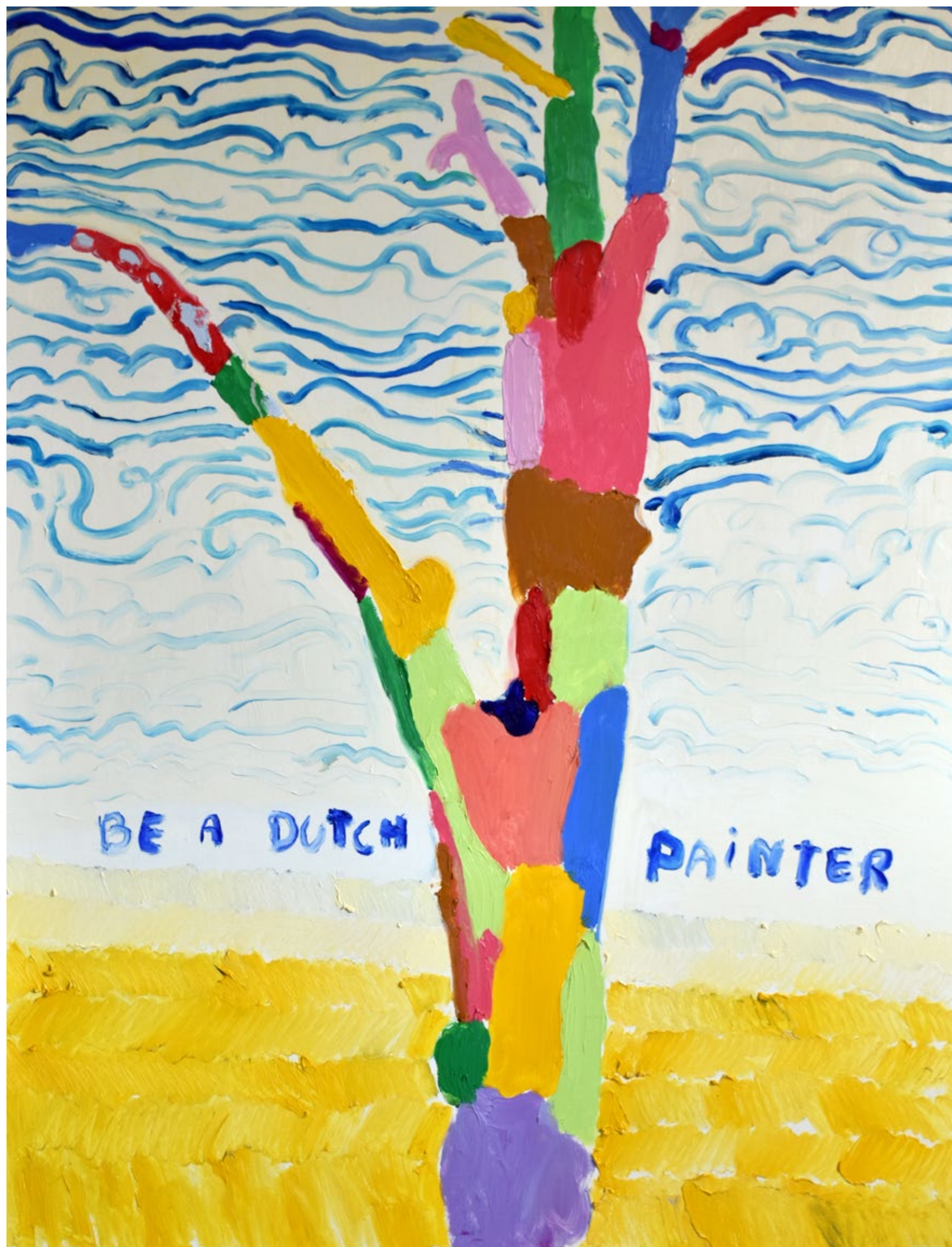
Be a Dutch Painter 2023