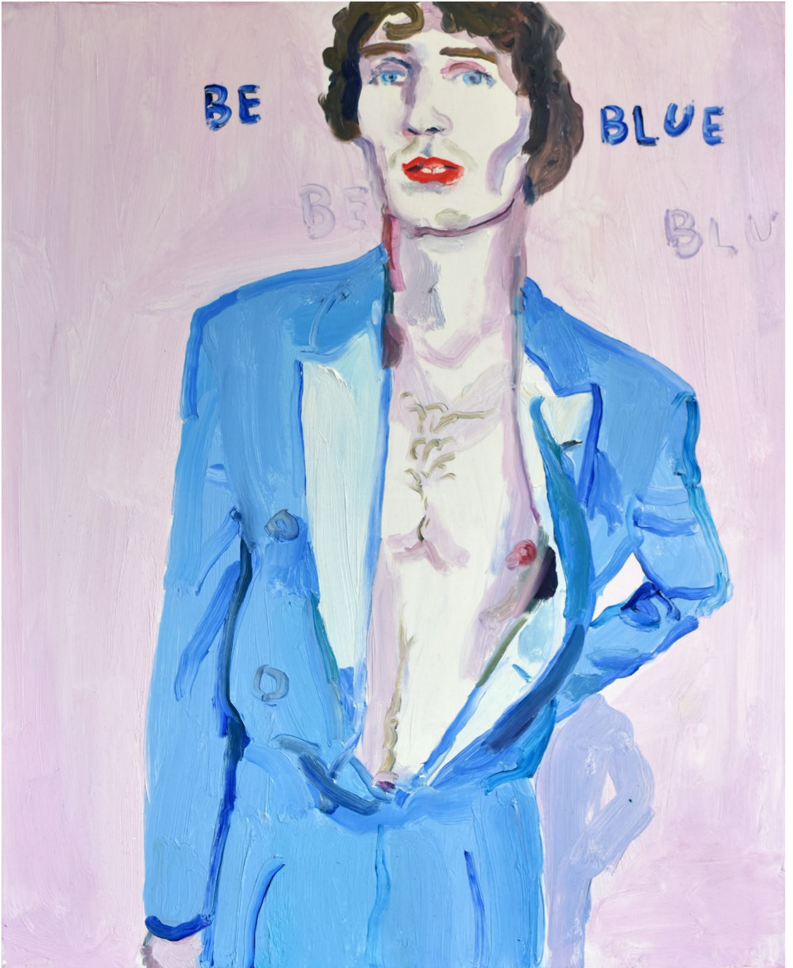
Be Blue 2023