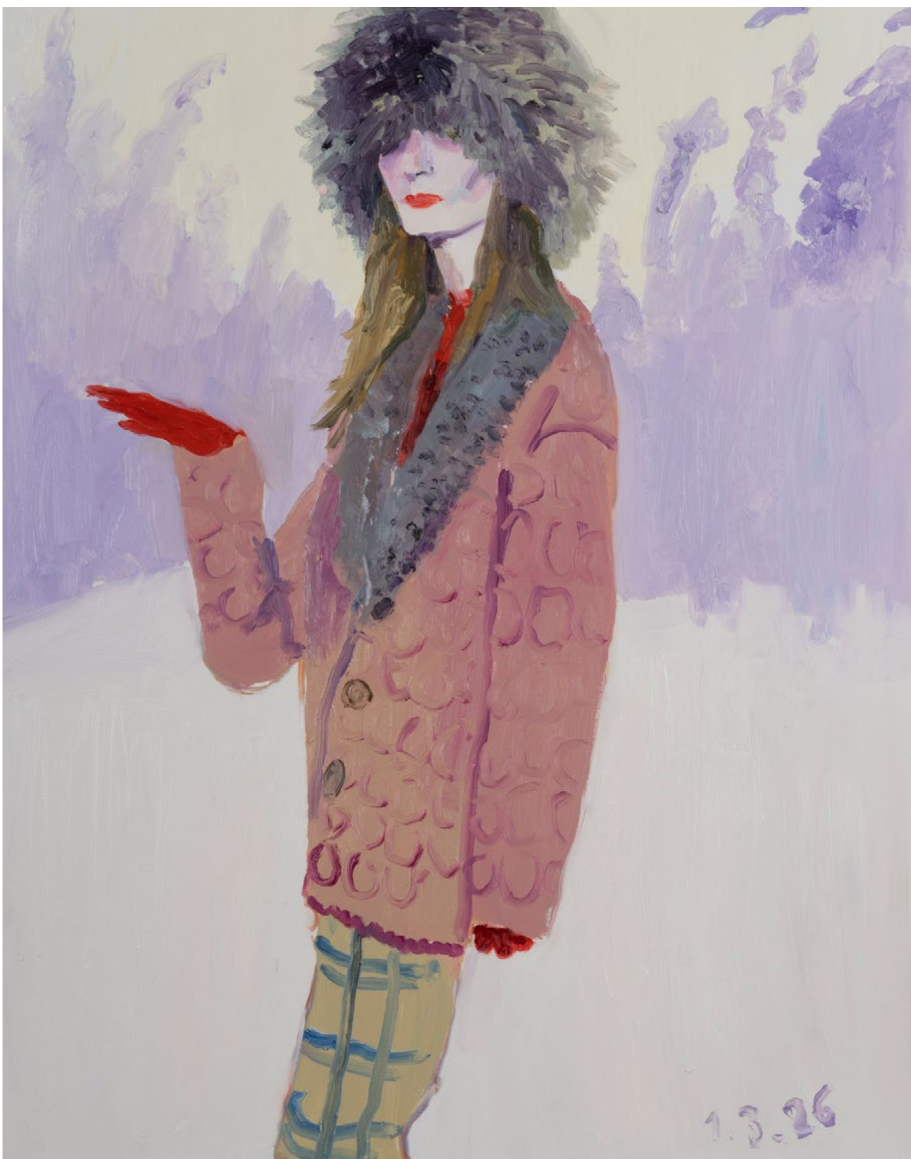
Cool Cold 2026