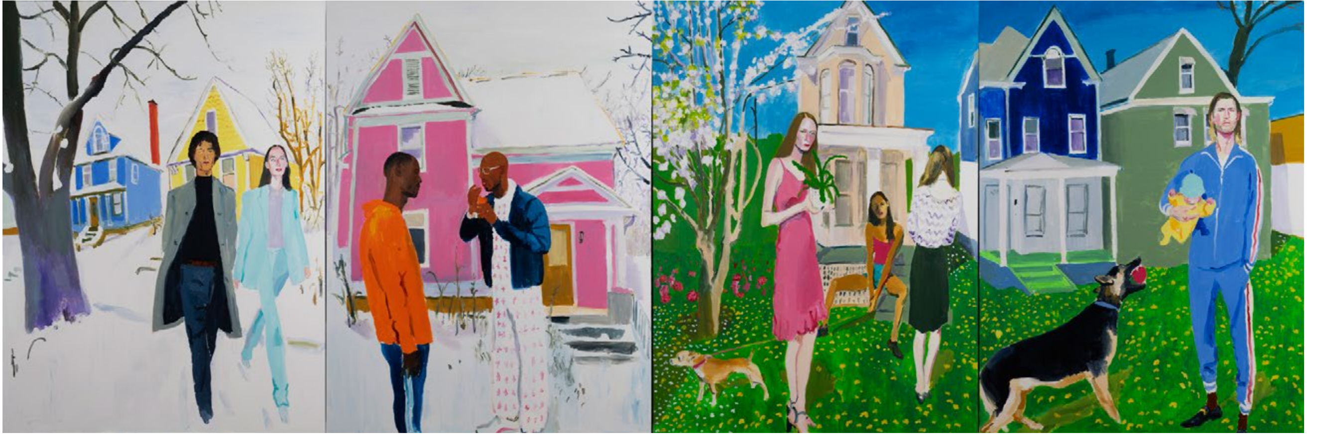
Street II 2026