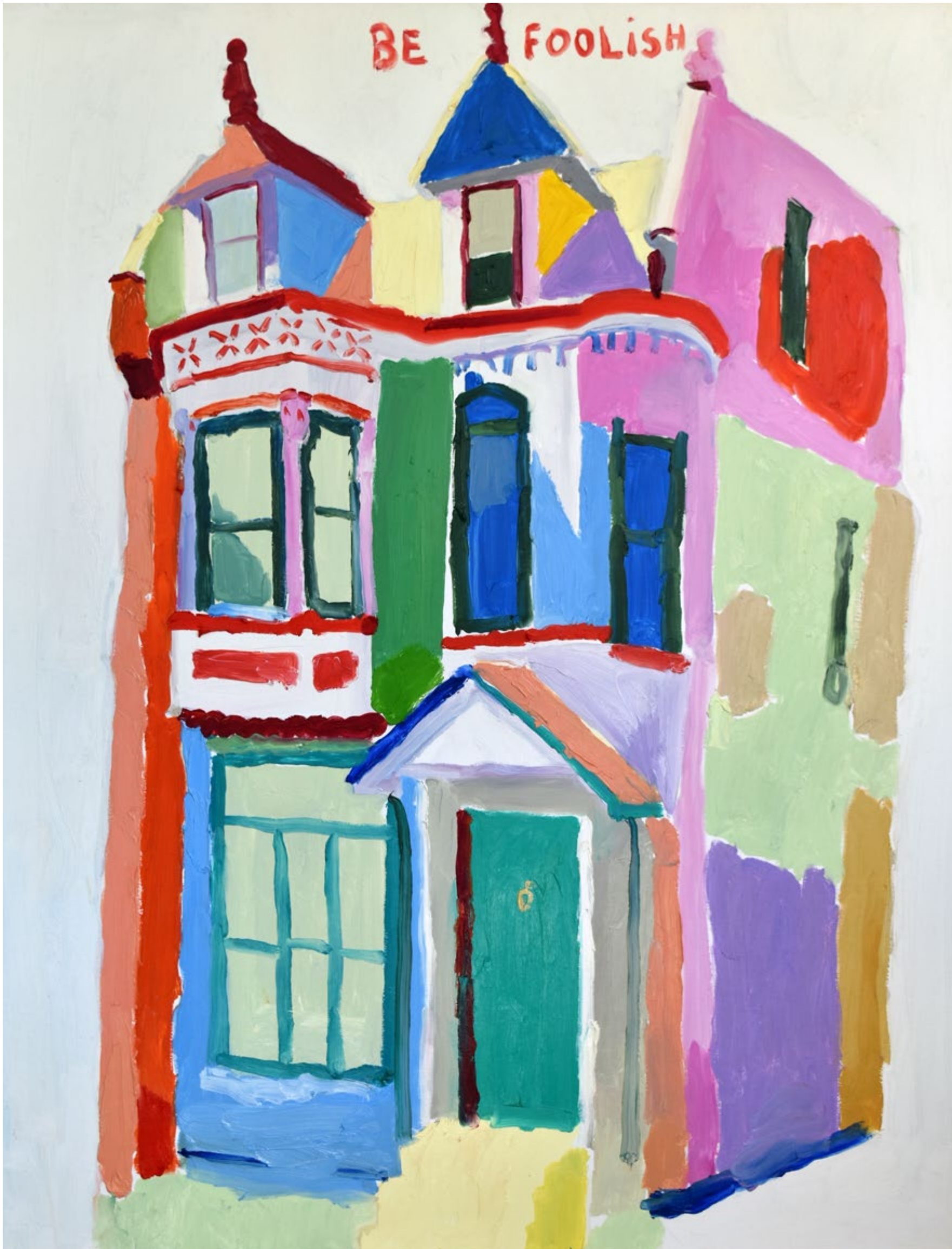
Be Foolish 2023