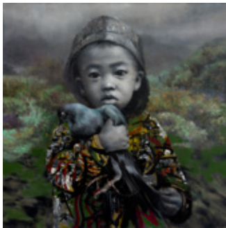
20 — 21 MY LITTLE DOVE IN FRONT OF THE GREEN FOREST 2023