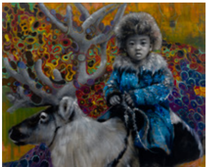
28 — 29 RIDING ON A WHITE REINDEER 2023