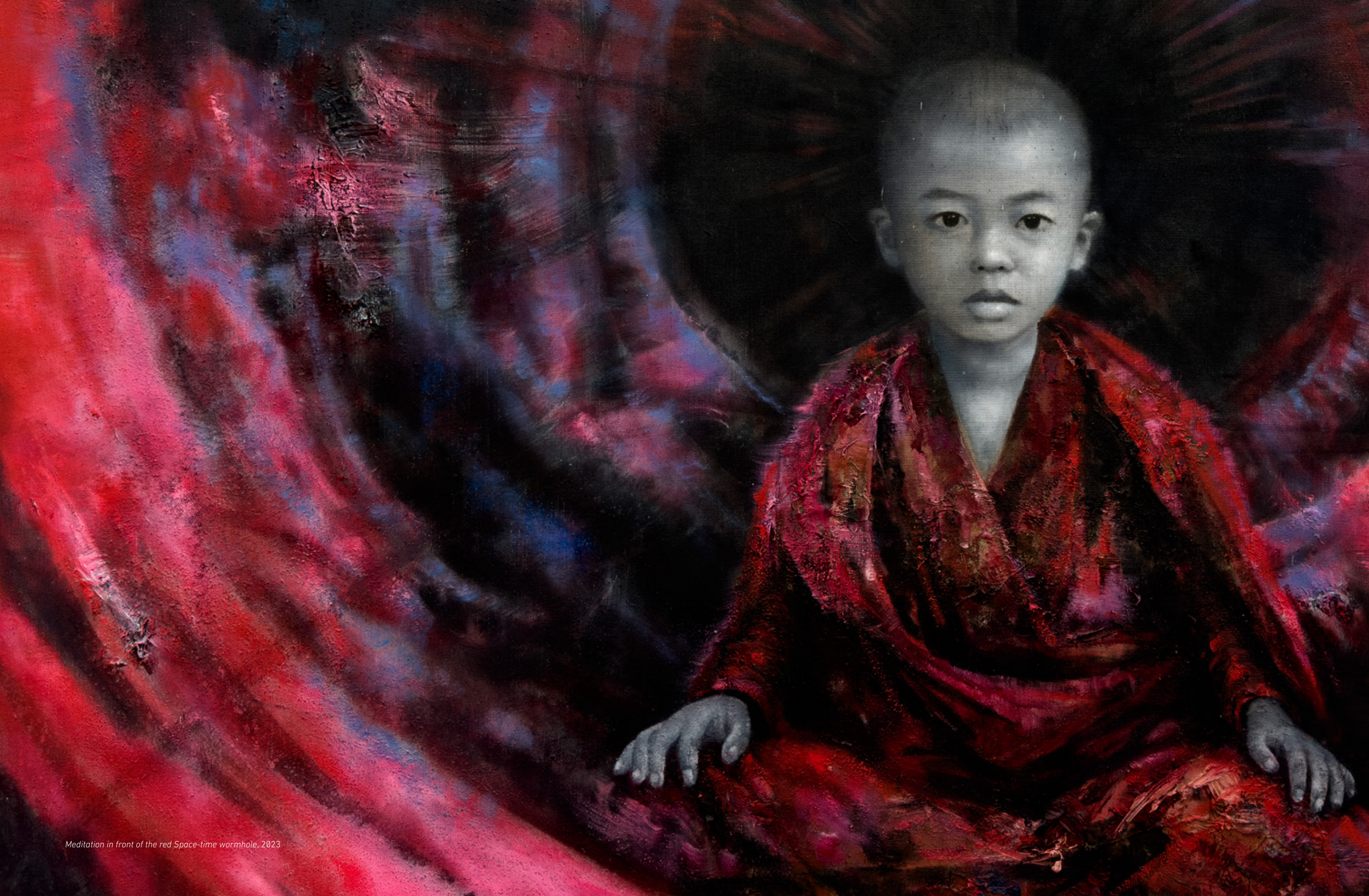
Meditation in front of the red Space-time wormhole, 2023