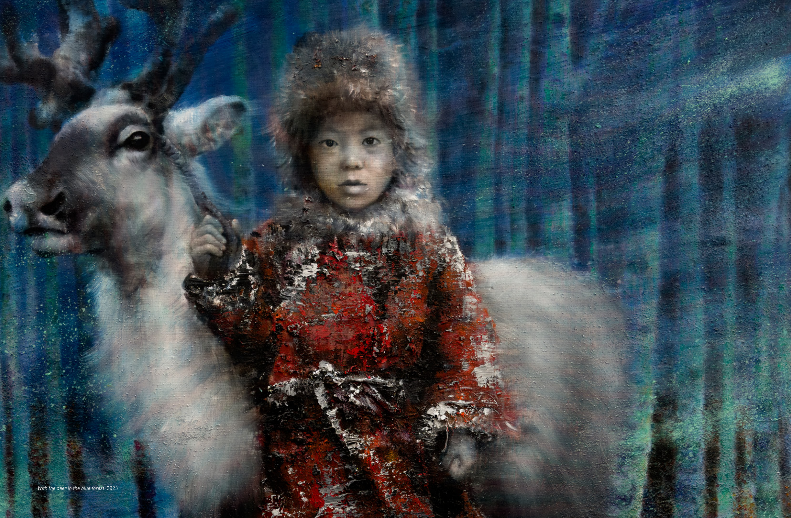
With the deer in the blue forest, 2023