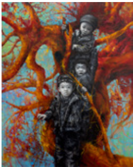
42 — 43 THREE CHILDREN IN A RED TREE 2023