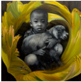
32 — 33 SNUGLING WITH A LAMB IN FRONT OF YELLOW FLOWERS 2023