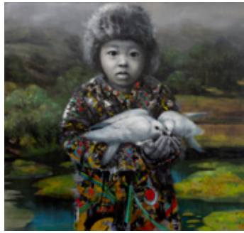
30 — 31 SELF-PORTRAIT WITH TWO WHITE PIGEONS 2023