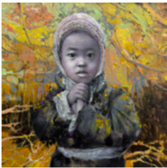
50 — 51 A HINT OF AUTUMN 2023