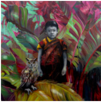
36 — 37 STANDING WITH AN OWL IN FRONT OF A COLORFUL BANANA TREE 2023