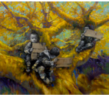
24 — 25 READING THE NEWSPAPER IN THE BIG YELLOW TREE 2023