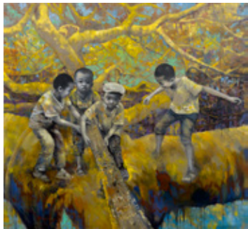
40 — 41 THE LONG BOARD GAME ON THE YELLOW TREE 2023