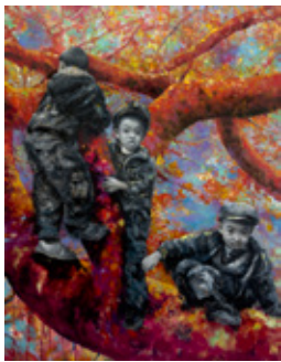
14 — 15 CLIMBING ON THE RED TREE 2023