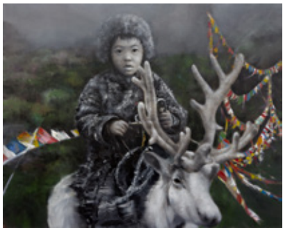
26 — 27 RIDING A WHITE DEER 2023