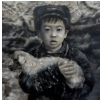
38 — 39 THE LITTLE LAMB IN FRONT OF THE SNOWY TREE 2023