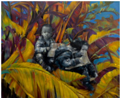
22 — 23 READING IN THE BANANA TREES 2023