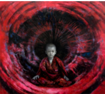
18 — 19 MEDITATION IN FRONT OF THE RED SPACE-TIME WORMHOLE 2023