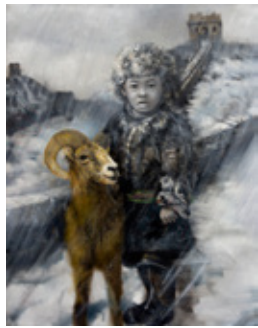
44 — 45 WHITE SNOW AND MY GOAT LEAN TOGETHER 2023