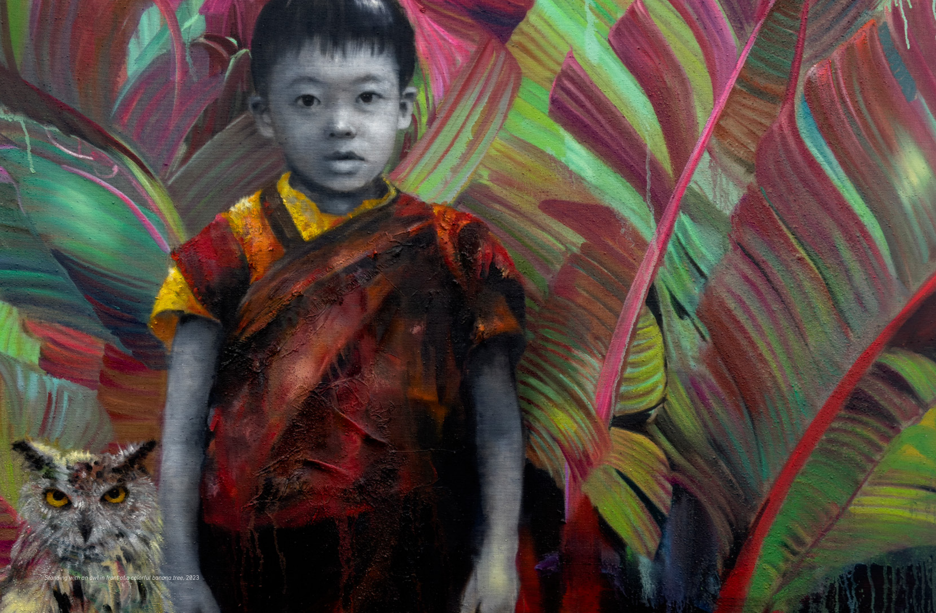
Standing with an owl in front of a colorful banana tree, 2023