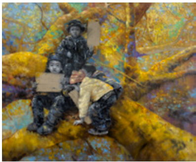
12 — 13 CHILDREN HOLDING SIGNS IN FRONT OF THE YELLOW TREE #2 2023