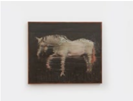
p. 69 Horse in Black on Maroon 2022