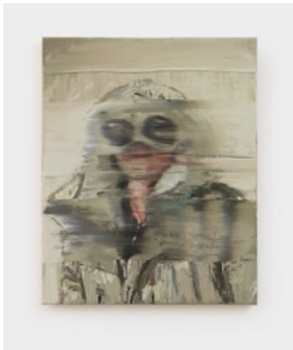
p. 19 It's Getting Stormy 2022