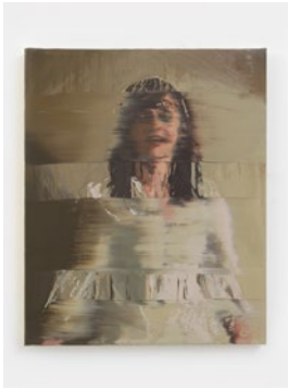
p. 39 The Laughing one 2022