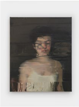
p. 63 Study for Portrait of P. in Black 2022