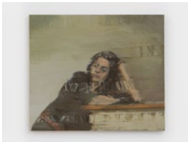
p. 55 Abstract Thoughts II 2022