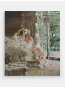
p. 51 Abstract Thoughts I 2022