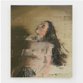
p. 35 Falling Out of the Shadow I 2022