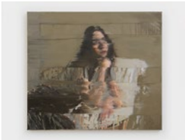
p. 65 Study of a Small Interior 2022