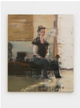
p. 29 Woman with Tape Deck 2022