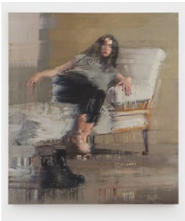
p. 17 Edge of Desire II 2022