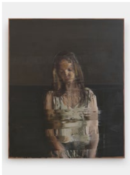
p. 33 Black on Maroon I 2022