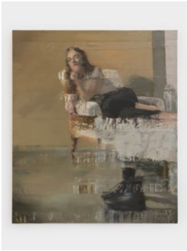
p. 41 Edge of Desire IV 2022