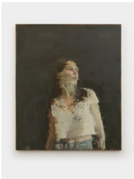
p. 67 Black on Maroon III 2022