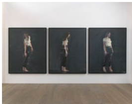
p. 21 Motion Study of Ella II 2022