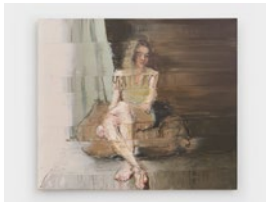
p. 27 In the Treehouse 2022