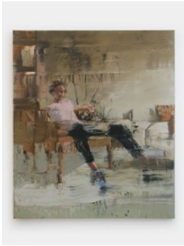
p. 43 Fragmented Chair 2022