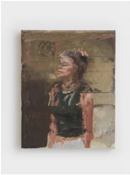
p. 53 Abstract Thoughts I 2022