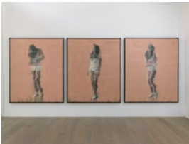
p. 23 The Painter's Room VII 2022