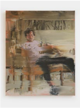
p. 45 Study for Fragmented Chair 2022