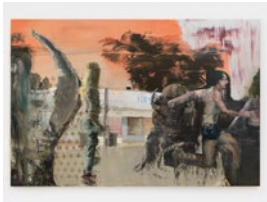
p. 31 Buffalo Dusk 2022