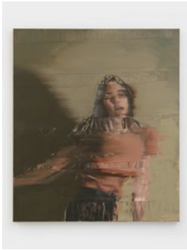
p. 37 Falling Out of the Shadow II 2022