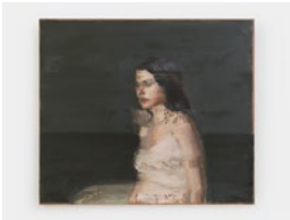
p. 47 Black on Maroon II 2022