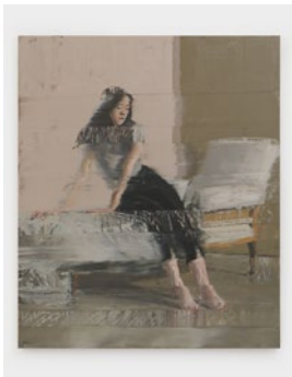
p. 25 Edge of Desire III 2022