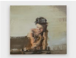
p. 57 Abstract Thoughts III 2022