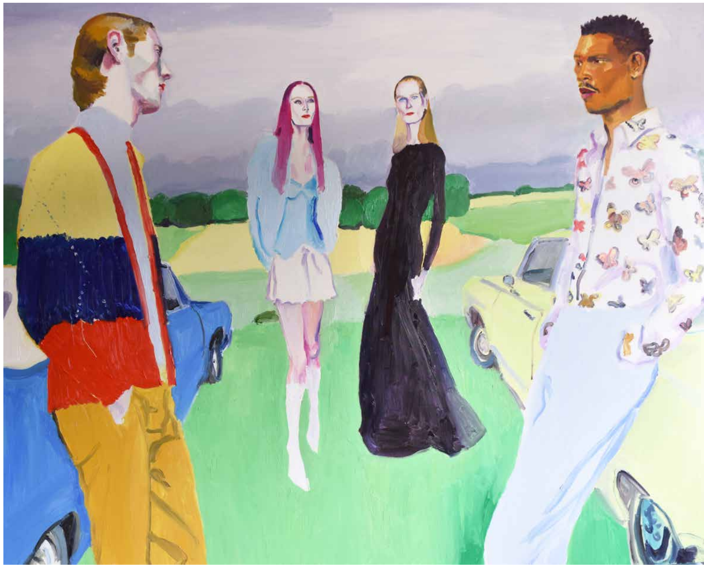
Meeting Point 2023

Oil on canvas 180 x 220 cm 70.9 x 86.6 in