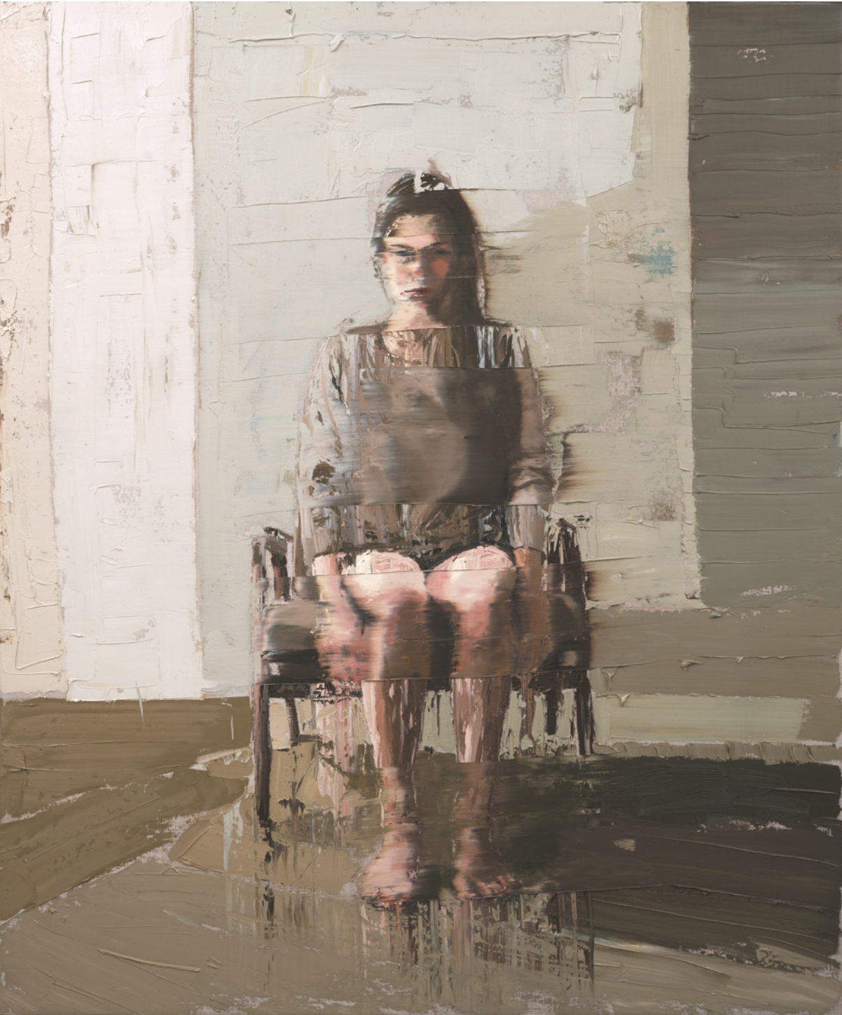
Woman on a Chair on White Gray, 2020

Oil on canvas 180 x 150 cm | 70.9 x 59.1 in