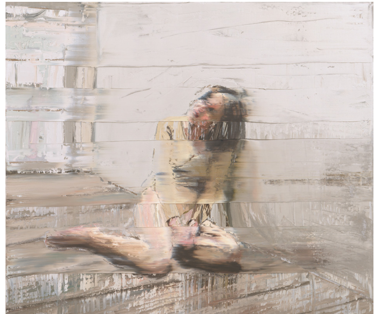
Fractured II, 2020 Oil on canvas 120 x 140 cm | 47.2 x 55.1 in