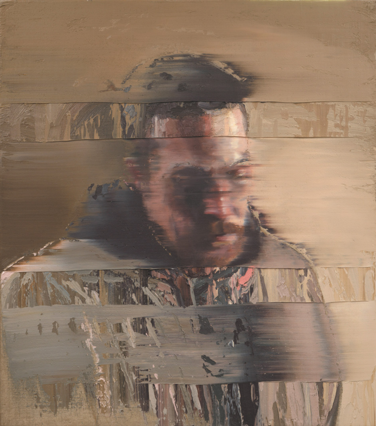
If I Could Tell You, 2020 Oil on canvas 80 x 70 cm | 31.5 x 27.6 in