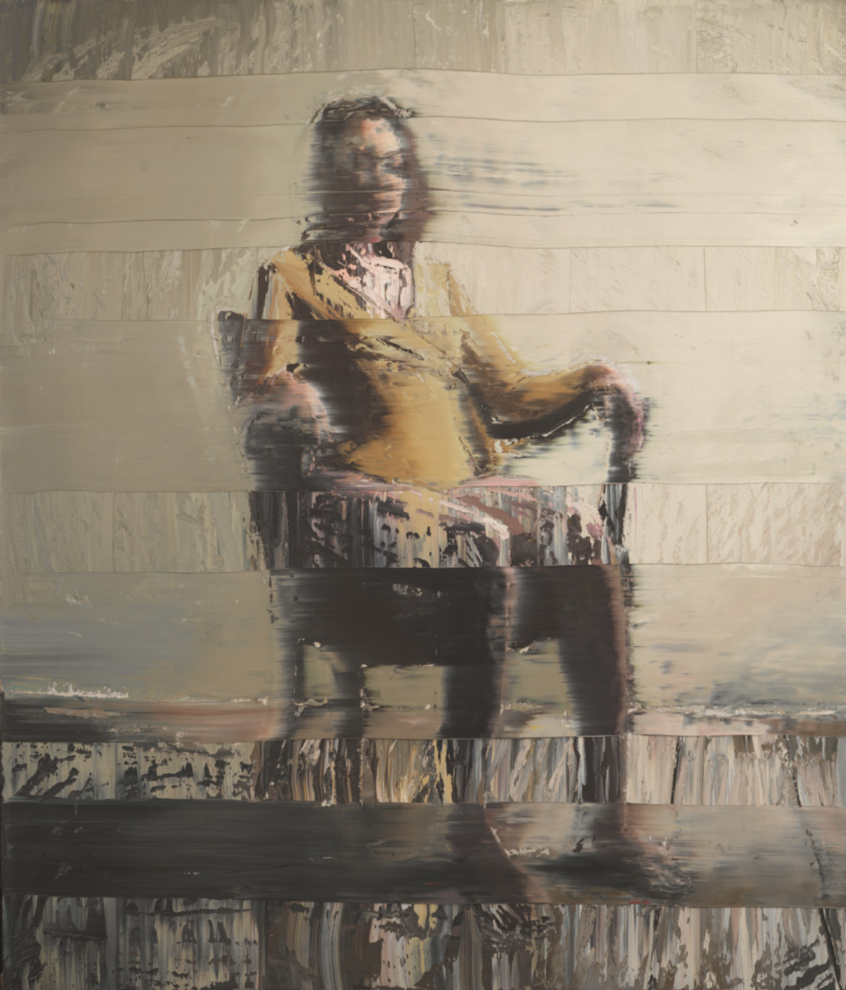
Girl With Olive Shirt on a Chair, 2020

Oil on canvas 140 x 120 cm | 55.1 x 47.2 in