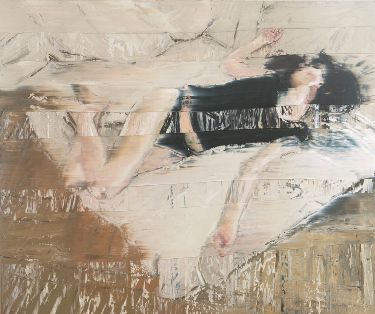
Fractured I, 2020

Oil on canvas 150 x 180 cm | 59.1 x 70.9 in