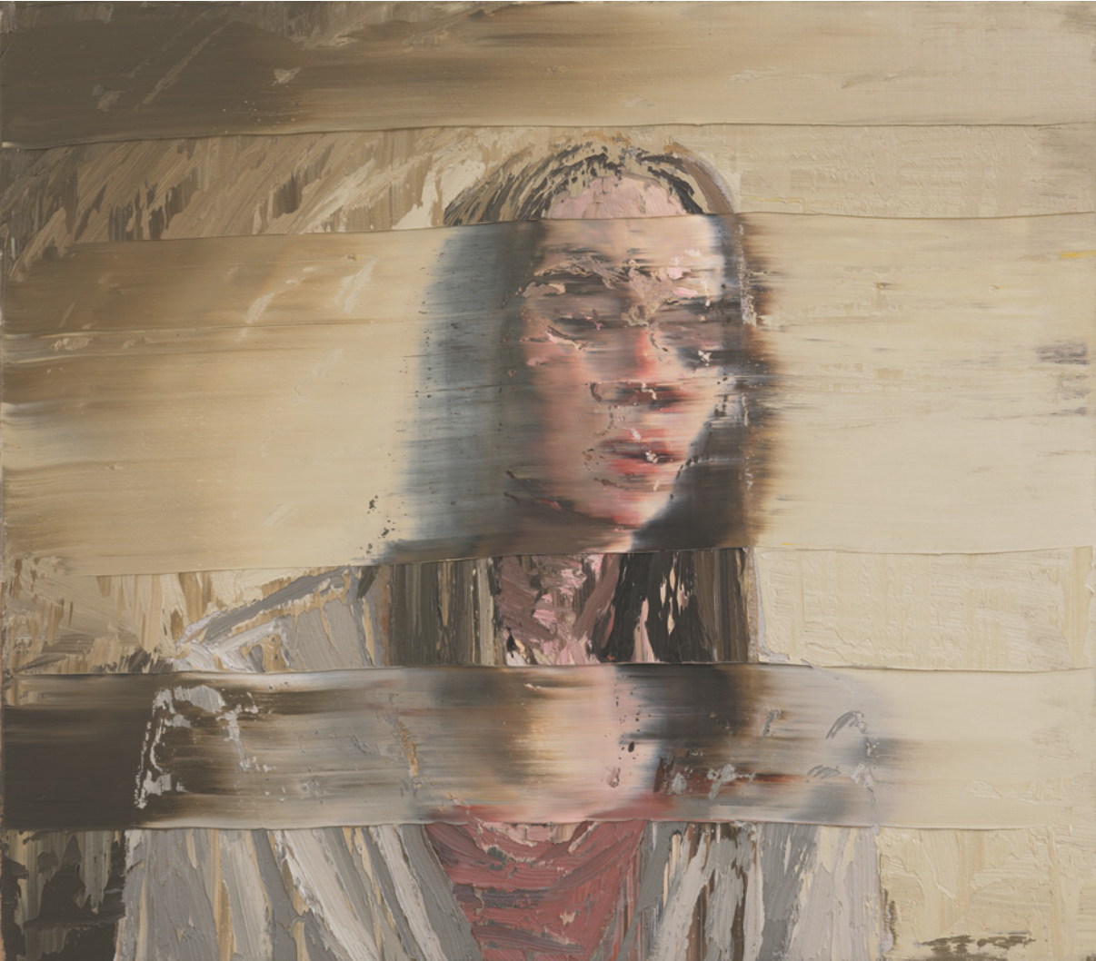
Fractured V, 2020

Oil on canvas 70 x 80 cm | 27.6 x 31.5 in