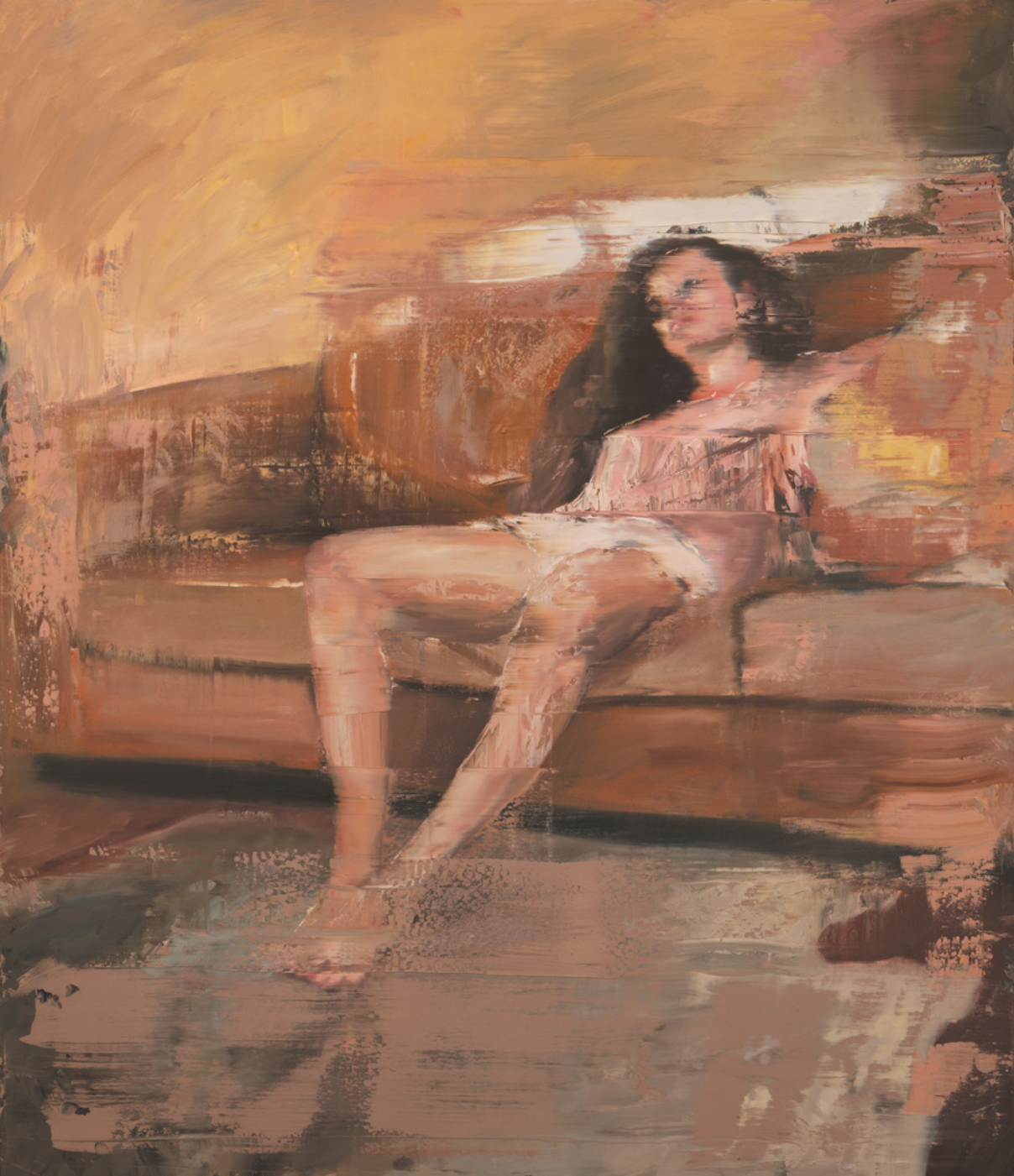
Capetonians III, 2020

Oil on canvas 140 x 120 cm | 55.1 x 47.2 in