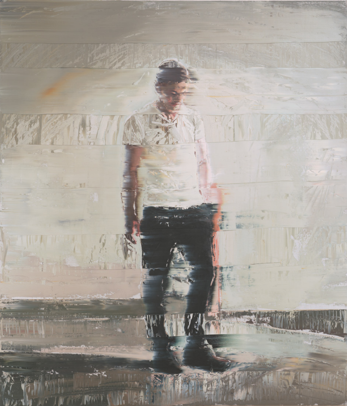
Dog Days of Summer II, 2020

Oil on canvas 210 x 180 cm | 82.7 x 70.9 in