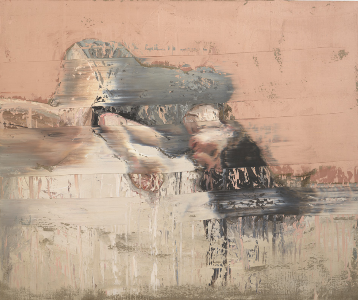
Fractured III, 2020 Oil on canvas 150 x 180 cm | 59.1 x 70.9 in