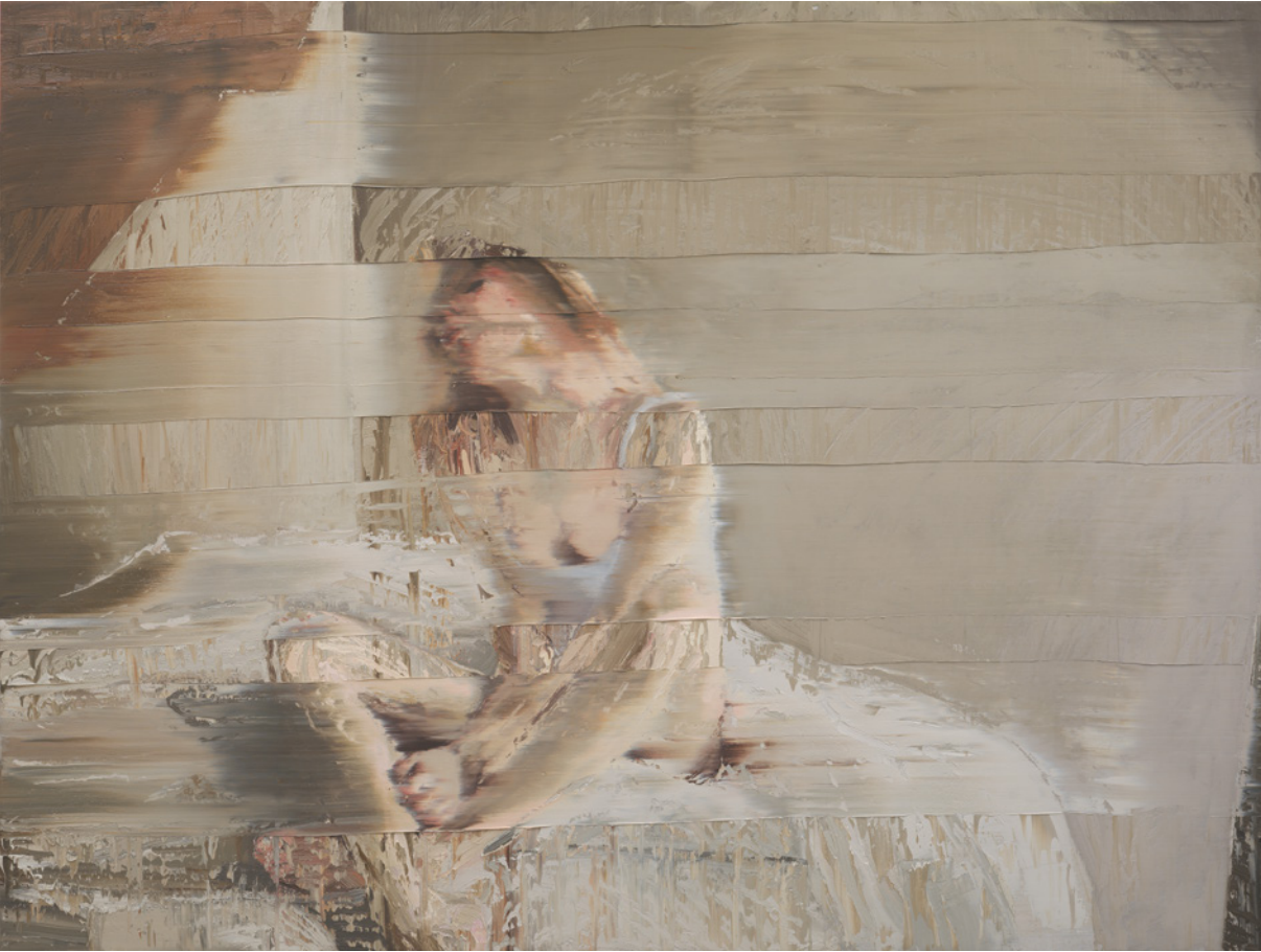
Fractured VI, 2020 Oil on canvas 150 x 200 cm | 59.1 x 78.7 in