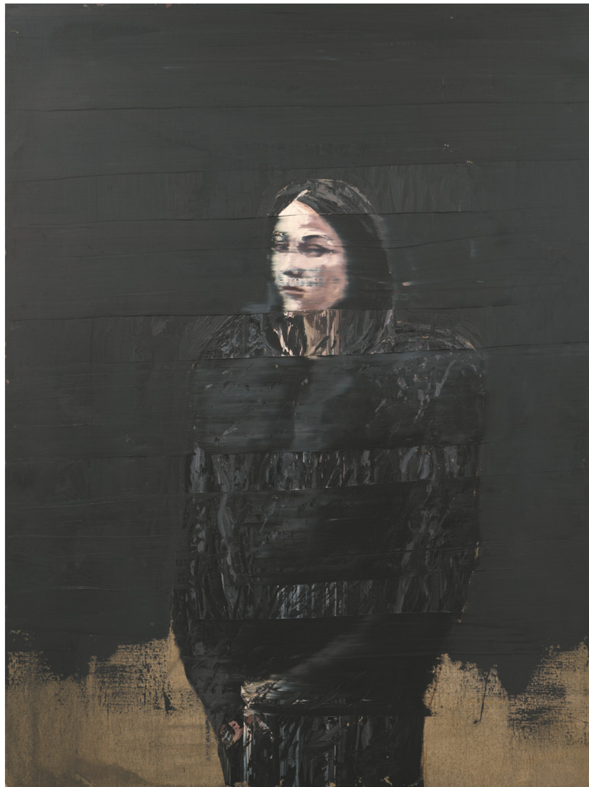
Woman in a Bird Garment, 2020 Oil on canvas 200 x 150 cm | 78.7 x 59.1 in