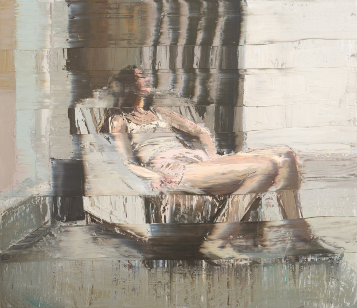
Capetonians IV, 2020

Oil on canvas 120 x 140 cm | 47.2 x 55.1 in