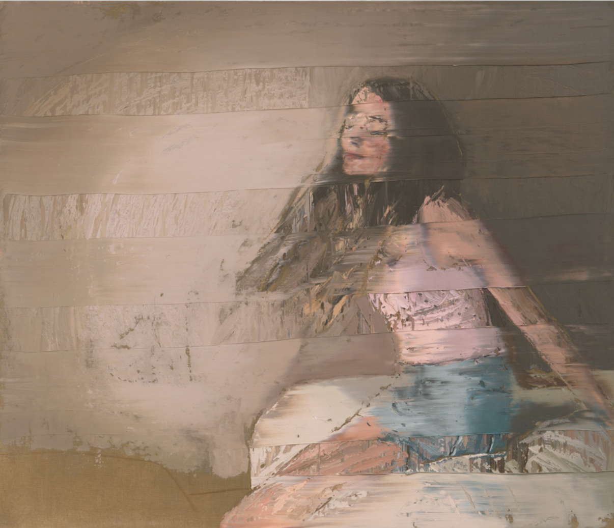
Capetonians V, 2020

Oil on canvas 120 x 140 cm | 47.2 x 55.1 in