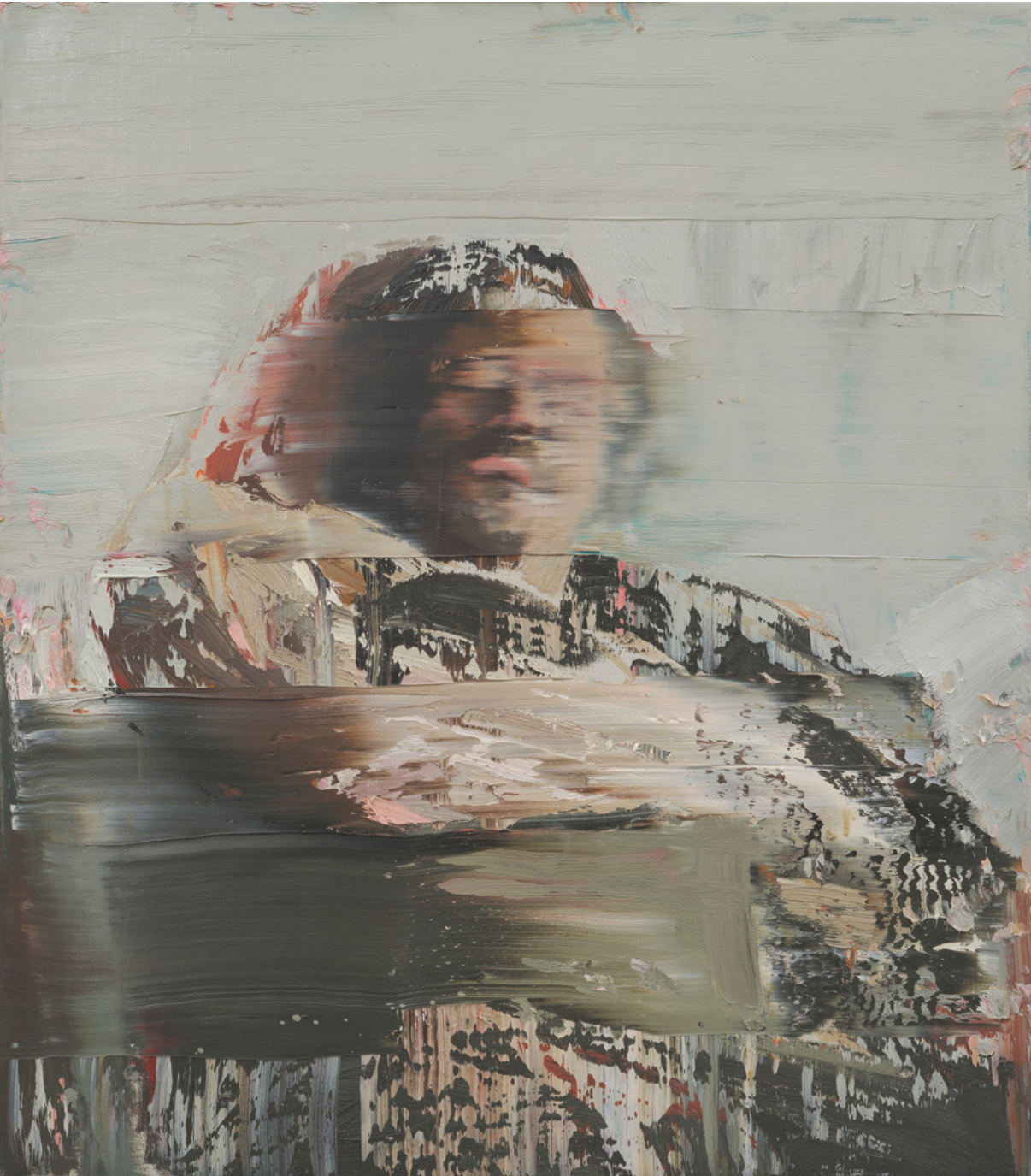
Fractured IV, 2020 Oil on canvas 80 x 70 cm | 31.5 x 27.6 in