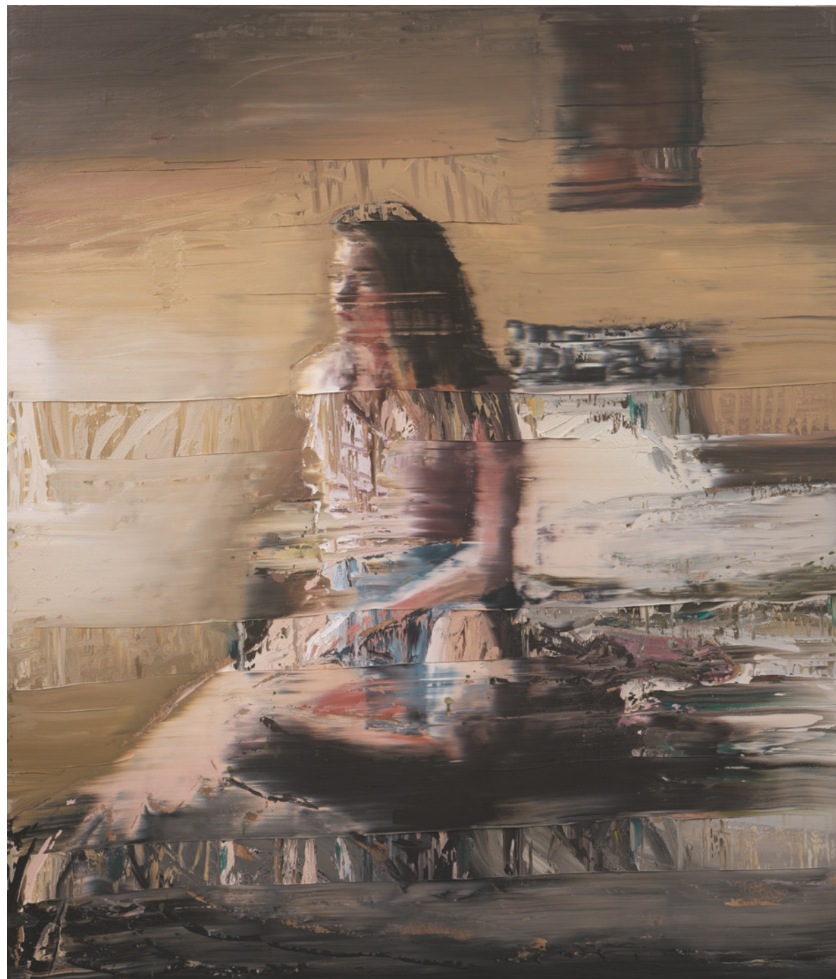
Capetonians I, 2020 Oil on canvas 140 x 120 cm | 55.1 x 47.2 in