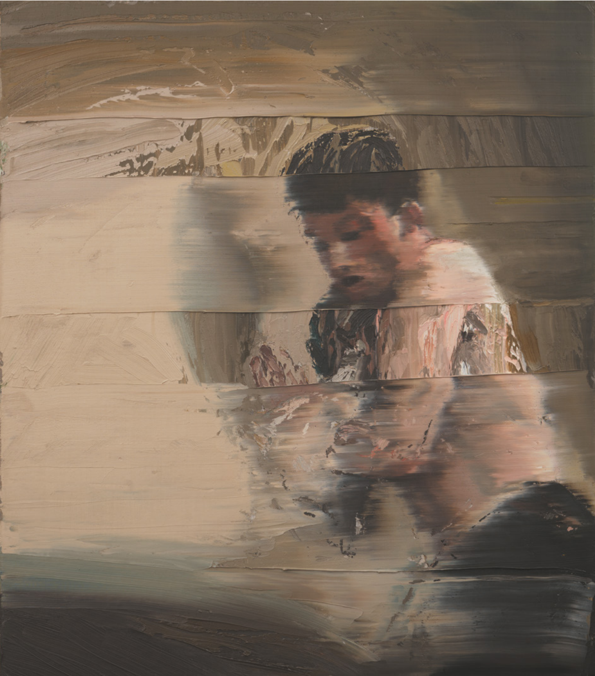
Ghost Hunting, 2020

Oil on canvas 80 x 70 cm | 31.5 x 27.6 in