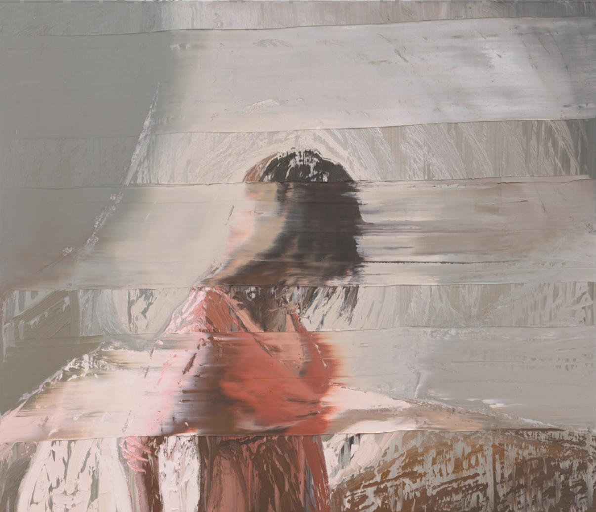
Fractured VII, 2020 Oil on canvas 120 x 140 cm | 47.2 x 55.1 in