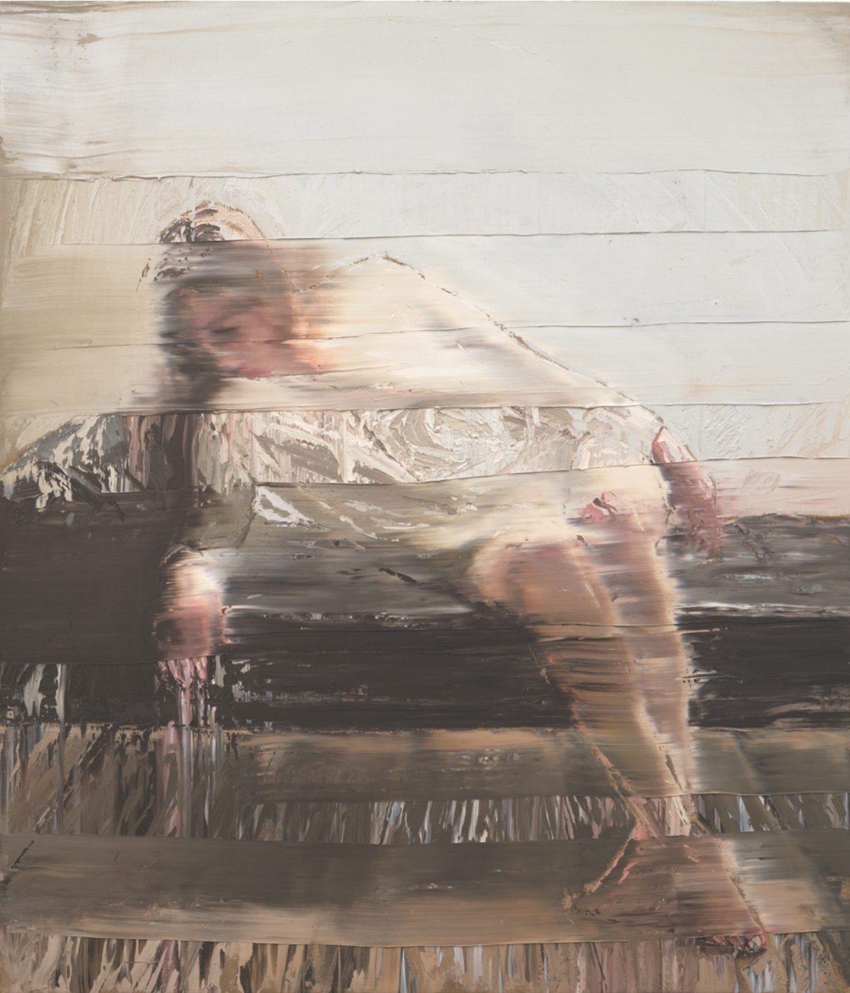
Floating Daybed, 2020 Oil on canvas 140 x 120 cm | 55.1 x 47.2 in