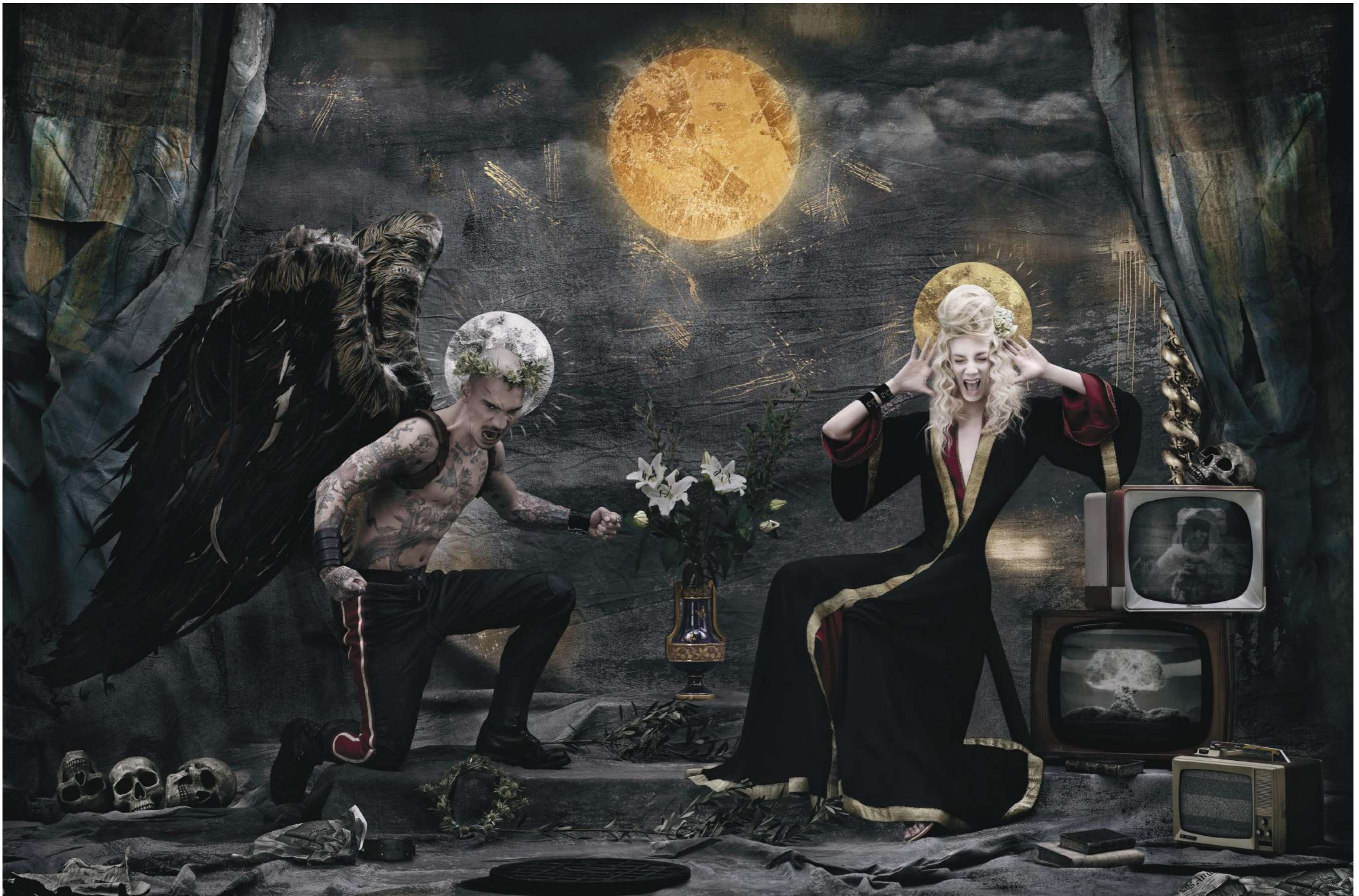
The Annunciation, 2015 Argentic print mounted on plexiglas in artist's frame, edition of 3, 180 x 272 cm - 70.9 x 107.1 in.