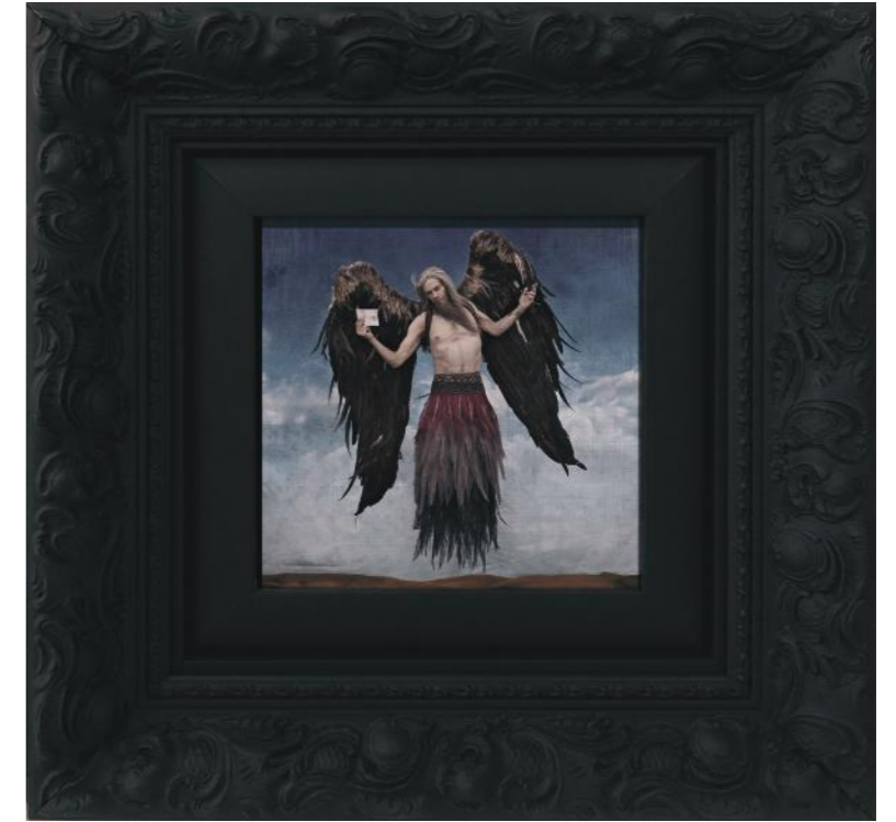
The Messenger III - detail, 2014 Fine Art Print, black wood frame with glass Unique piece 30 x 30 cm - 11.8 x 11.8 in.