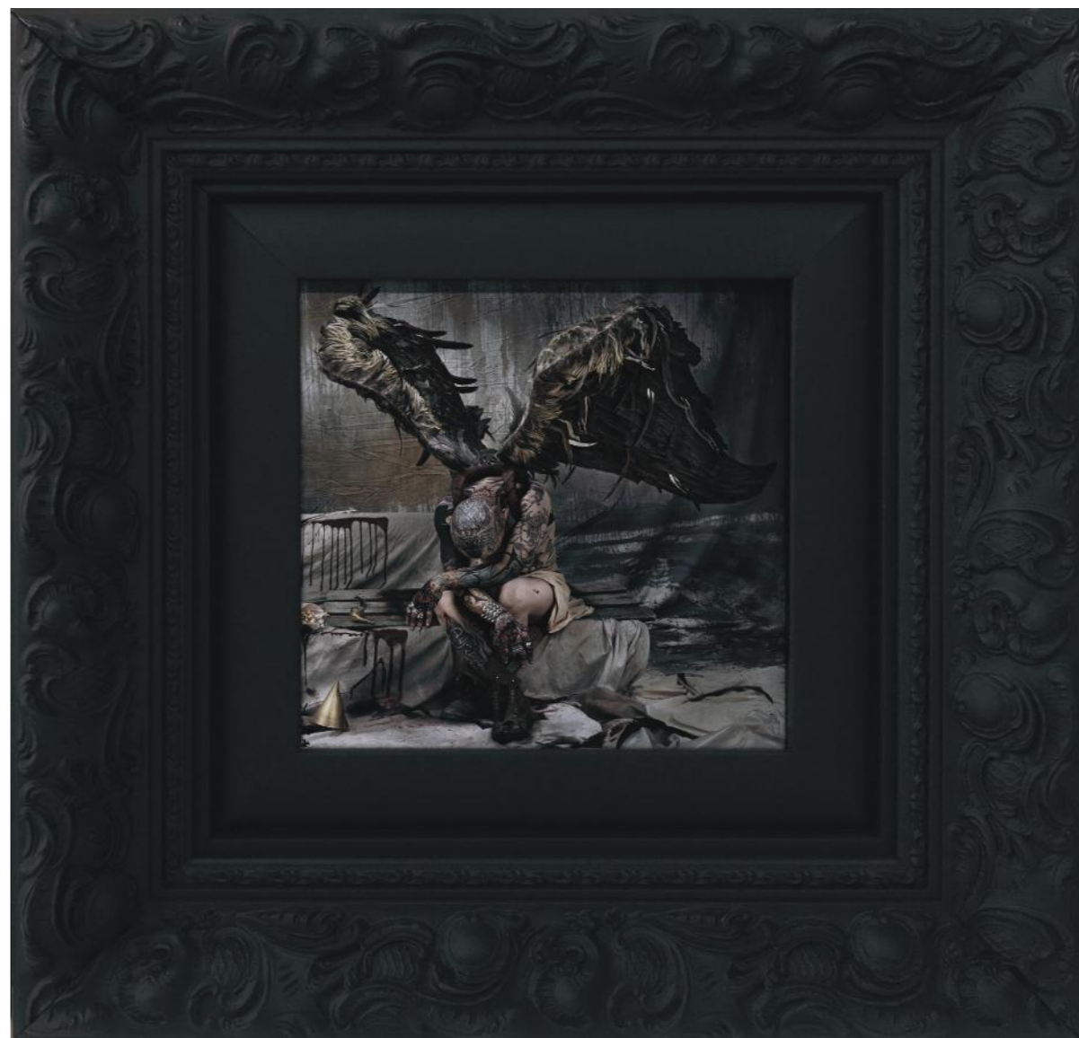
Tattooed Angel - detail, 2014 Fine Art Print, black wood frame with glass Unique piece 30 x 30 cm - 11.8 x 11.8 in.