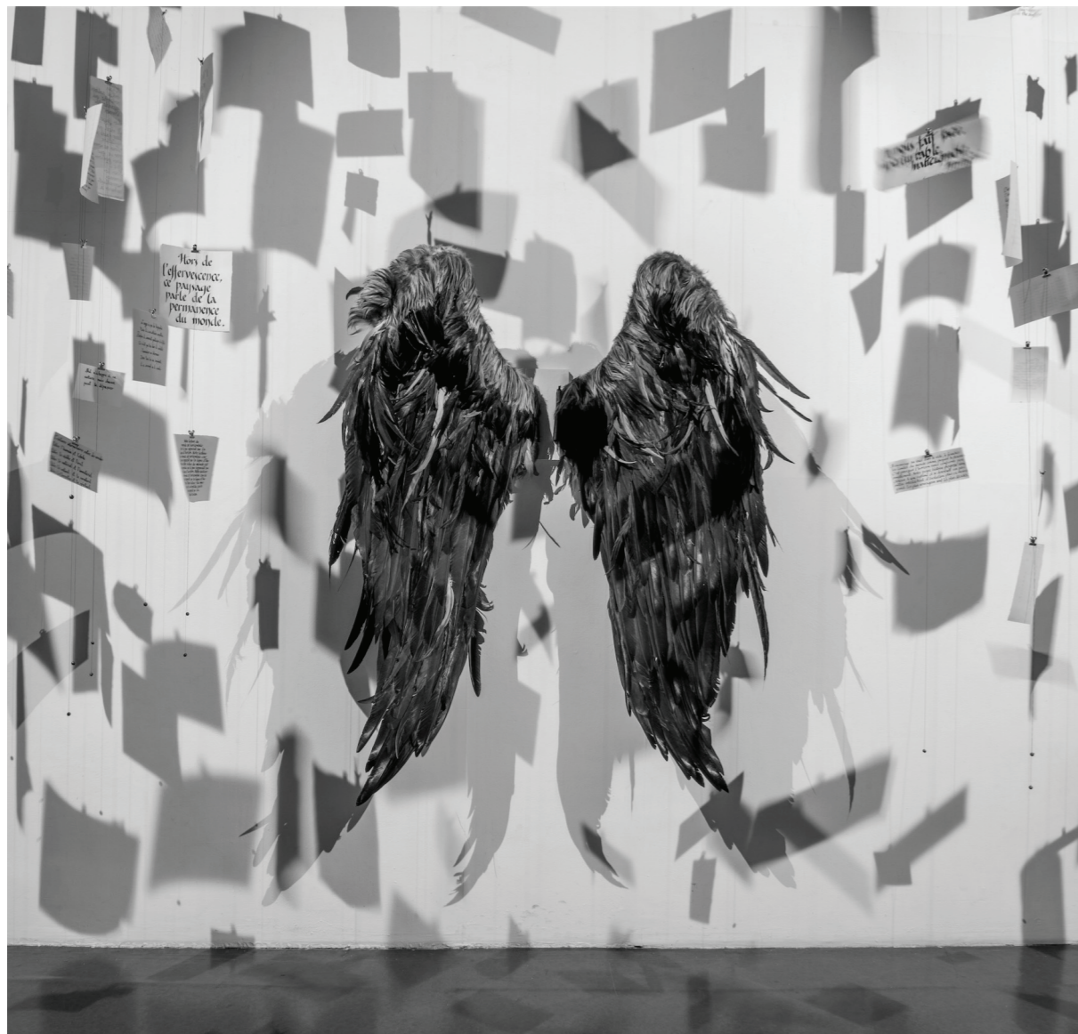
Installation, Réfectoire des Cordeliers, Paris, 2016

No one can escape their nature, but everyone can transcend it. How can we challenge human destiny? It is this question that humanity has tirelessly attempted to answer over the course of its evolution. Today, for artists, the question is more pressing than ever.