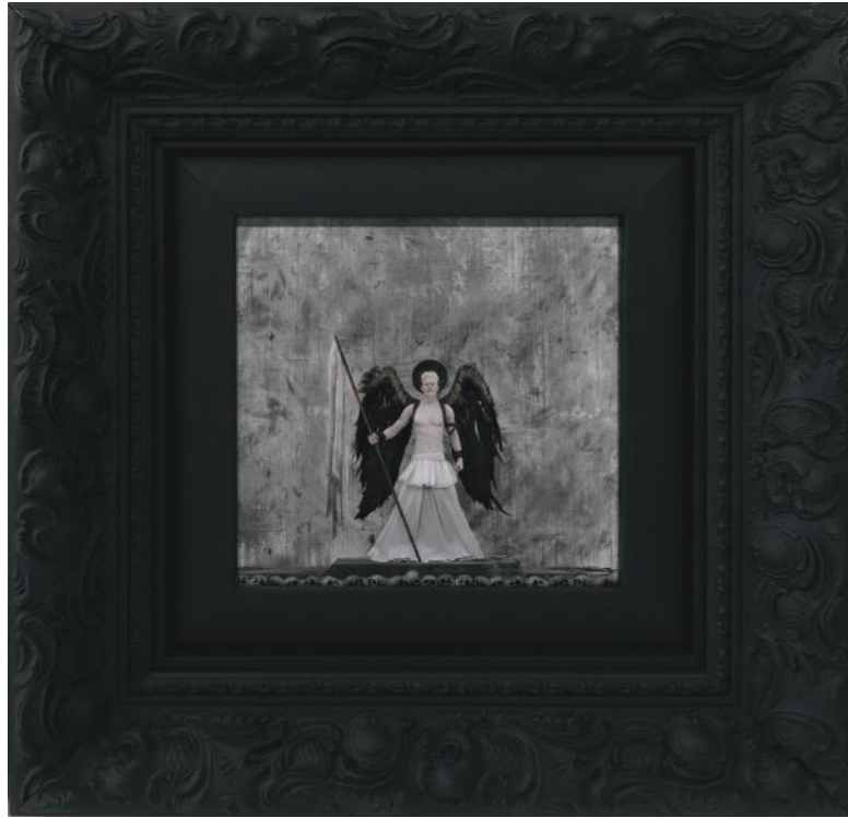
The Warrior - detail, 2014 Fine Art Print, black wood frame with glass Unique piece 30 x 30 cm - 11.8 x 11.8 in.