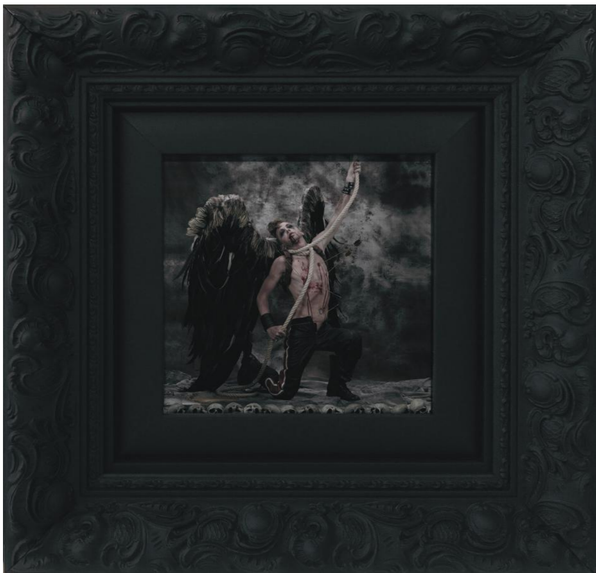
Lazarus - detail, 2015 Fine Art Print, black wood frame with glass Unique piece 30 x 30 cm - 11.8 x 11.8 in.