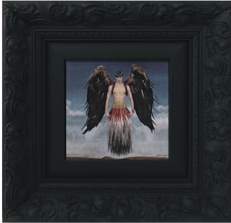
The Messenger I - detail, 2014 Fine Art Print, black wood frame with glass Unique piece 30 x 30 cm - 11.8 x 11.8 in.