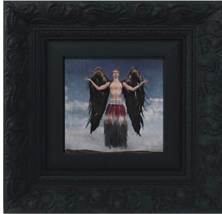
The Messenger II - detail, 2014 Fine Art Print, black wood frame with glass Unique piece 30 x 30 cm - 11.8 x 11.8 in.