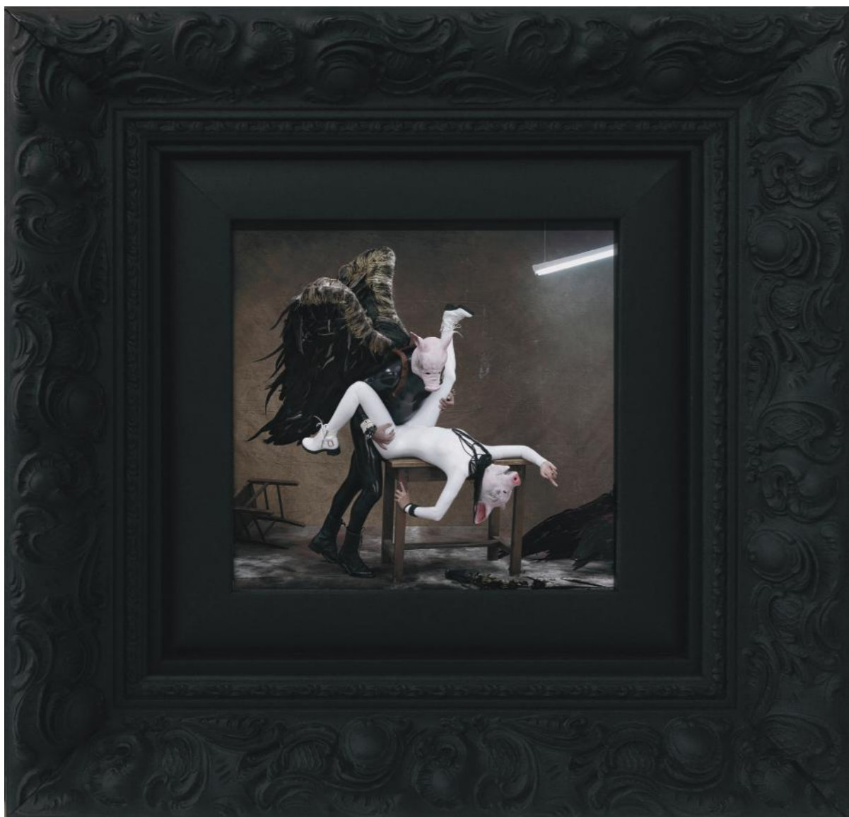
Love 10935 - detail, 2014 Fine Art Print, black wood frame with glass Unique piece 30 x 30 cm - 11.8 x 11.8 in.