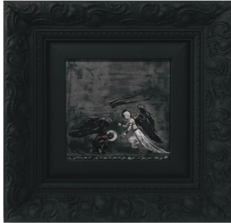
The Struggle - detail, 2014 Fine Art Print, black wood frame with glass Unique piece 30 x 30 cm - 11.8 x 11.8 in.