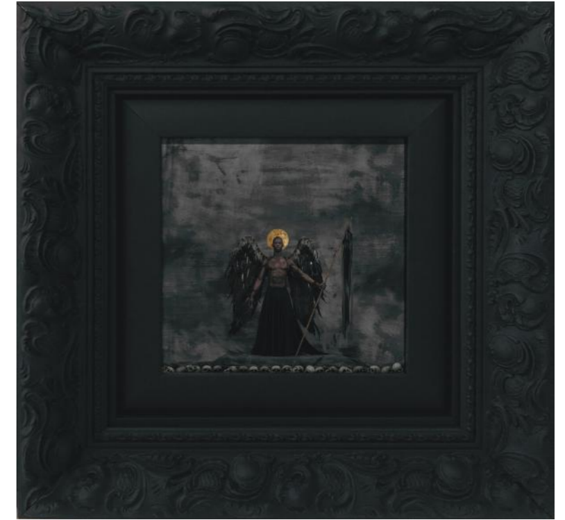
The Guide - detail, 2014 Fine Art Print, black wood frame with glass Unique piece 30 x 30 cm - 11.8 x 11.8 in.