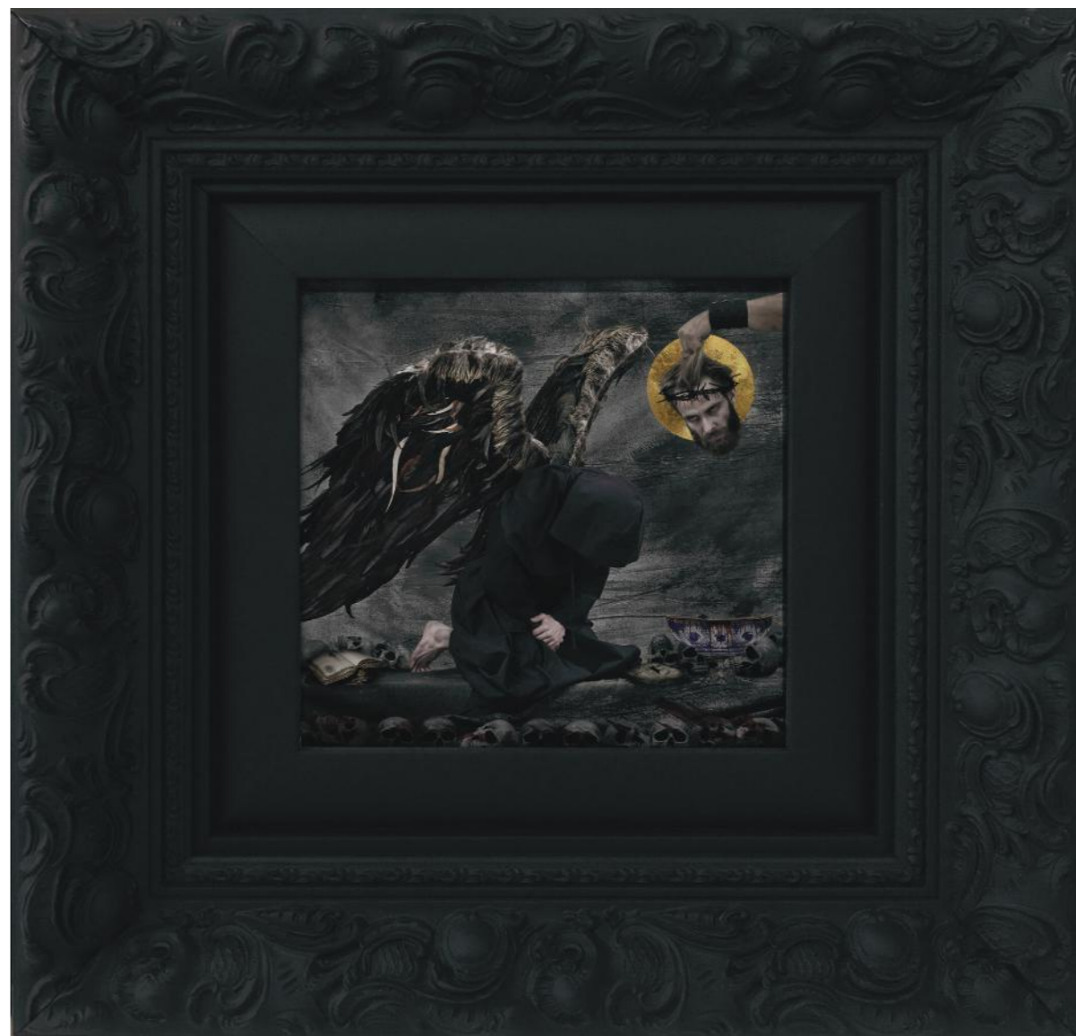
The Decapitated Angel - detail, 2014 Fine Art Print, black wood frame with glass Unique piece 30 x 30 cm - 11.8 x 11.8 in.