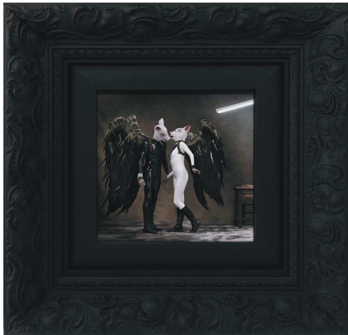
Kiss 10835 - detail, 2014 Fine Art Print, black wood frame with glass Unique piece 30 x 30 cm - 11.8 x 11.8 in.