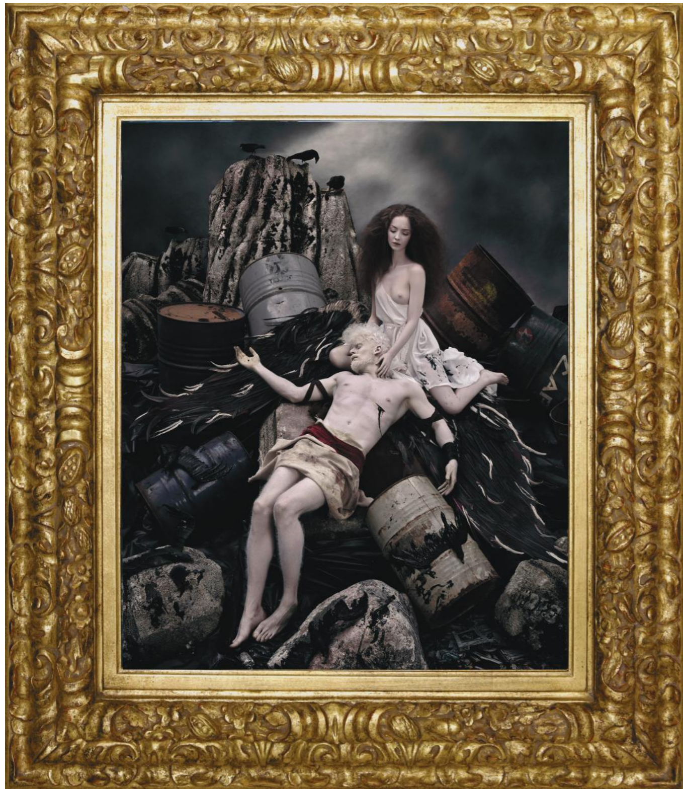
Land of Men - detail, 2014 Fine Art Print, gold molding wood frame Unique piece 59 x 69 cm - 23.2 x 27.2 in. With frame 75 x 85 cm - 29.5 x 33.5 in.