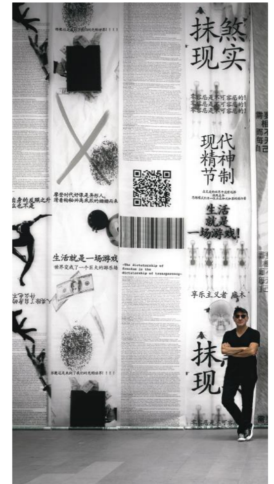
Gérard Rancinan, Shanghai

"Urban Jungle", Espace Pierre Cardin, Paris, France, 2000