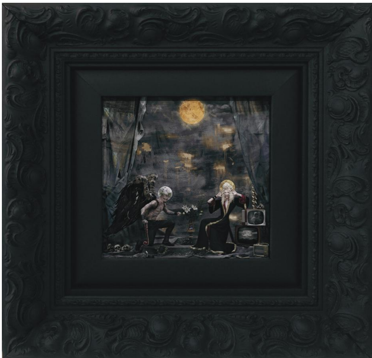
The angry Angel and Mary - detail, 2015 Fine Art Print, black wood frame with glass Unique piece 30 x 30 cm - 11.8 x 11.8 in.