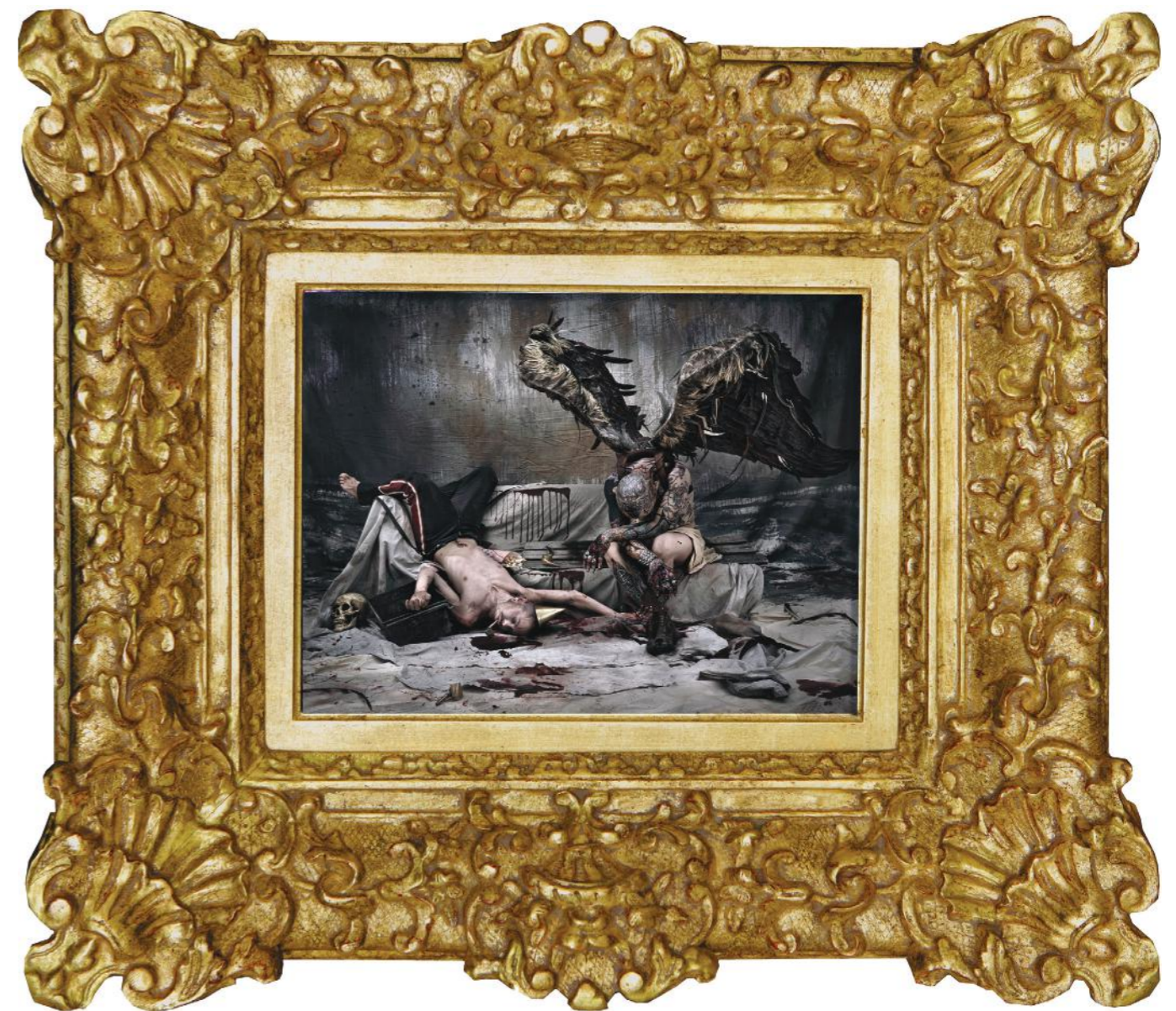
The Party is Over - detail, 2014 Fine Art Print, gold molding wood frame Unique piece 27 x 36 cm - 10.6 x 14.2 in. With frame 62 x 75 cm - 24.4 x 29.5 in.