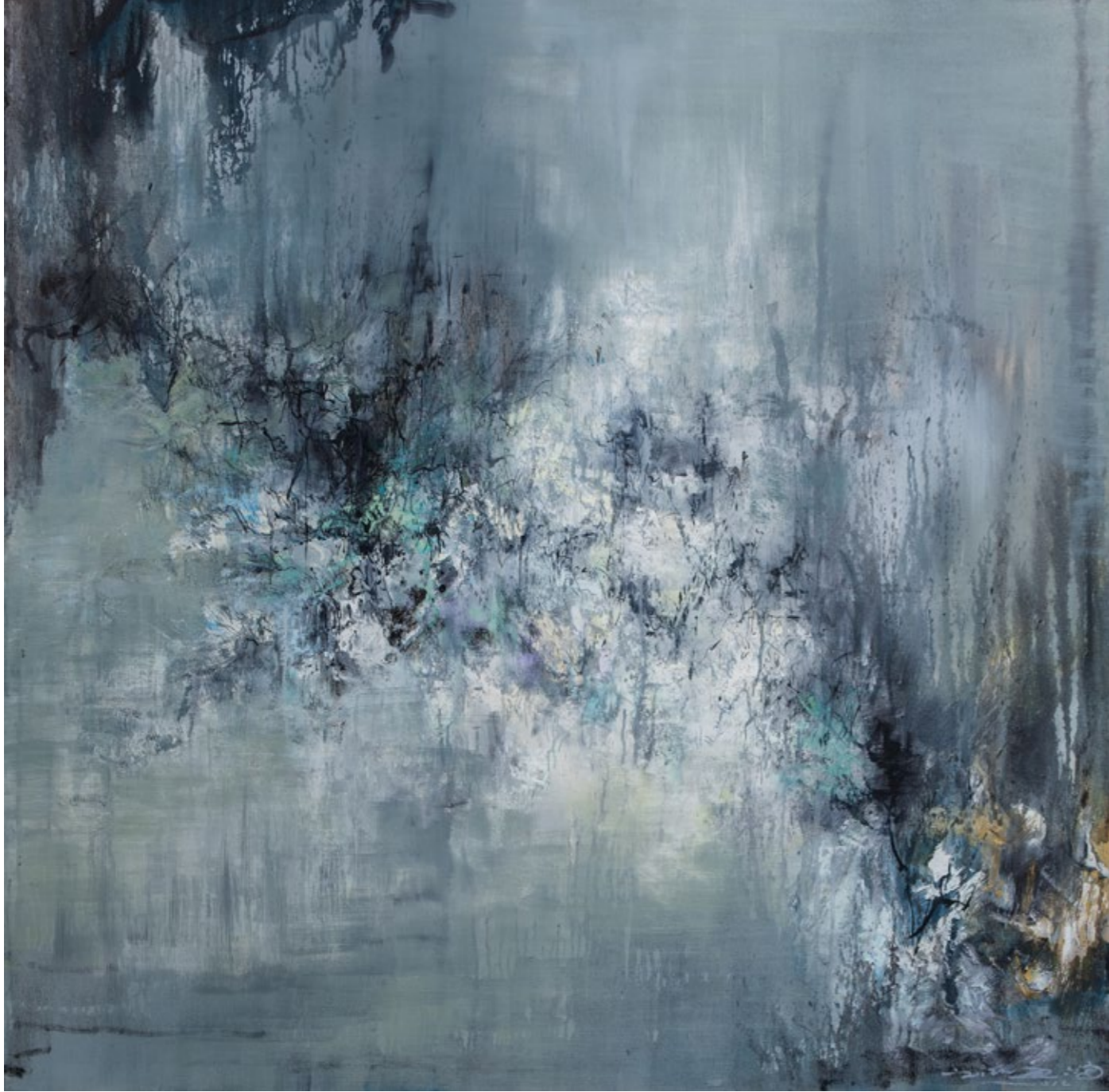
Watching the River, 2012 Oil on canvas 140 x 140 cm - 55.1 x 55.1 in.