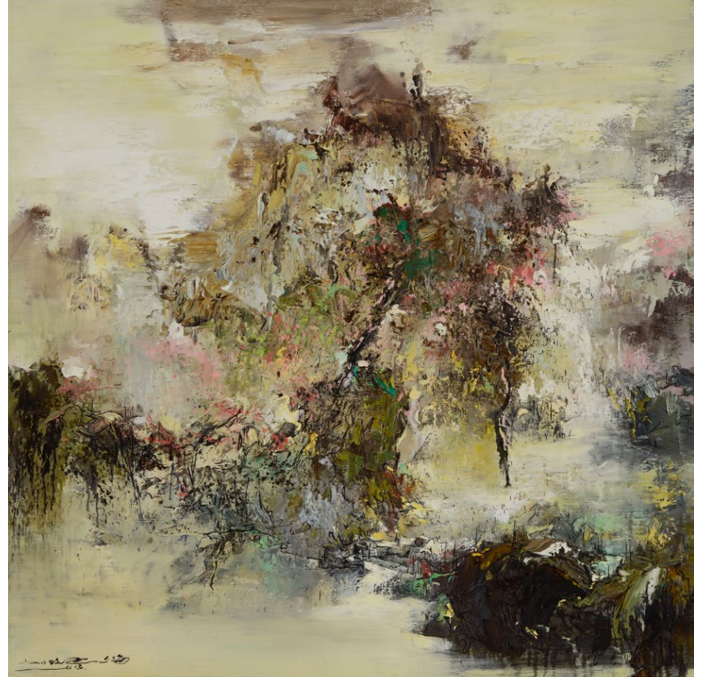
Dreaming of the Mountains, 2013 Oil on canvas 120 x 120 cm - 47.2 x 47.2 in.