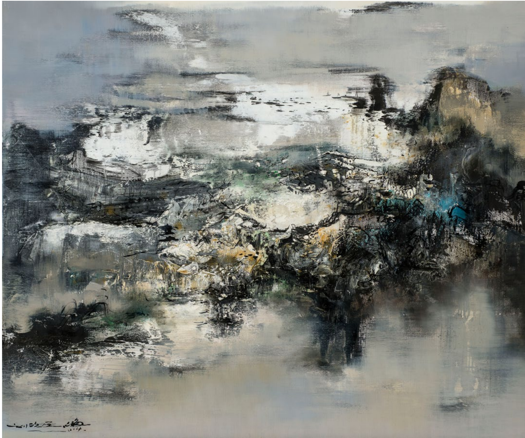
Idyllic, 2014 Oil on canvas 100 x 120 cm - 39.4 x 47.2 in.