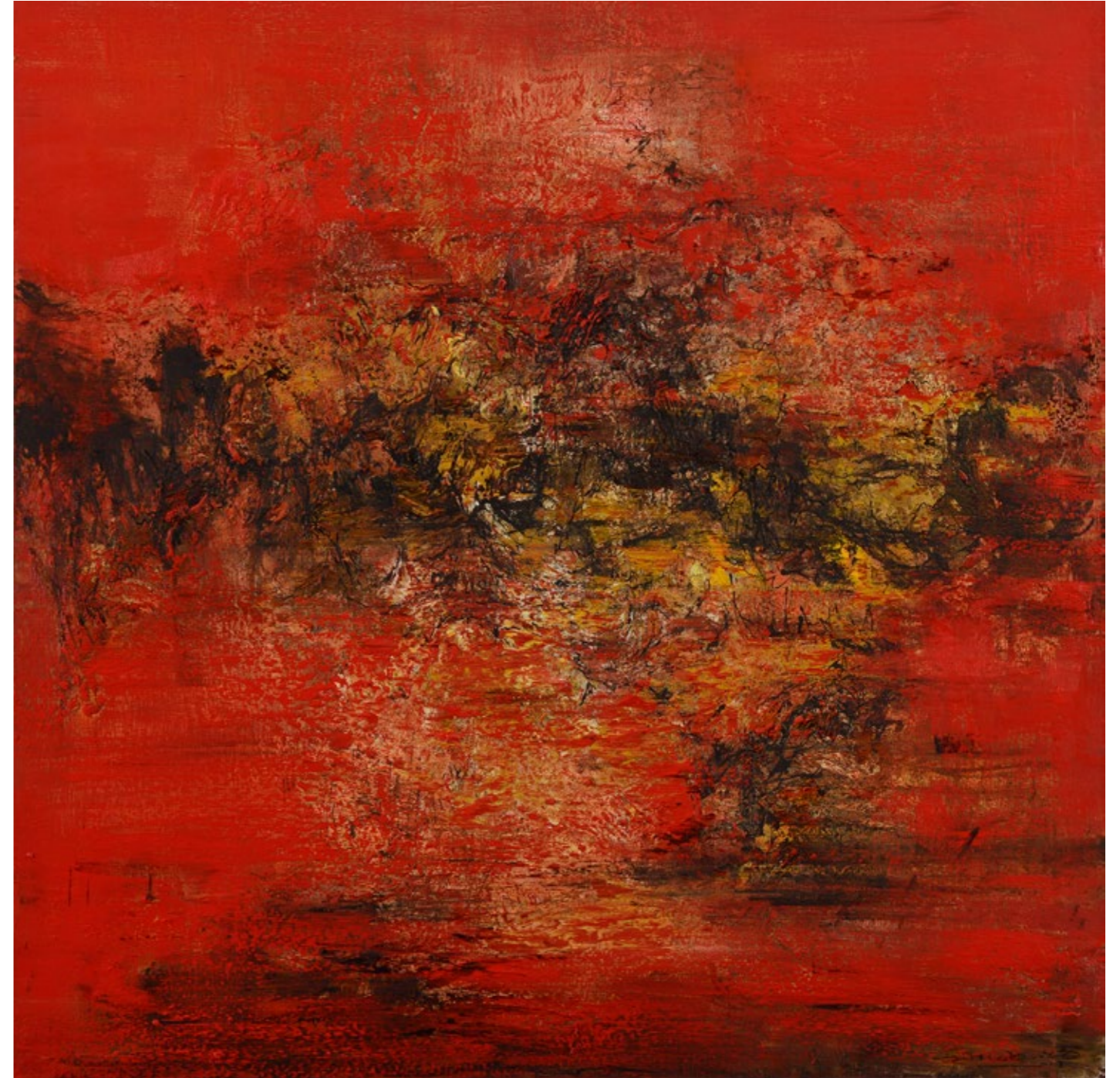
Observer, 2013 Oil on canvas 140 x 140 cm - 55.1 x 55.1 in.