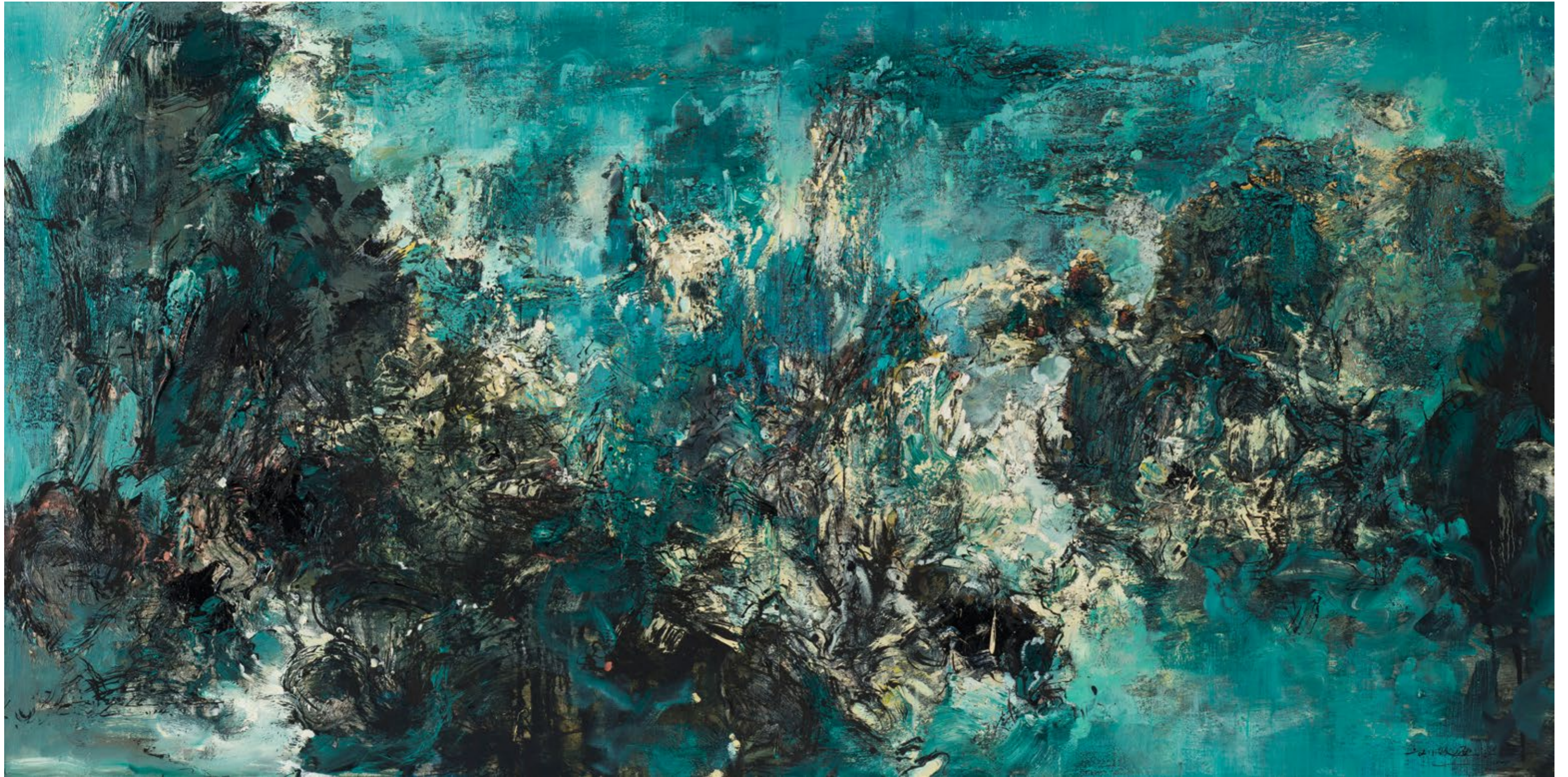
Green Peaks on the River, 2014 Oil on canvas Diptych: 110 x 220 cm - 43.3 x 86.6 in.