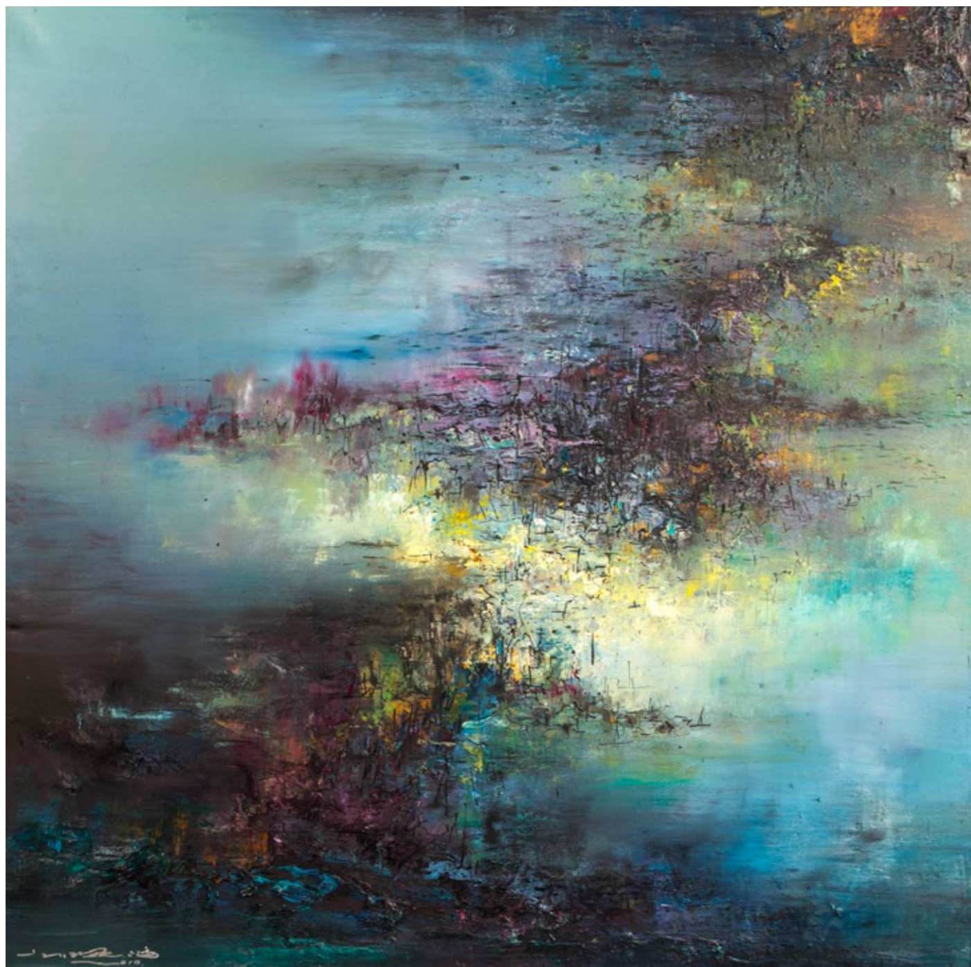
Order from Chaos, 2010 Oil on canvas 140 x 140 cm - 55.1 x 55.1 in.