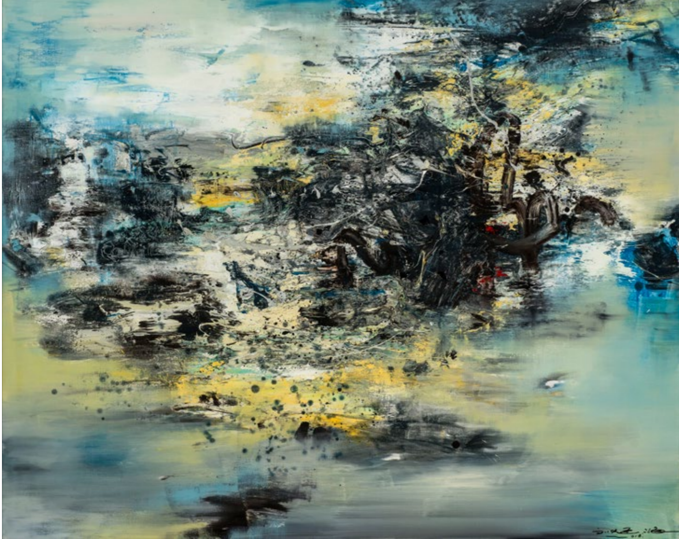
Dream in the Wind, 2016 Oil on canvas 130 x 160 cm - 51.2 x 63 in.