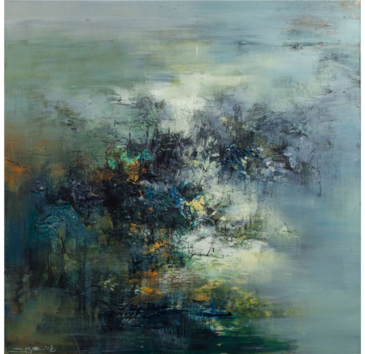
Where Water Meets the Sky, 2013 Oil on canvas 140 x 140 cm - 55.1 x 55.1 in.