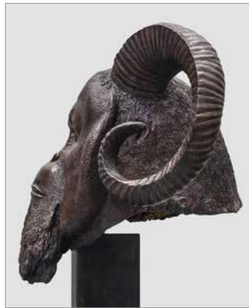
> NATURAE ORGIA

Tête orang-outan-bélier, 2015 Bronze, edition of 8 + 4 AP 80 x 55 x 44 cm - 31.5 x 21.7 x 17.3 in.