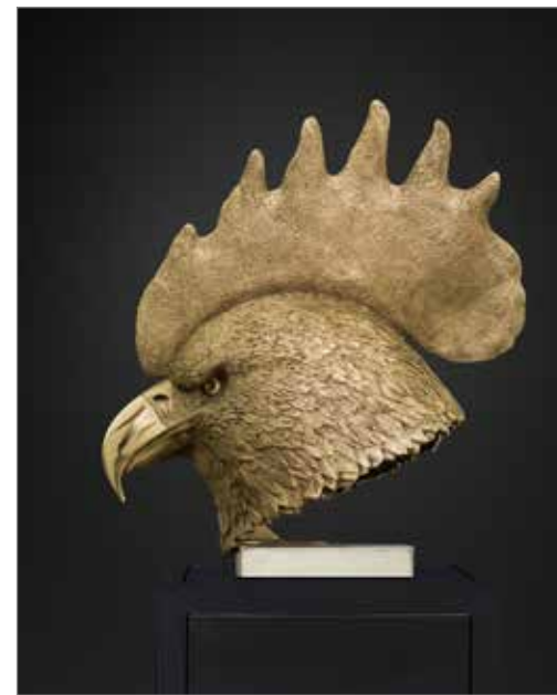
> NATURAE ORGIA

Tête aigle-coq, 2015 Bronze, edition of 8 + 4 AP 70 x 65 x 40 cm - 27.6 x 25.6 x 15.7 in.