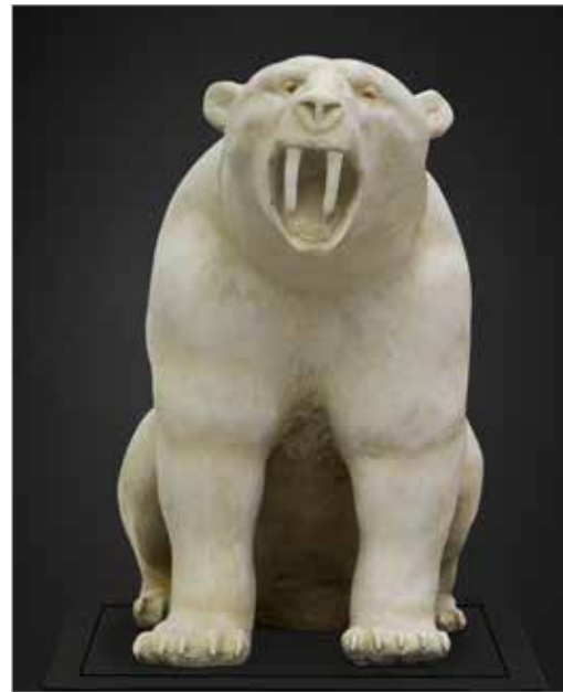
> NATURAE ORGIA

Petit ours -morse, 2015 Resin, edition of 8 + 4 AP 45 x 33 x 23 cm - 17.7 x 13 x 9.1 in.