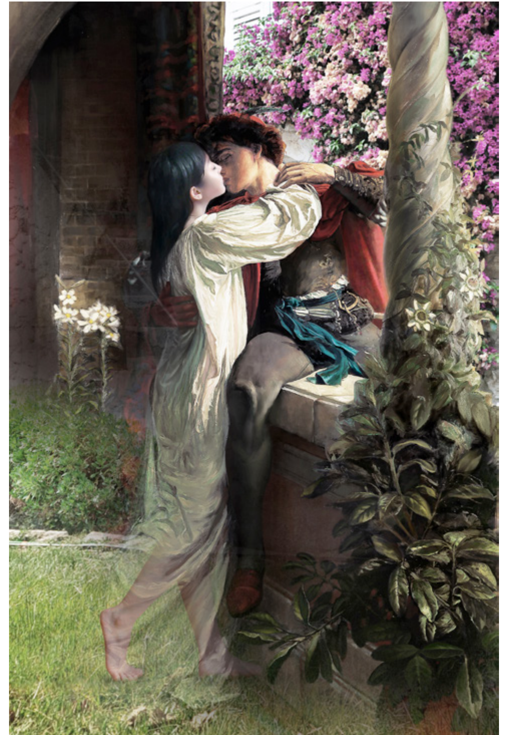
The Costume of Painter - Romeo Dongsook 2, 2014

180 x 120 cm - 70.9 x 47.2 in., edition of 7