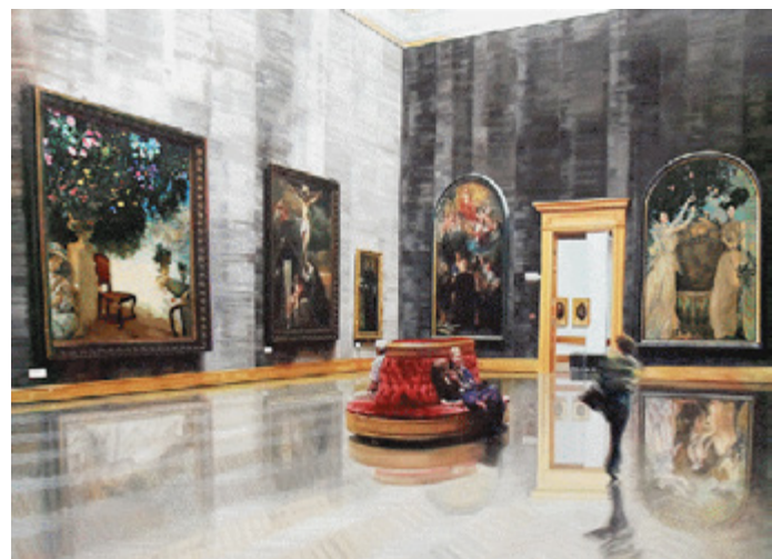
The Costume of Painter - Museum K, J.S.Sargent, 2013