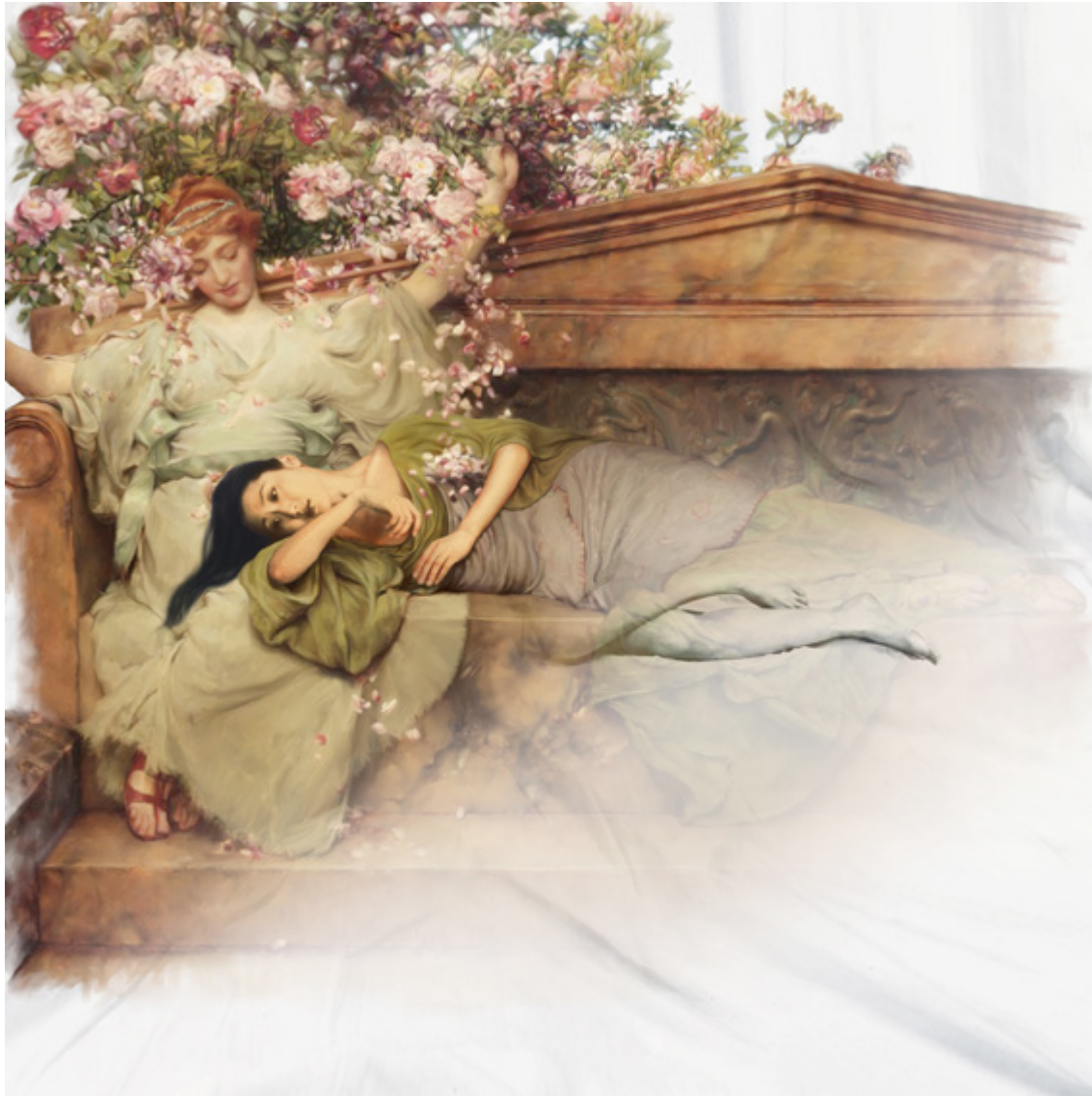
The Costume of Painter - A.Tadema B, W, 2014 120 x120 cm - 47.2 x 47.2 in., edition of 5 Lenticular