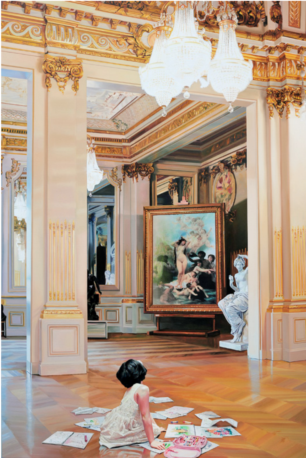
The Costume of Painter - Phantom of Museum O, sketch girl, 2011 290.9 x 197 cm - 114.5 x 77.6 in. Lenticular and oil on canvas