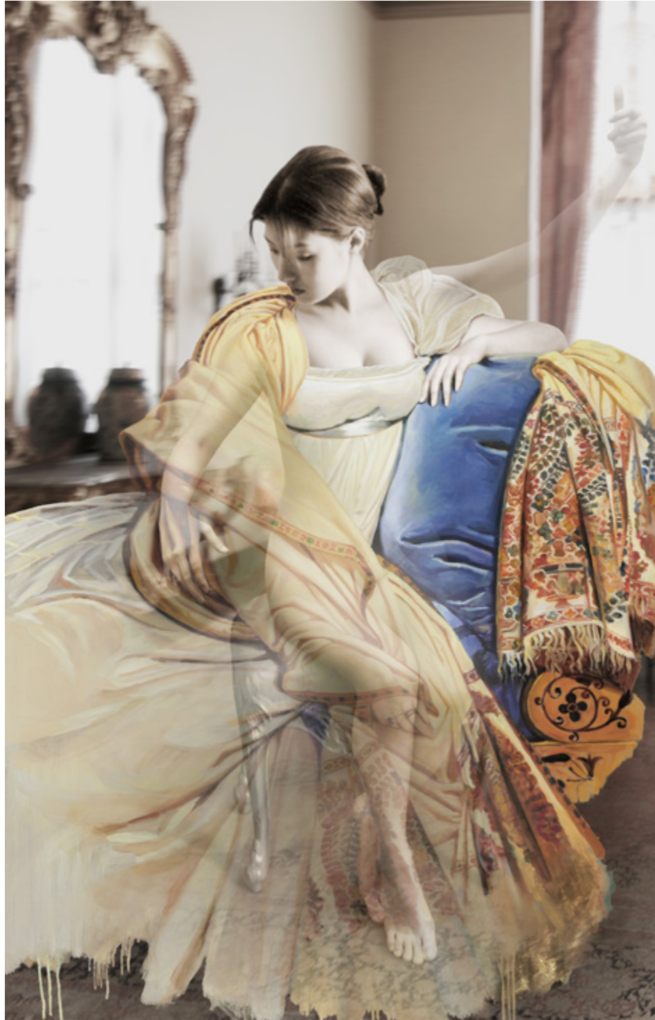
The Costume of Painter - Ingres, hs 3D, 2015 180 x 120 cm - 70.9 x 47.2 in., edition of 7 Lenticular