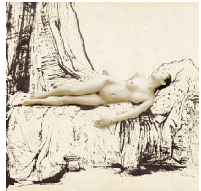
The Costume of Painter - A.Tadema drawing, 2015 120 x 120 cm - 47.2 x 47.2 in., edition of 7 Lenticular