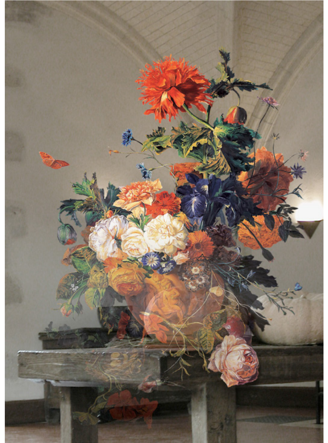
The Costume of Painter - Still Life with poppy 3D, 2015 120 x 180 cm - 47.2 x 70.9 in., edition of 7 Lenticular