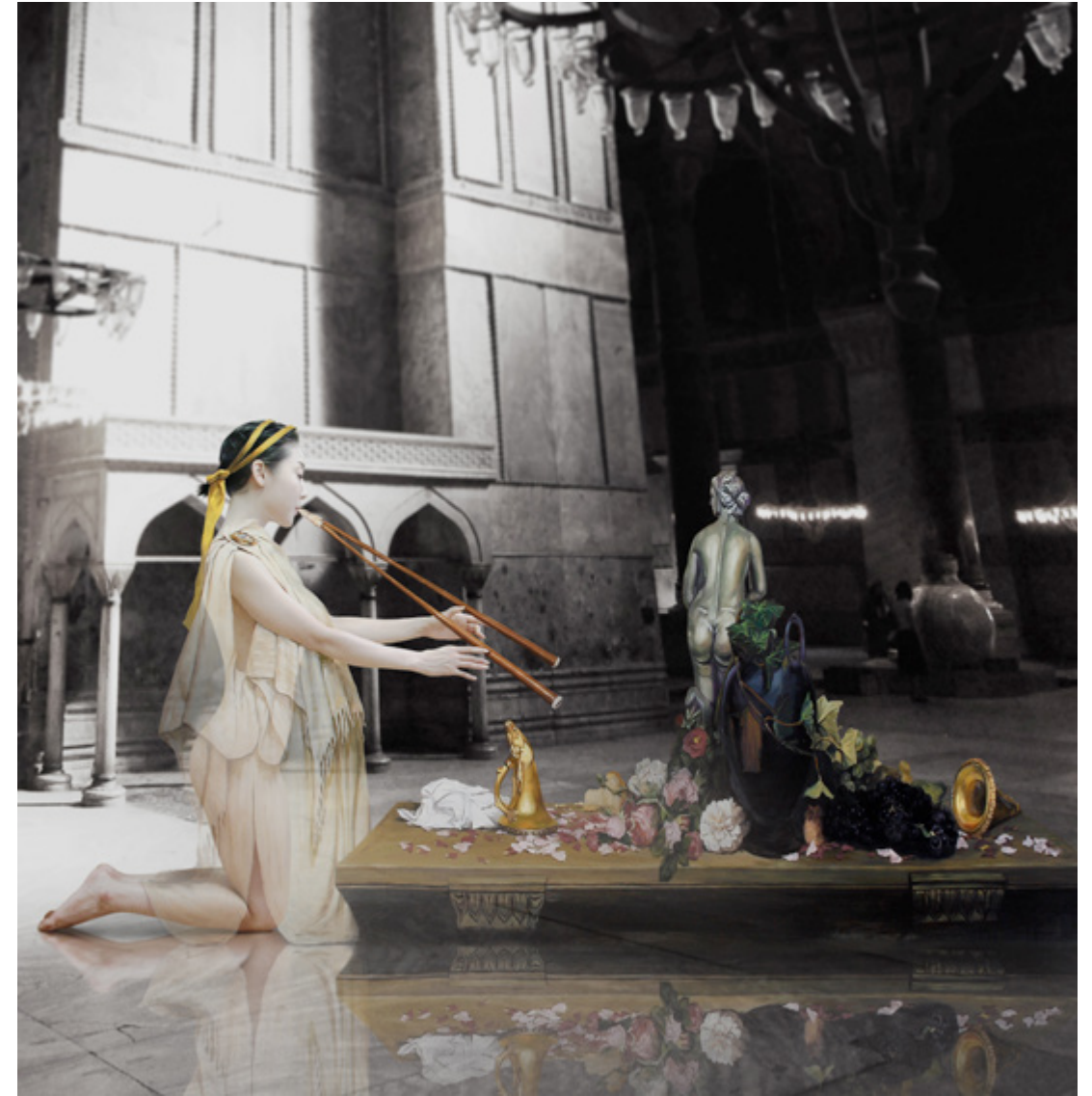
The Costume of Painter - A.Tadema drawing, Ci, 2015 120 x 120 cm - 47.2 x 47.2 in., edition of 7 Lenticular