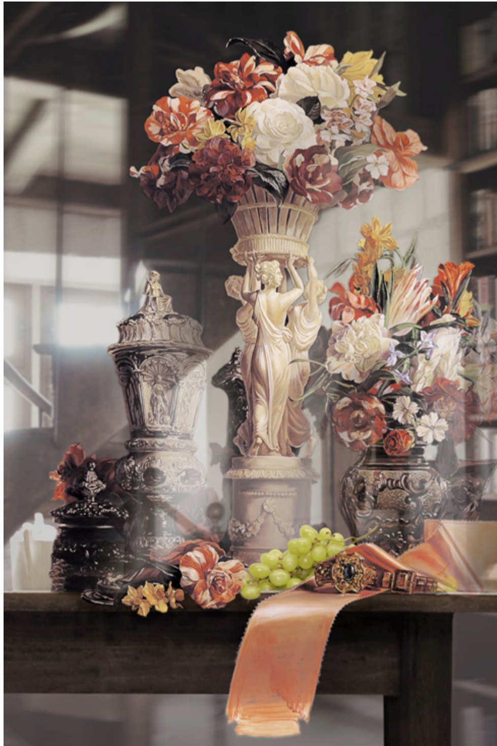
The Costume of Painter - Still life with human image vase 3D, 2015

174 x 120 cm - 68.5 x 47.2 in., edition of 7