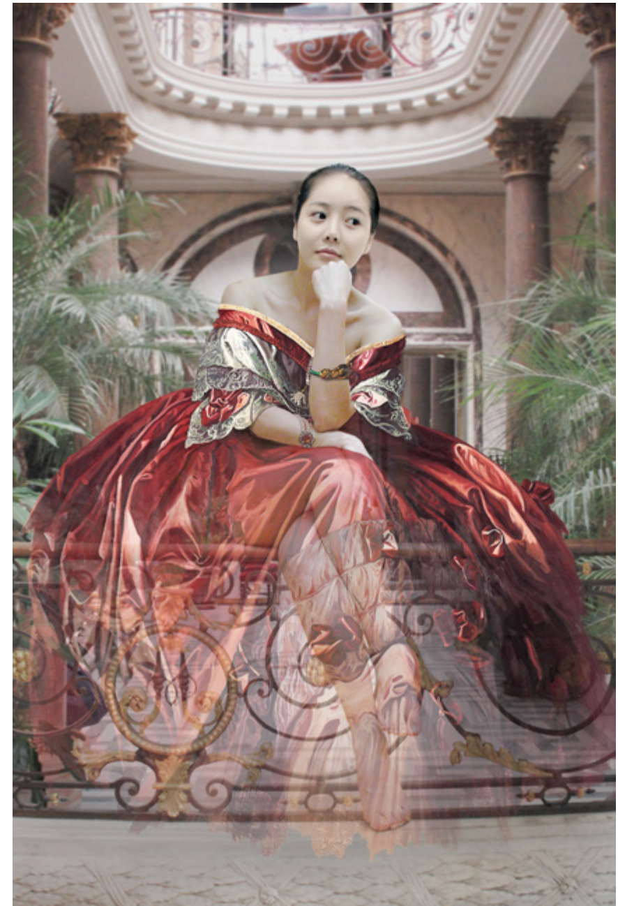
The Costume of Painter - Ingres handrail by 3D, 2015 180 x 120 cm - 70.9 x 47.2 in., edition of 7 Lenticular