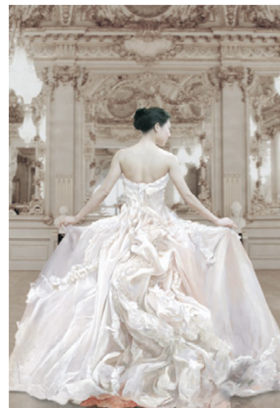
The Costume of Painter - C. Lacroix wed 3D, 2015 165 x 120 cm - 65 x 47.2 in., edition of 7 Lenticular