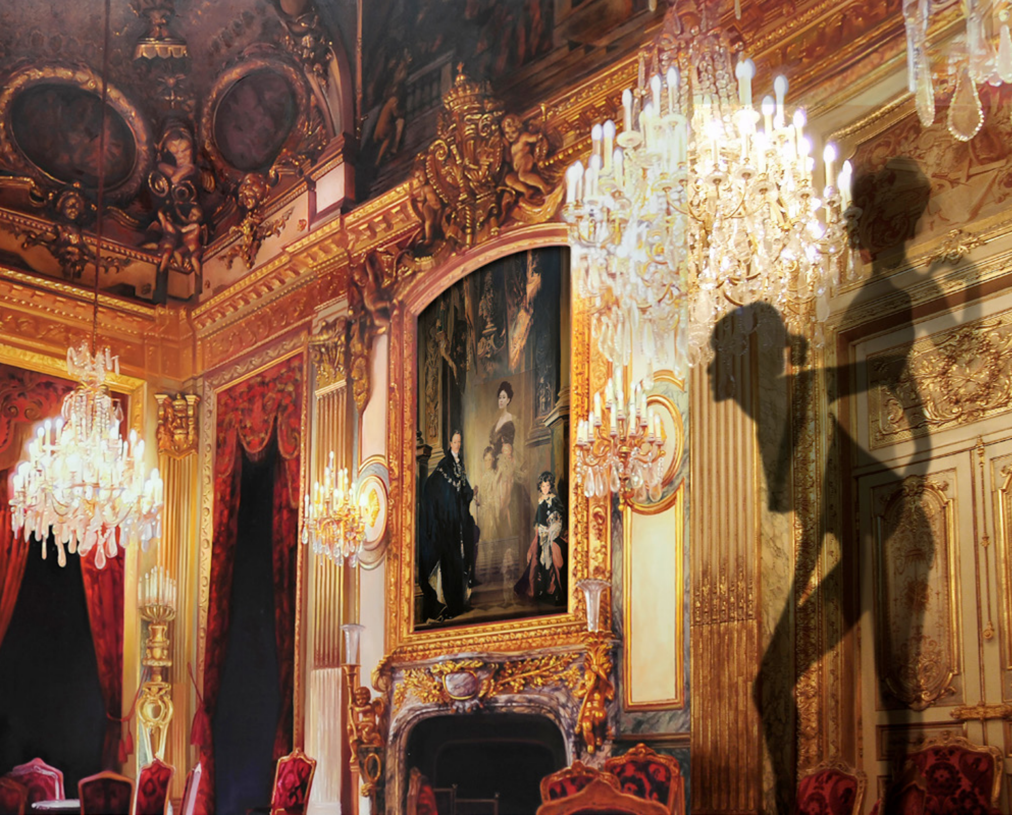
The Costume of Painter - Shadow of Museum Ka, J.S.Sargent family jk, 2014

181.8 x 227.3 cm - 71.6 x 89.5 in. Lenticular and oil on canvas