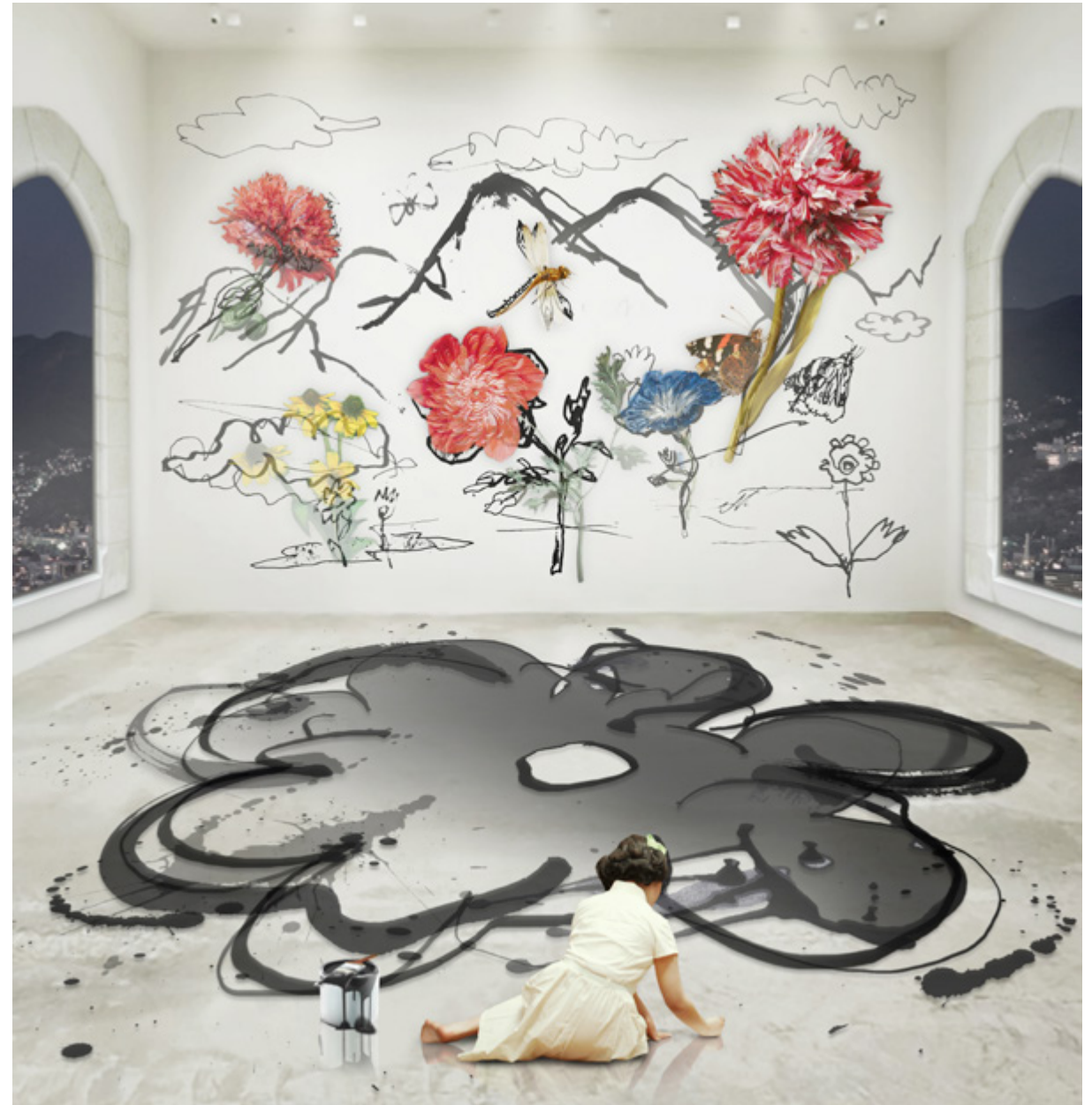
The Costume of Painter - Doodling on the Wall S, little girl, a Square 2 3D, 2015 120 x 120 cm - 47.2 x 47.2 in., edition of 7 Lenticular