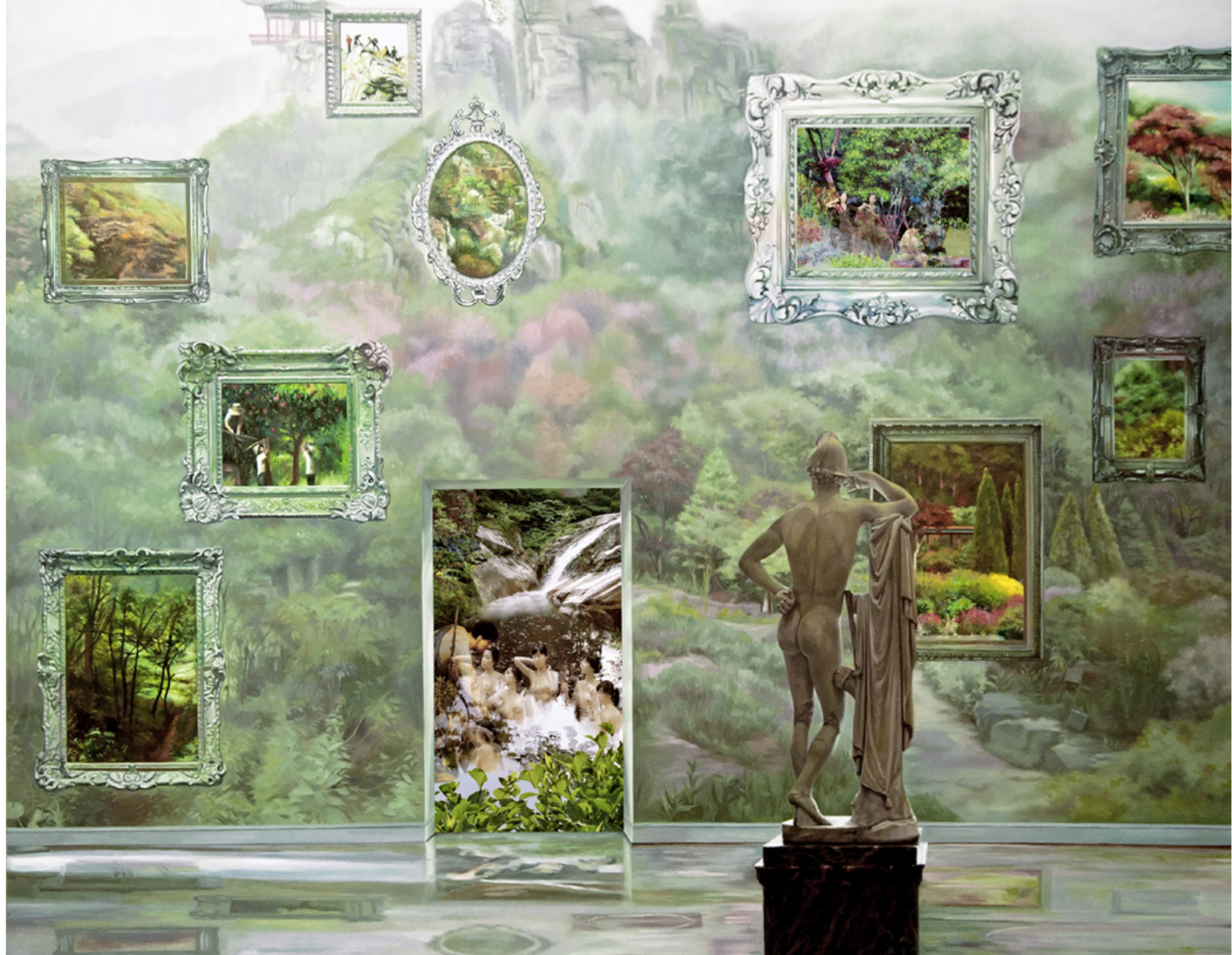
The Costume of Painter - Garden 2, 2014