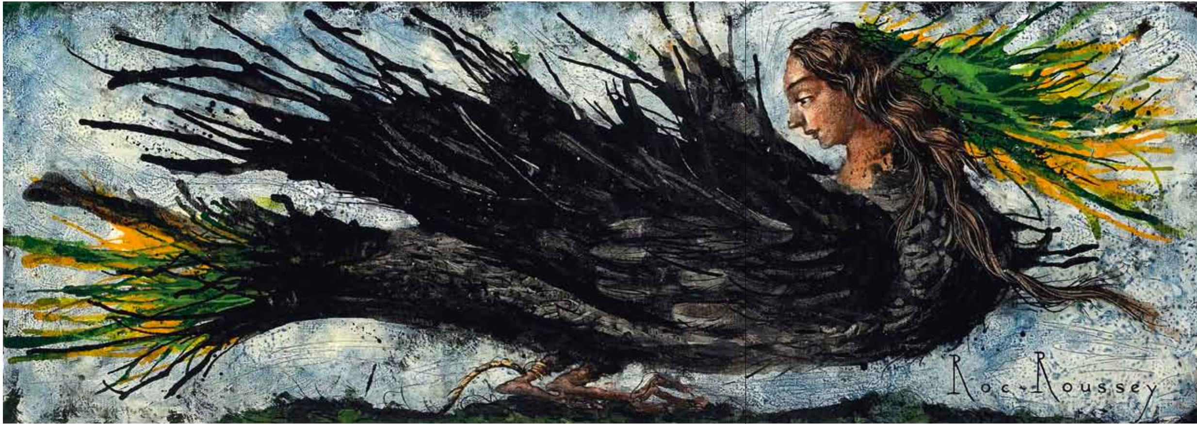
L'Oiseau entravé Oil on canvas 35 x 100 cm - 13.8 x 39.4 in. | Provenance The artist's studio