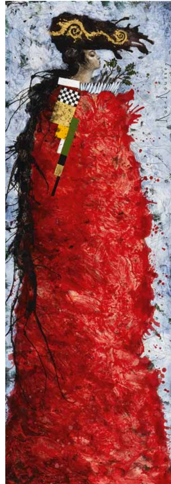
Le Vent des forêts Oil on canvas 170 x 60 cm - 66.9 x 23.6 in. Provenance The artist's studio

“My personal desires alone decide what I paint. I want each piece to provoke the unpredictable; I want to be taken off guard by the intrusion of a magic touch. This is my own personal demon: it surpasses my creative motivation, transcends the very act of painting itself. I detest my work if this mysterious something eludes me or doesn't emerge.”