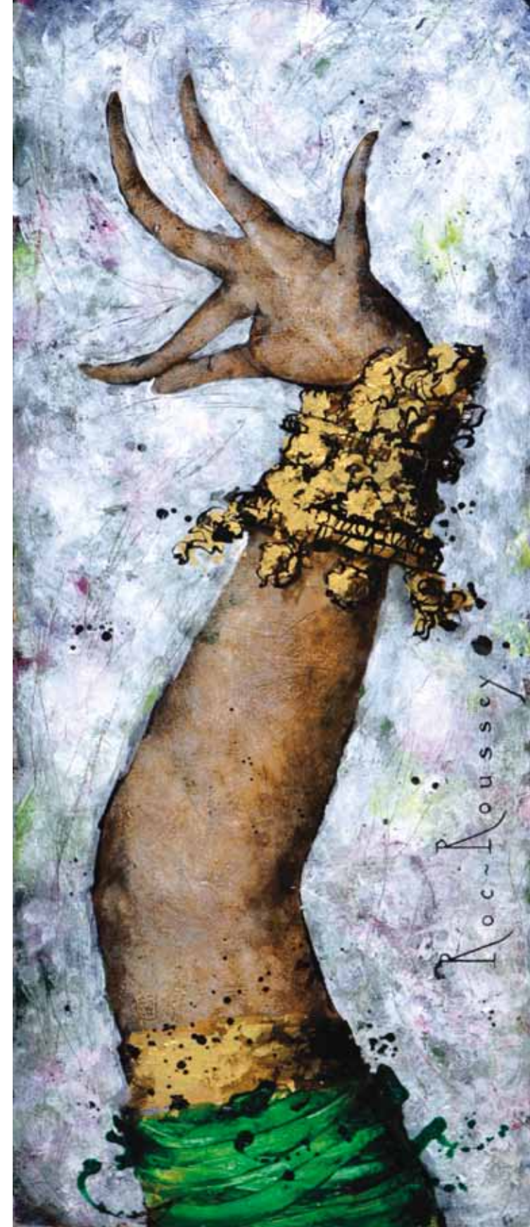
Main d'Apsara Oil on canvas 74,5 x 30 cm - 29.3 x 11.8 in.