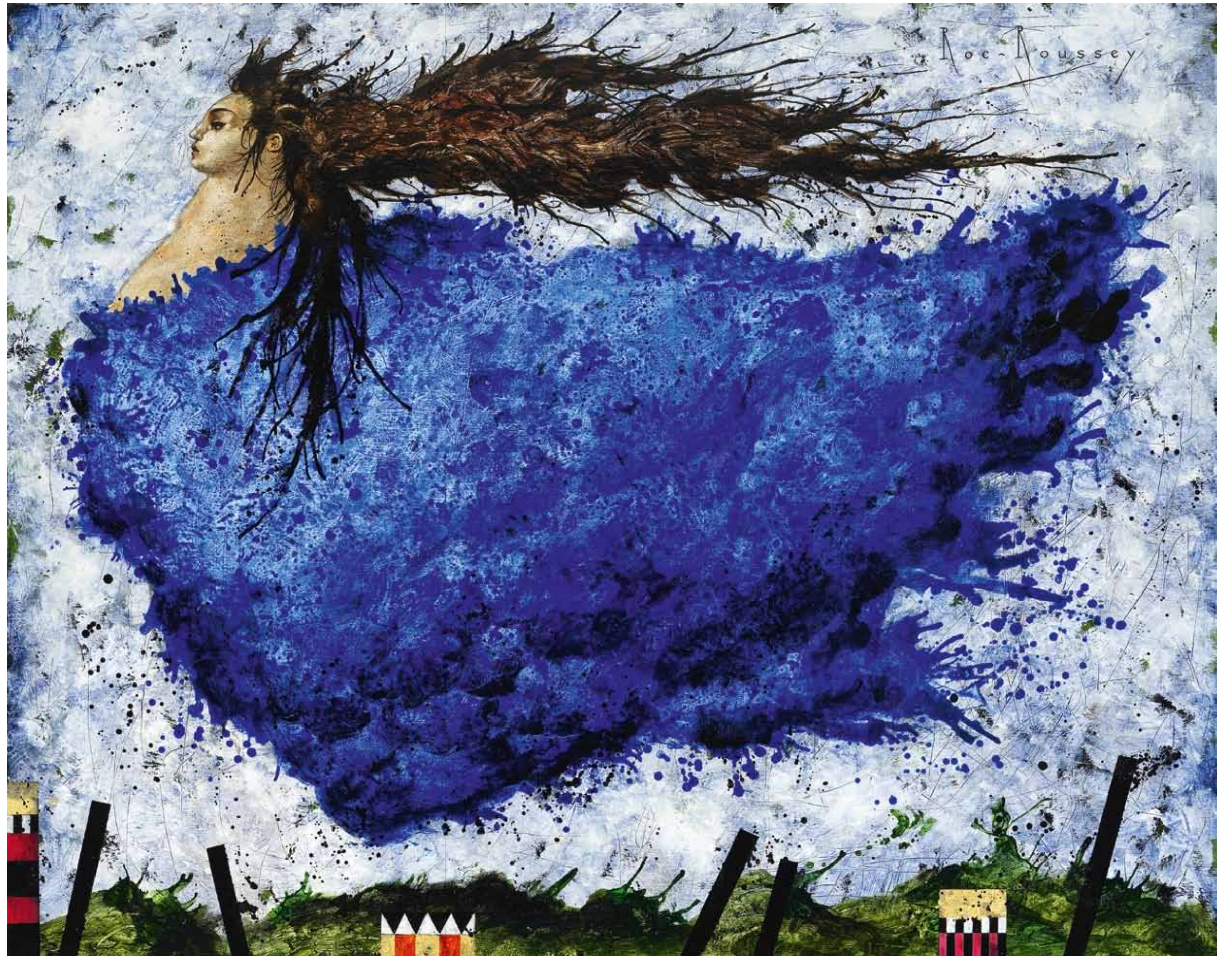
Springe bleue Oil on canvas 130 x 162 cm - 51.2 x 63.8 in.