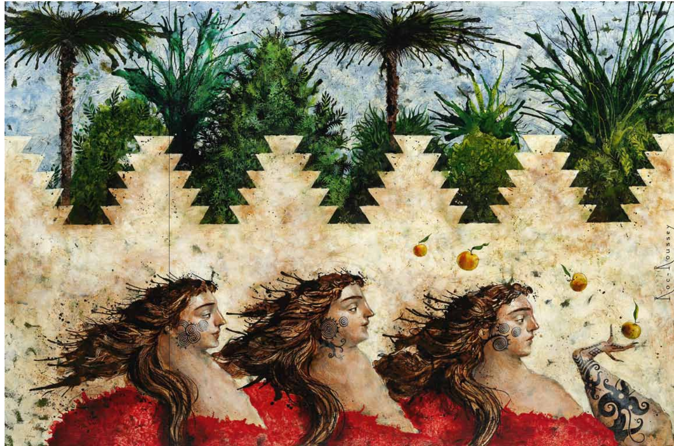
Le Jardin des péchés Oil on canvas 130 x 195 cm - 51.2 x 76.8 in.

“What interests me is the creativity that spans all cultures: from the most archaic to the most sophisticated. This feeds my very own, homegrown imagination...one that is constantly evolving. I like statues in wood and stone, but also tapestry...little fragments of all kinds and from various origins. And it is always thought-out, dreamed of, imagined...”