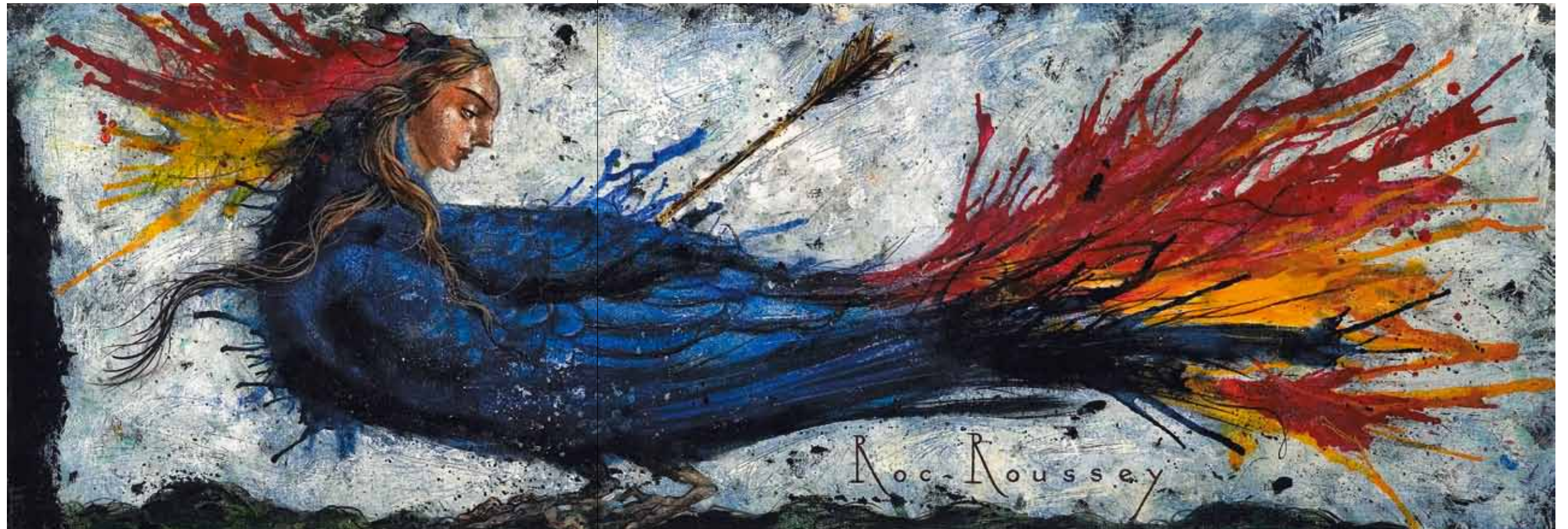
L'Oiseau blessé Oil on canvas 35 x 100 cm - 13.8 x 39.4 in. | Provenance The artist's studio