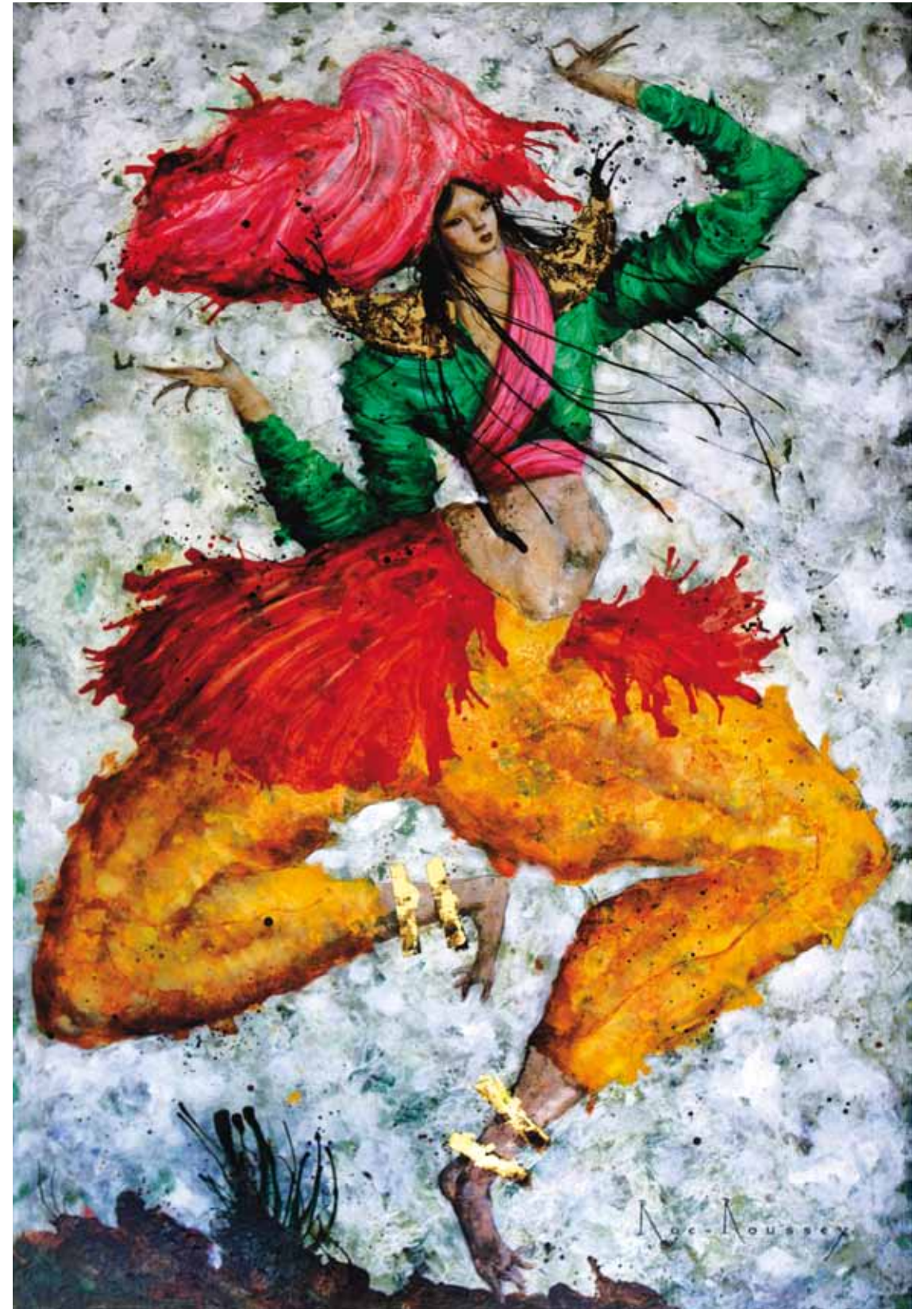
Apsara au turban rose Oil on canvas 195 x 130 cm - 76.8 x 51.2 in. | Provenance The artist's studio