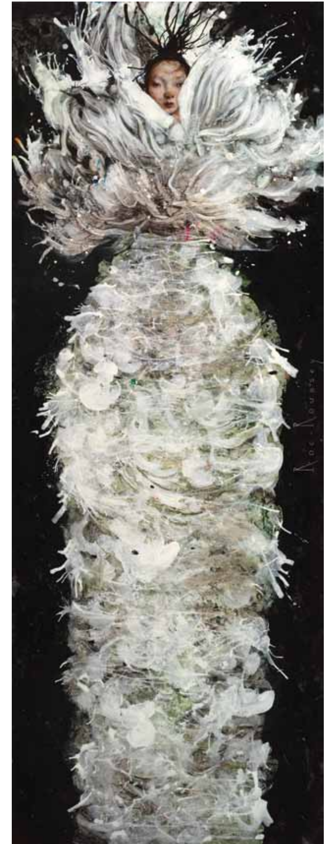
Première neige Oil on canvas 190 x 70 cm - 74.8 x 27.6 in. Provenance The artist's studio