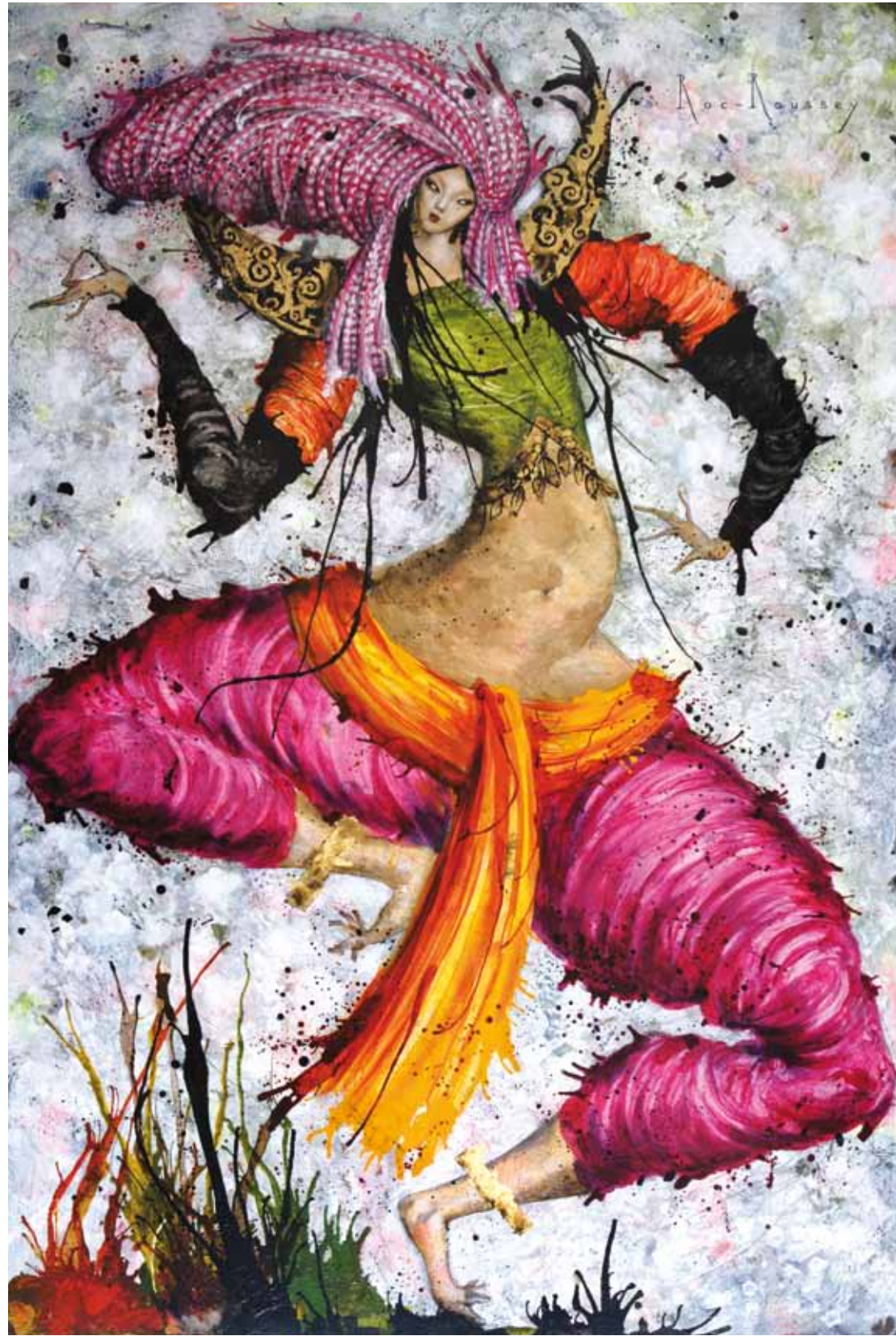
Apsara au krama Oil on canvas 195 x 130 cm - 76.8 x 51.2 in. | Provenance The artist's studio