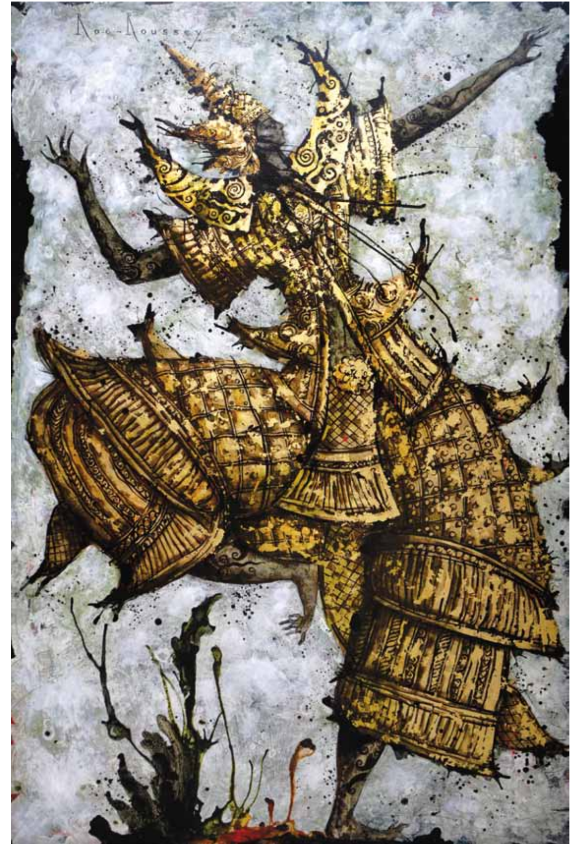
Grande Apsara d'or Est Oil on canvas 195 x 130 cm - 76.8 x 51.2 in.