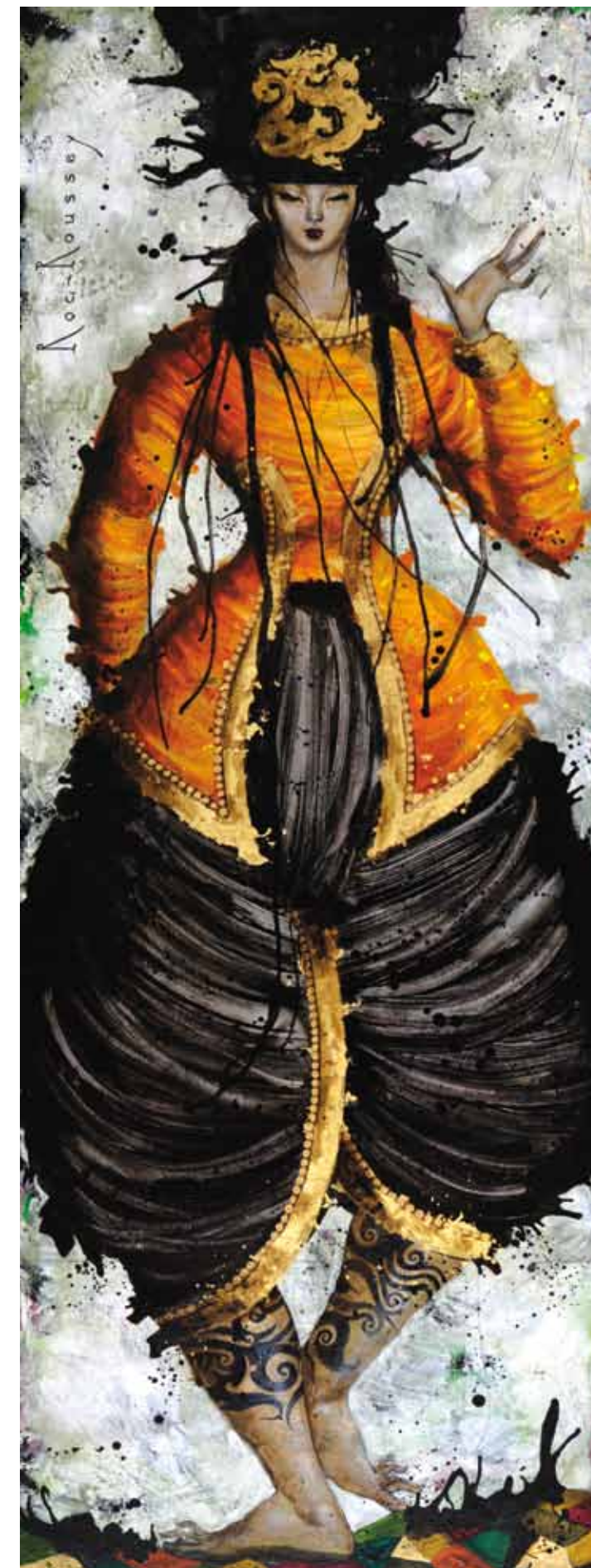
Grande Apsara au pantalon noir Oil on canvas 170 x 60 cm - 66.9 x 23.6 in.