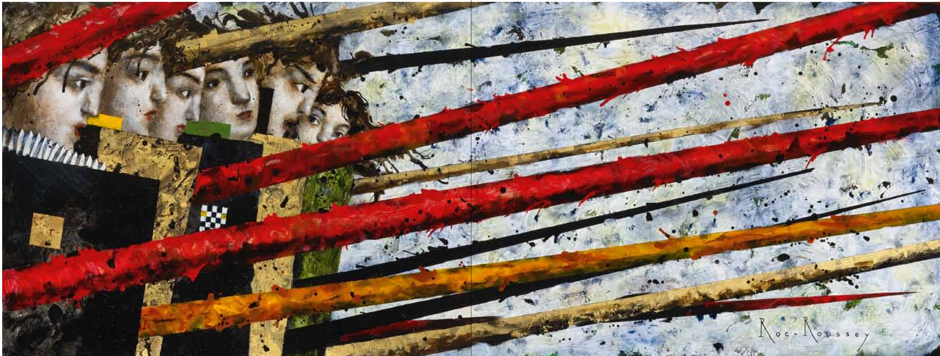
Bataille Oil on canvas 70 x 190 cm - 276 x 74.8 in. Provenance The artist's studio