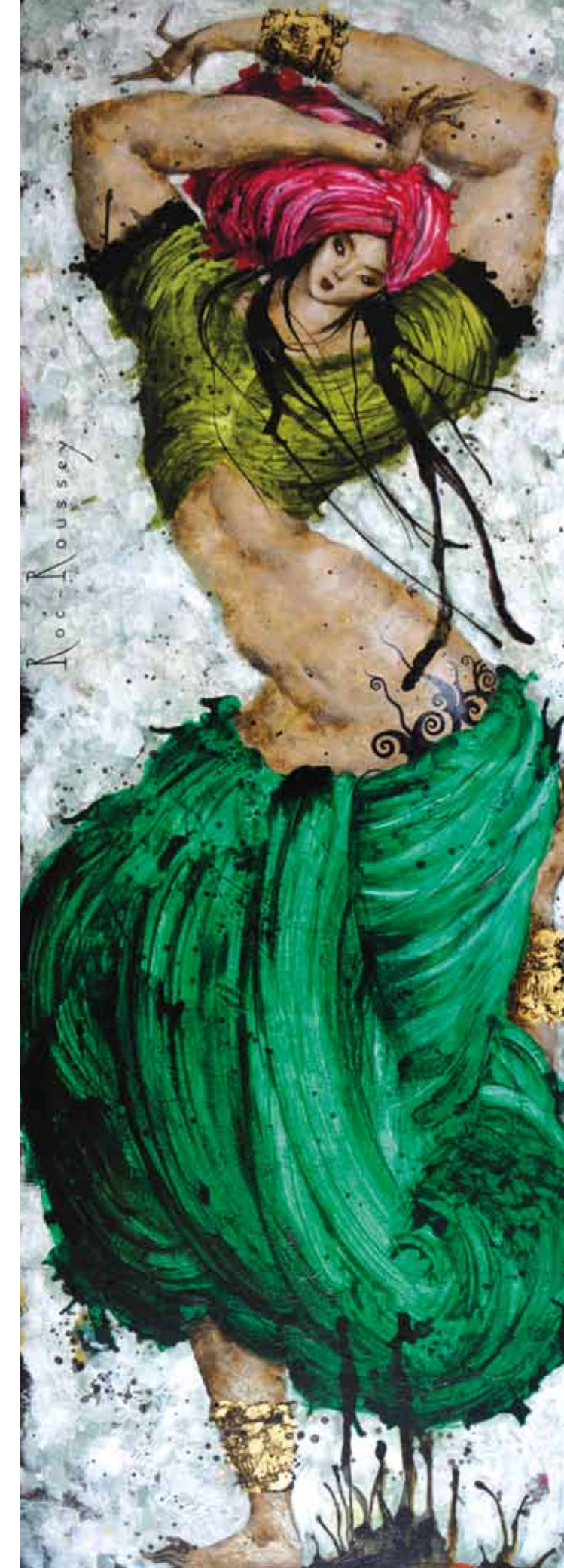
Danseuse cambodgienne aux bras levés Oil on canvas 170 x 60 cm - 66.9 x 23.6 in. | Provenance The artist's studio