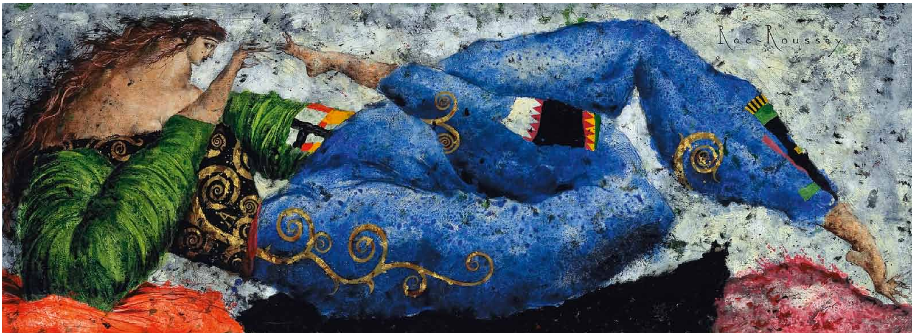
Odalisque au pied blessé Oil on canvas 70 x 190 cm - 27.6 x 74.8 in.