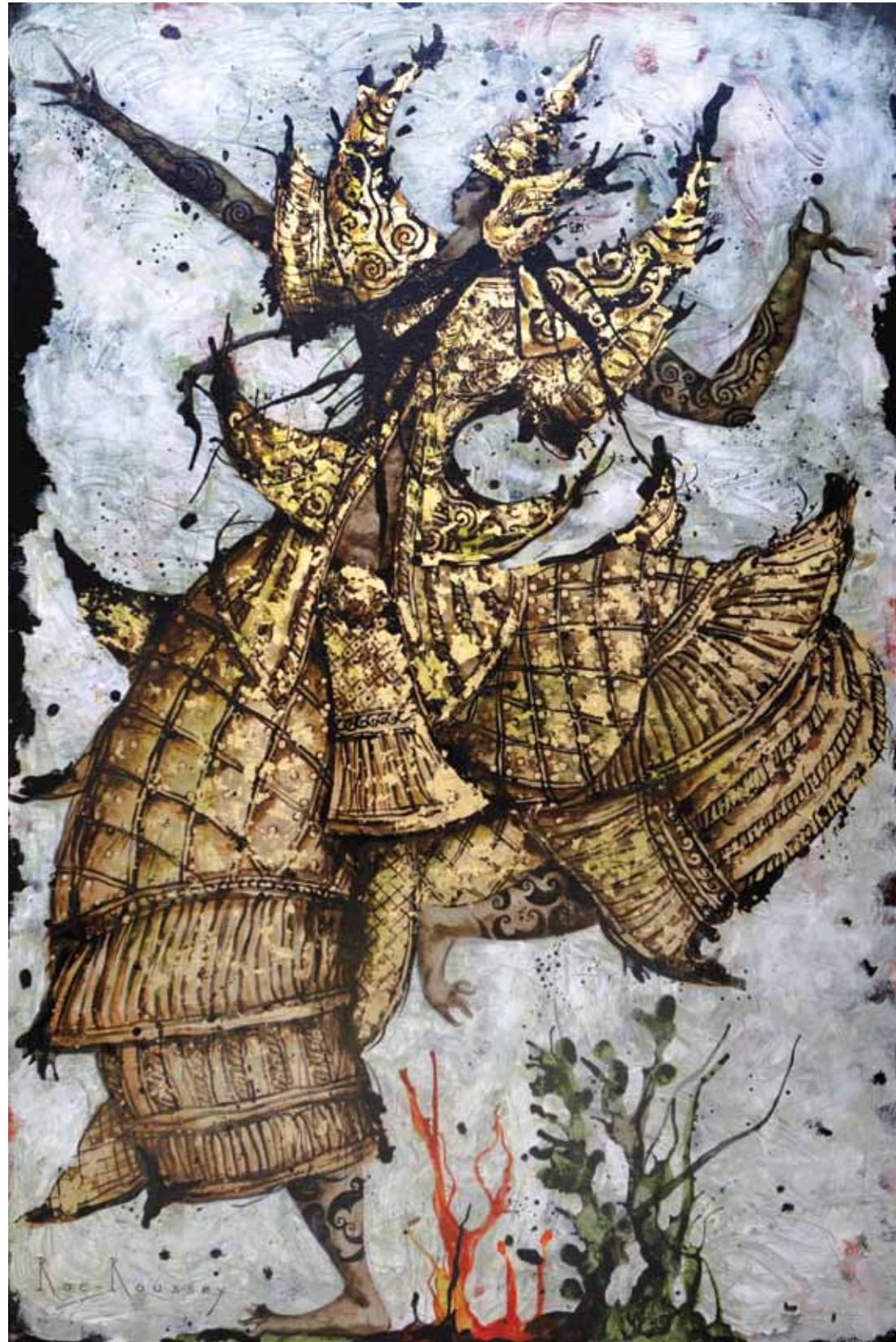
Grande Apsara d'or Ouest Oil on canvas 195 x 130 cm - 76.8 x 51.2 in.