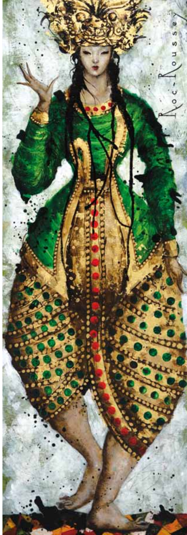
Petite danseuse au pantalon d'or Oil on canvas 100 x 35 cm - 39.4 x 13.8 in. | Provenance The artist's studio