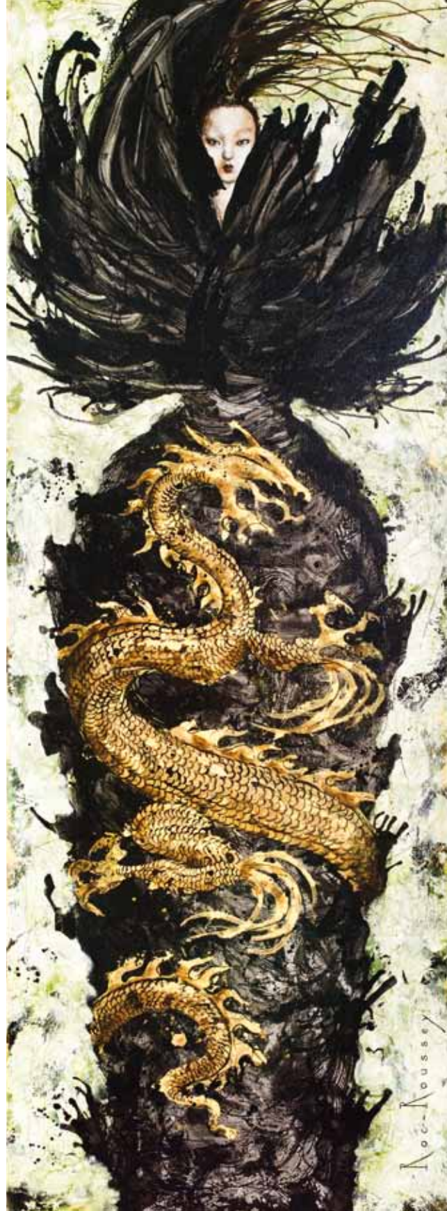
Grand dragon noir Oil on canvas 190 x 70 cm - 74.8 x 27.6 in.