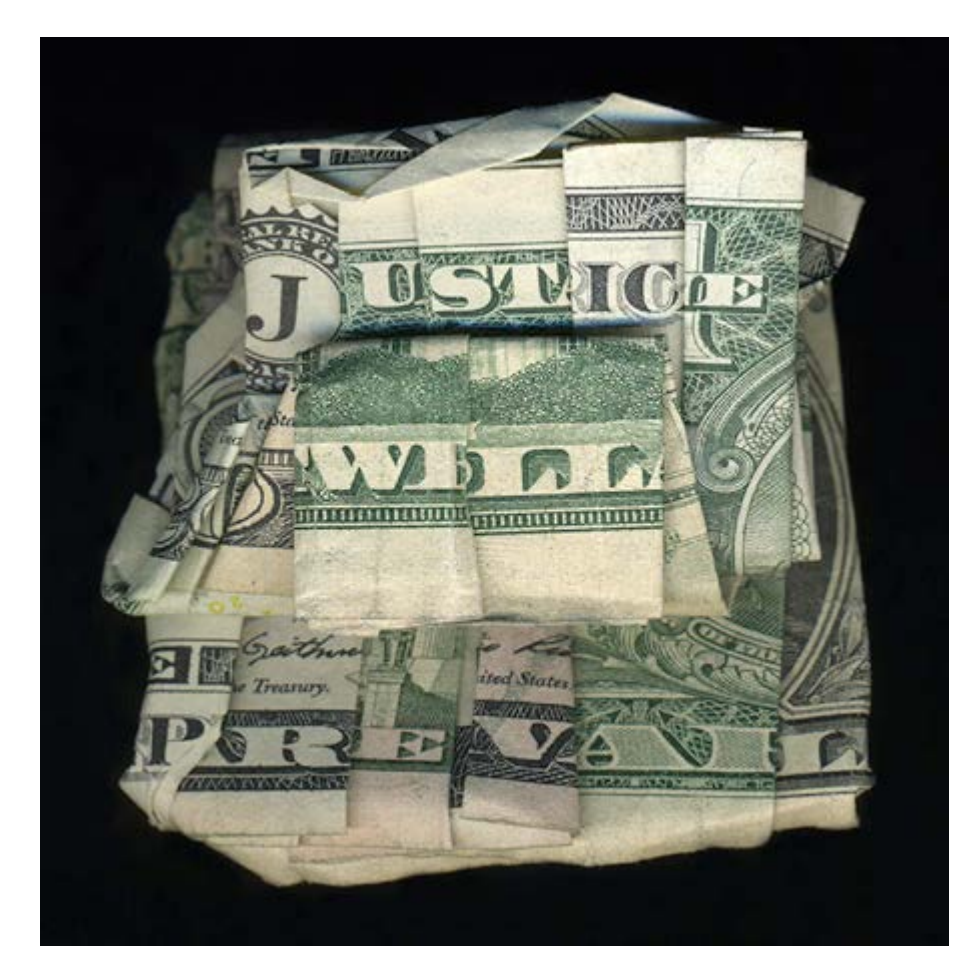
JUSTICE WILL PREVAIL, 2015

Photograph, edition of 7 102 x 102 cm - 40.2 x 40.2 in.