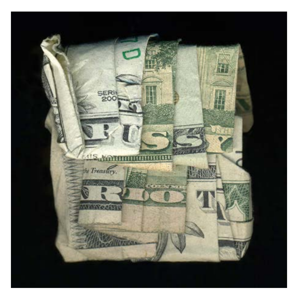
PUSSY RIOT, 2015 Photograph, edition of 7 102 x 102 cm - 40.2 x 40.2 in.