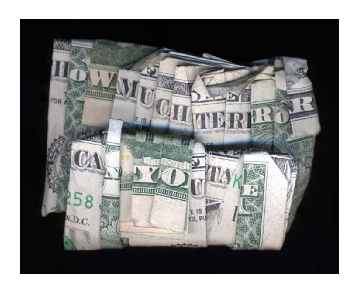
HOW MUCH TERROR CAN YOU TAKE, 2015 Photograph, edition of 7 102 x 127 cm - 40.2 x 50 in.