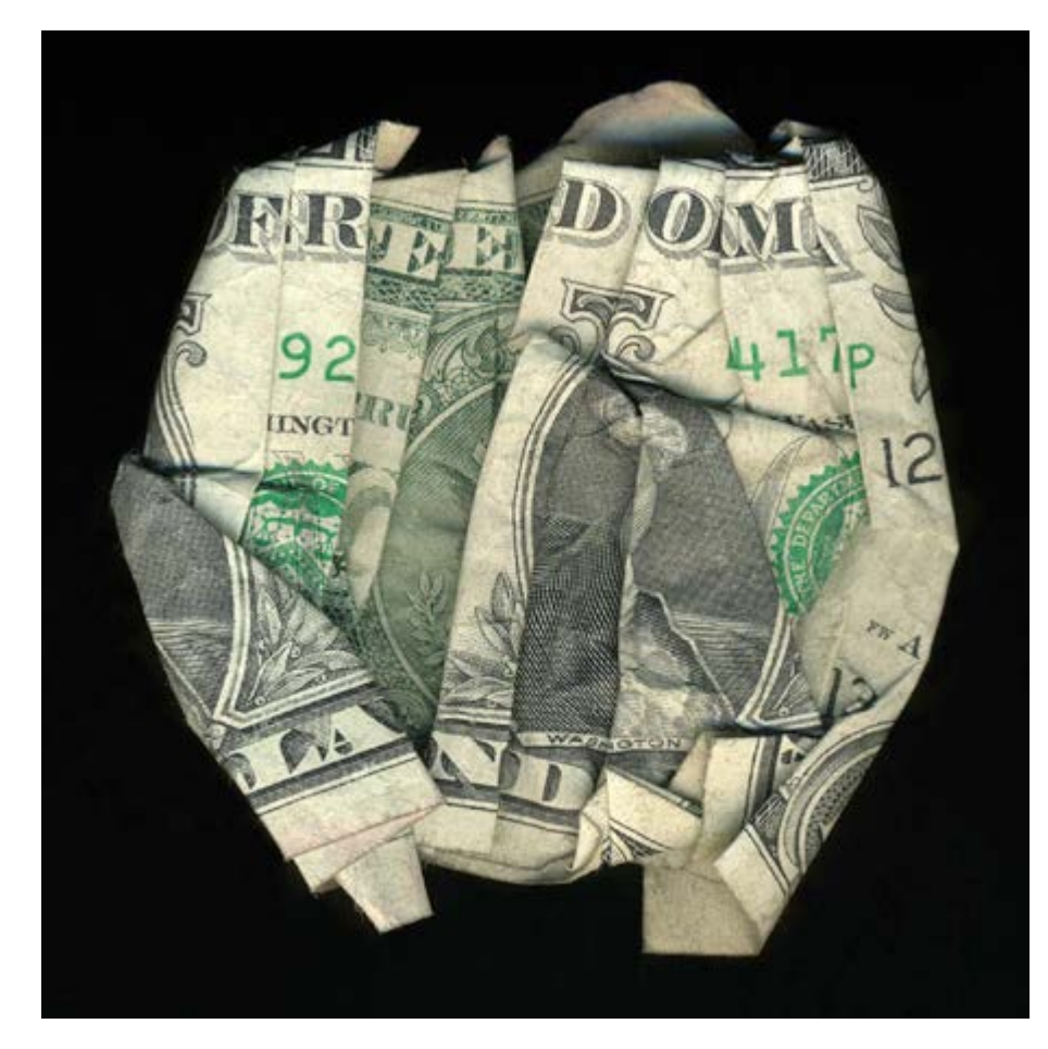
FREEDOMLAND, 2015 Photograph, edition of 7 102 x 102 cm - 40.2 x 40.2 in.