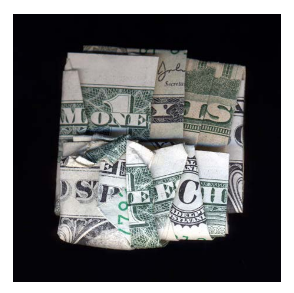
MONEY IS SPEECH, 2015

Photograph, edition of 7 102 x 102 cm - 40.2 x 40.2 in.