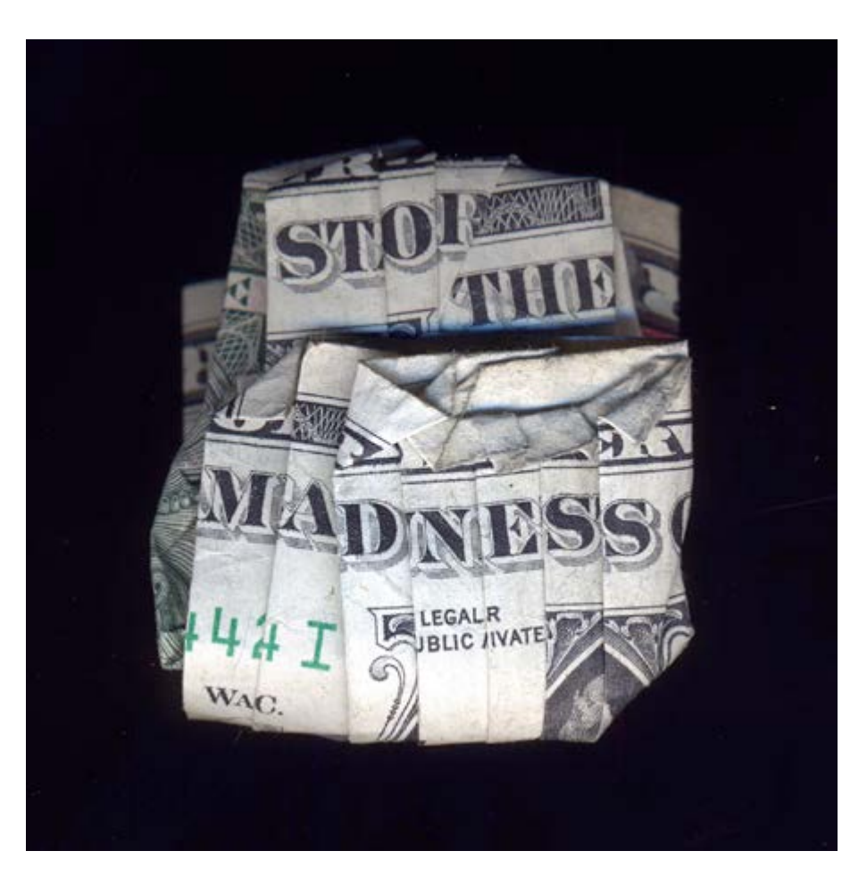
STOP THE MADNESS, 2015 Photograph, edition of 7 102 x 102 cm - 40.2 x 40.2 in.