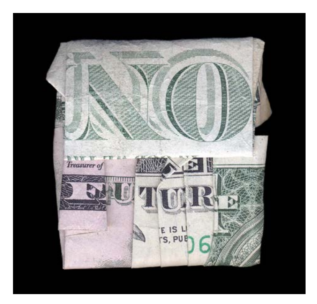
NO FUTURE, 2015

Photograph, edition of 2 151 x 151 cm - 59.4 x 59.4 in. Photograph, edition of 7 102 x 102 cm - 40.2 x 40. 2 in.