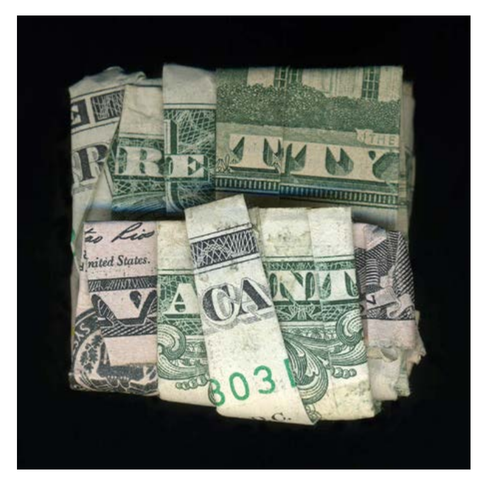
PRETTY VACANT, 2015 Photograph, edition of 7 102 x 102 cm - 40.2 x 40.2in.