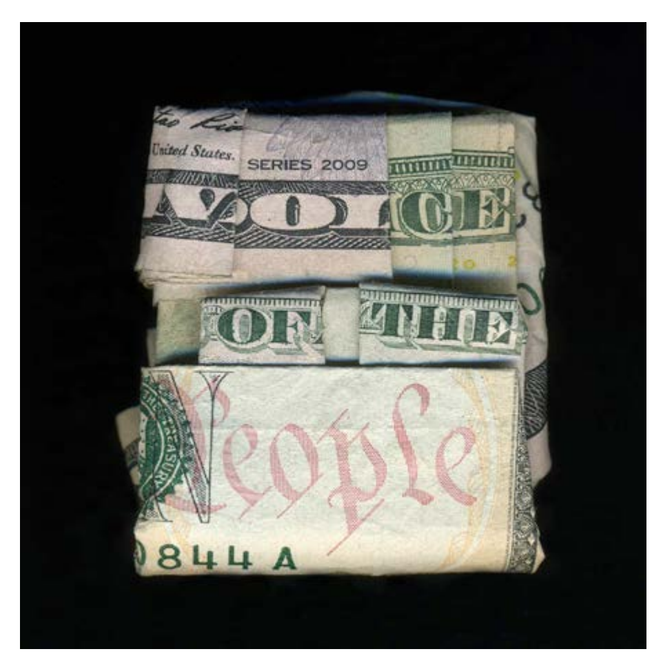
VOICE OF THE PEOPLE, 2015 Photograph, edition of 7 102 x 102 cm - 40.2 x 40.2 in.