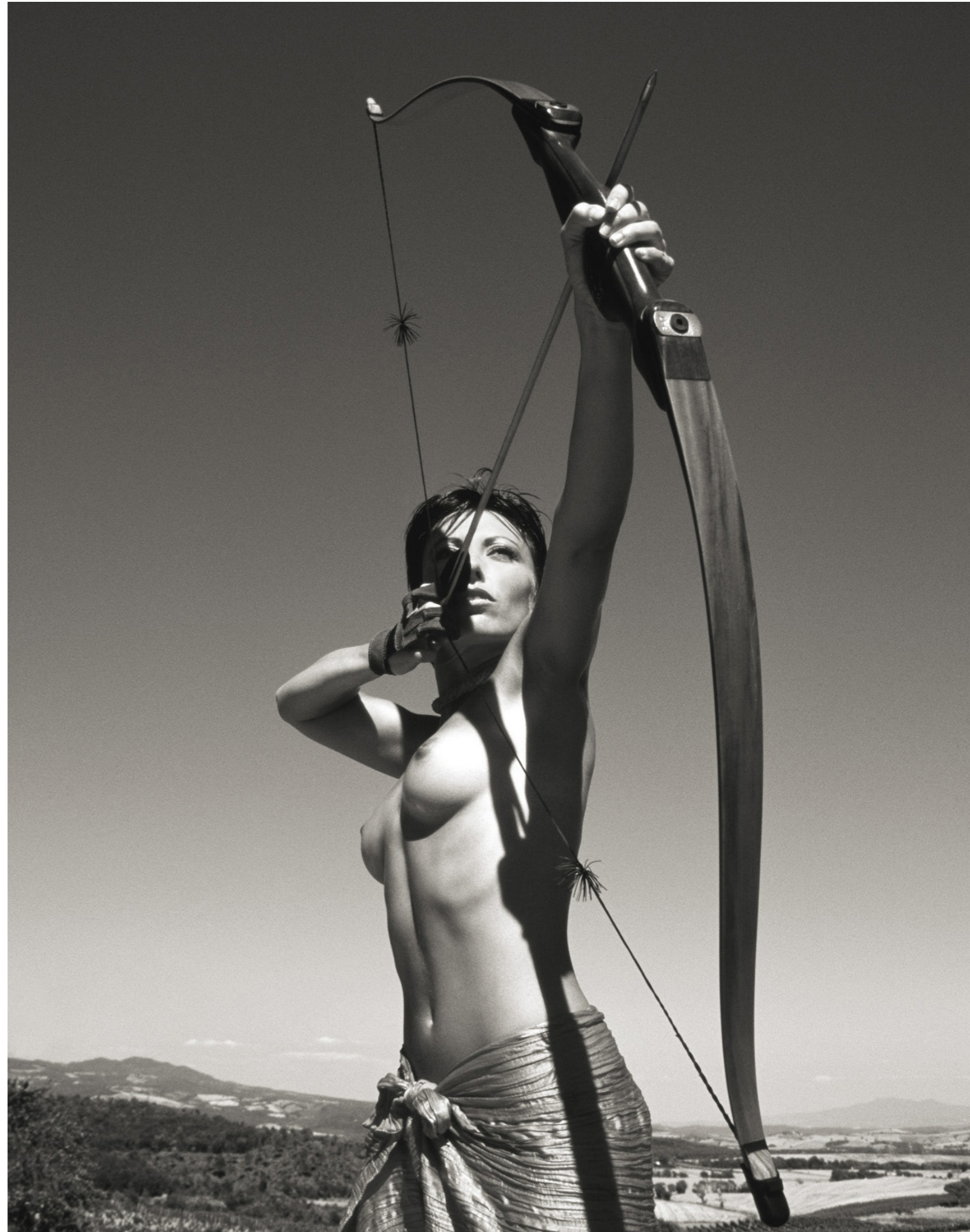
Beatrice, 1994 Photography, edition of 24 61 x 51 cm - 24 x 20 in.