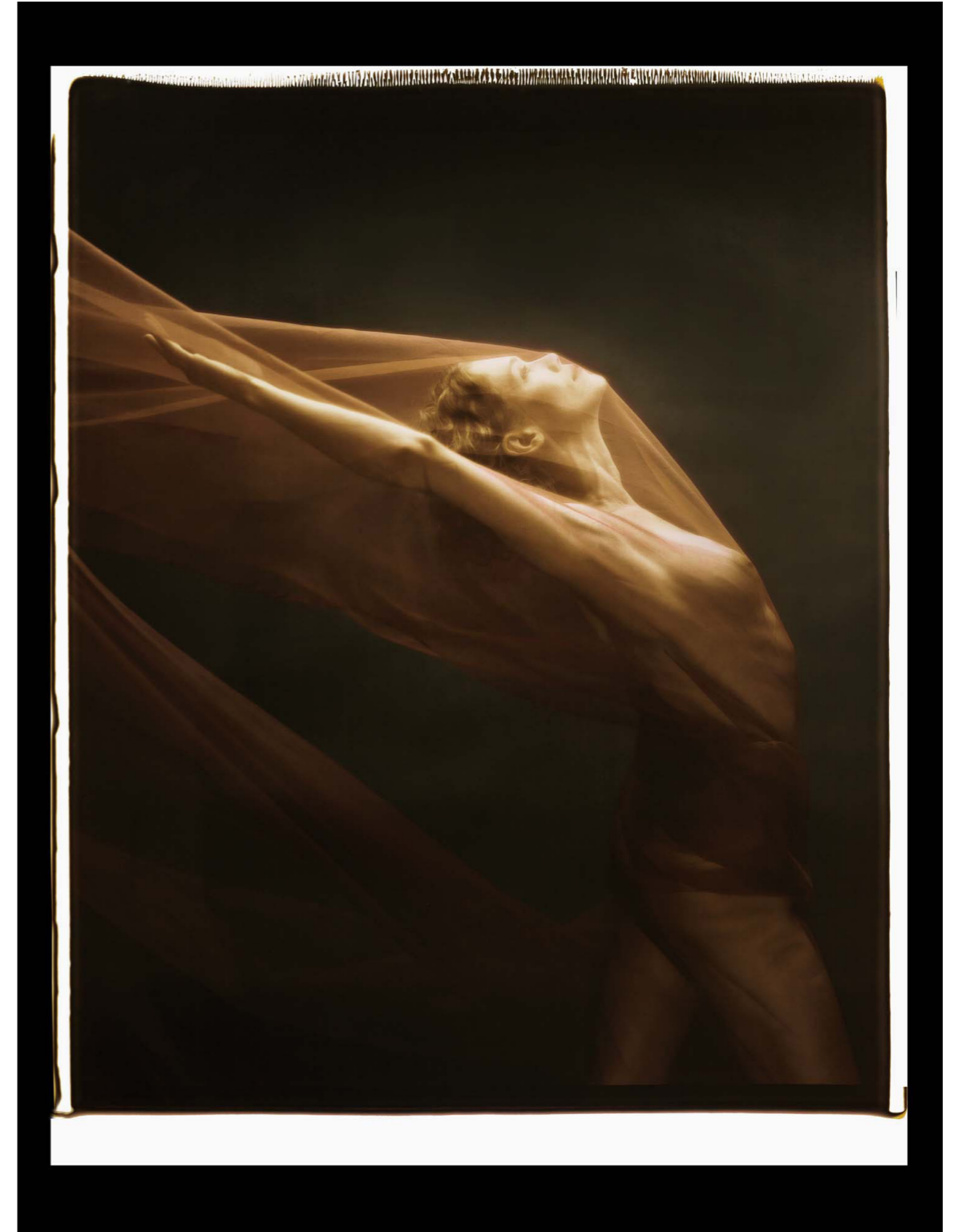
Dancer, 2000 Photography, edition of 24 101,5 x 76 cm - 40 x 30 in.