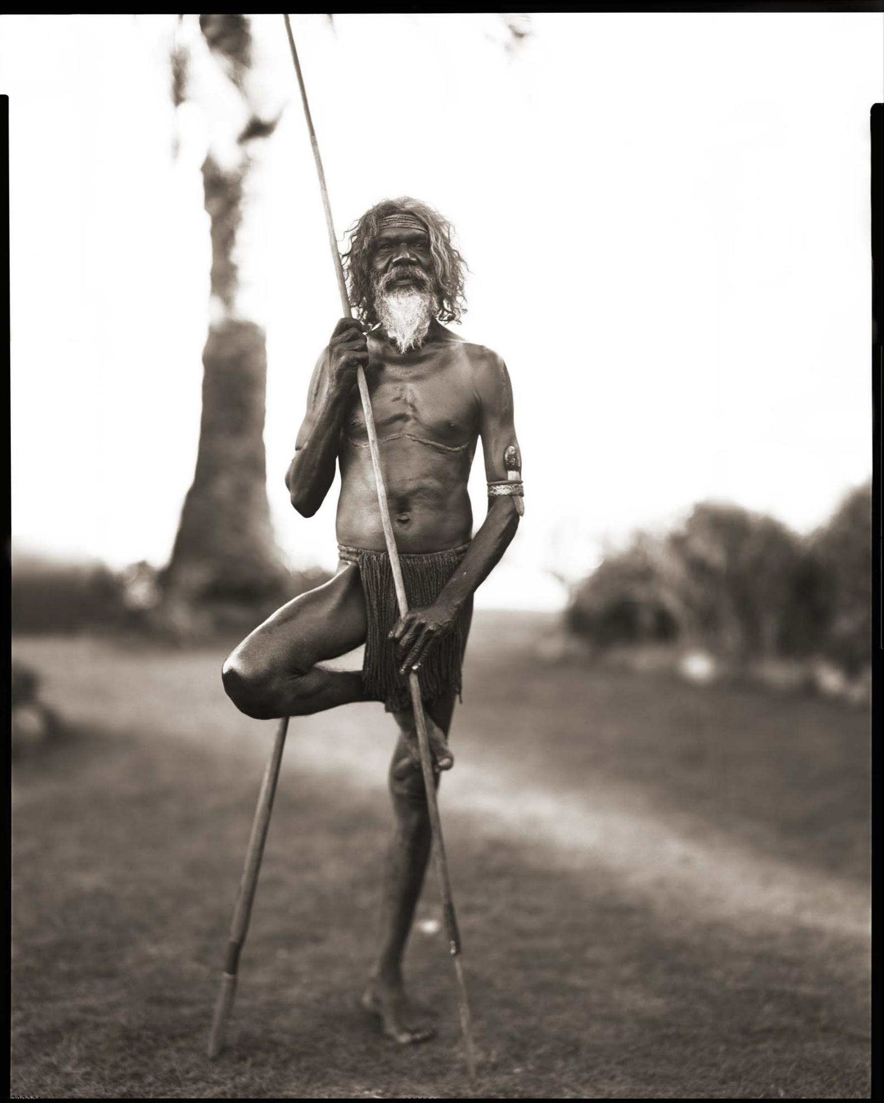
Aboriginal in Australia, 2007 Photography, edition of 24 101,5 x 76 cm - 40 x 30 in.