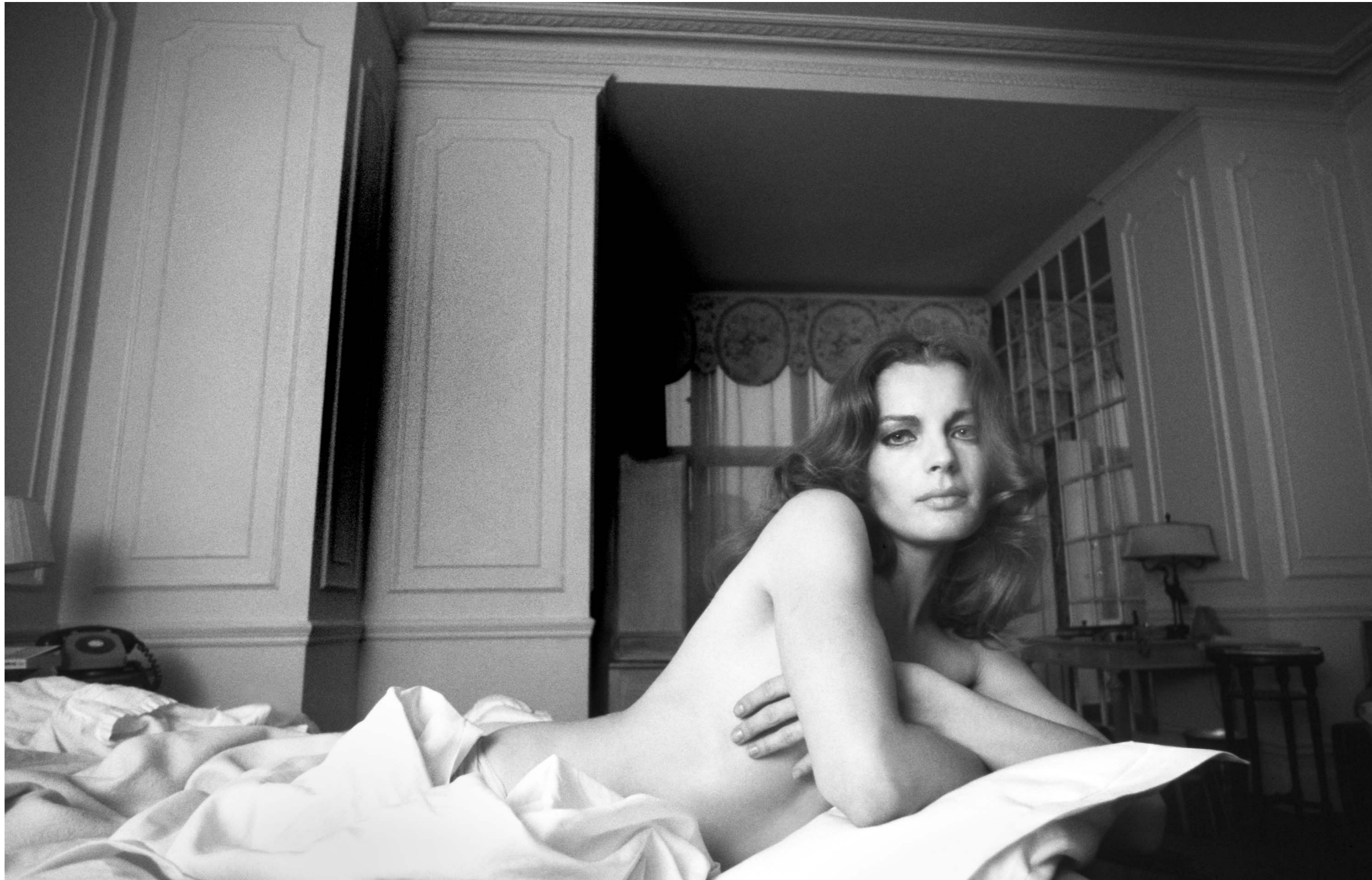
Romy Schneider, 1969 Photography, edition of 24 51 x 61 cm - 20 x 24 in.