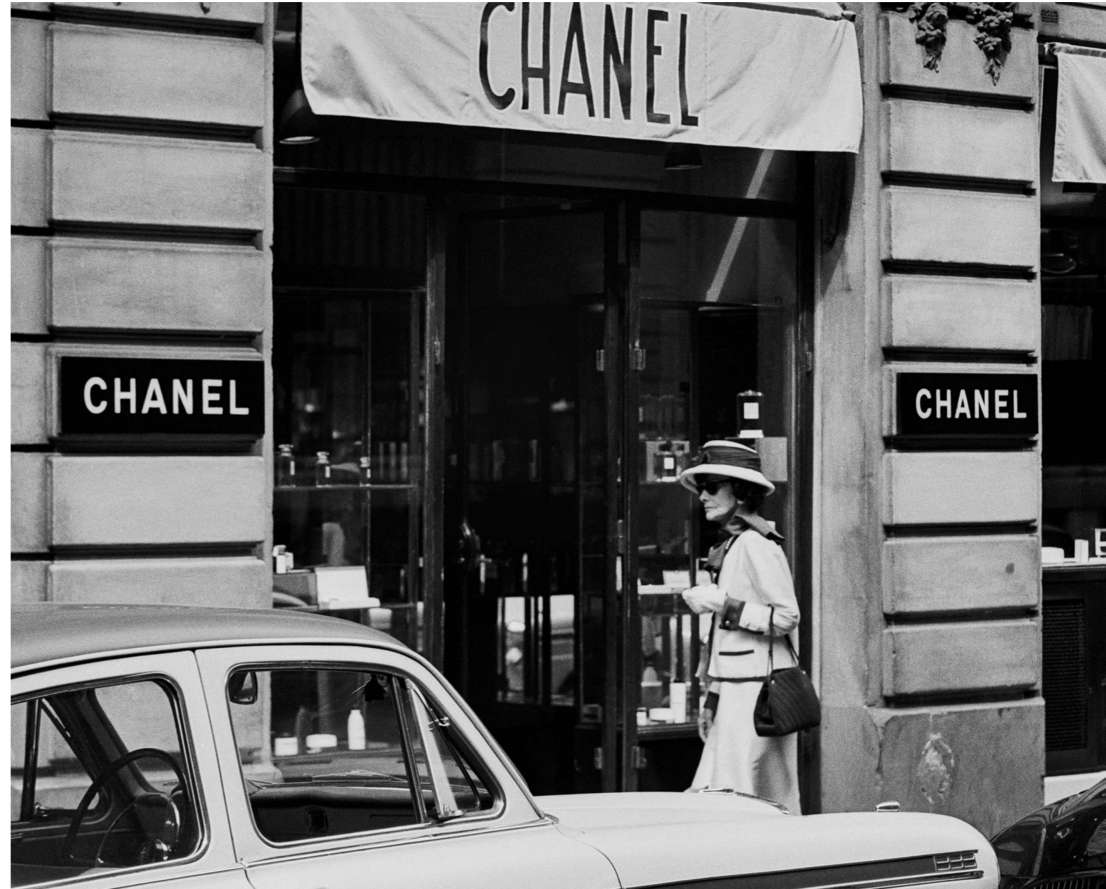
Coco Chanel, Paris, 1962 Photography, edition of 24 51 x 61 cm - 20 x 24 in.