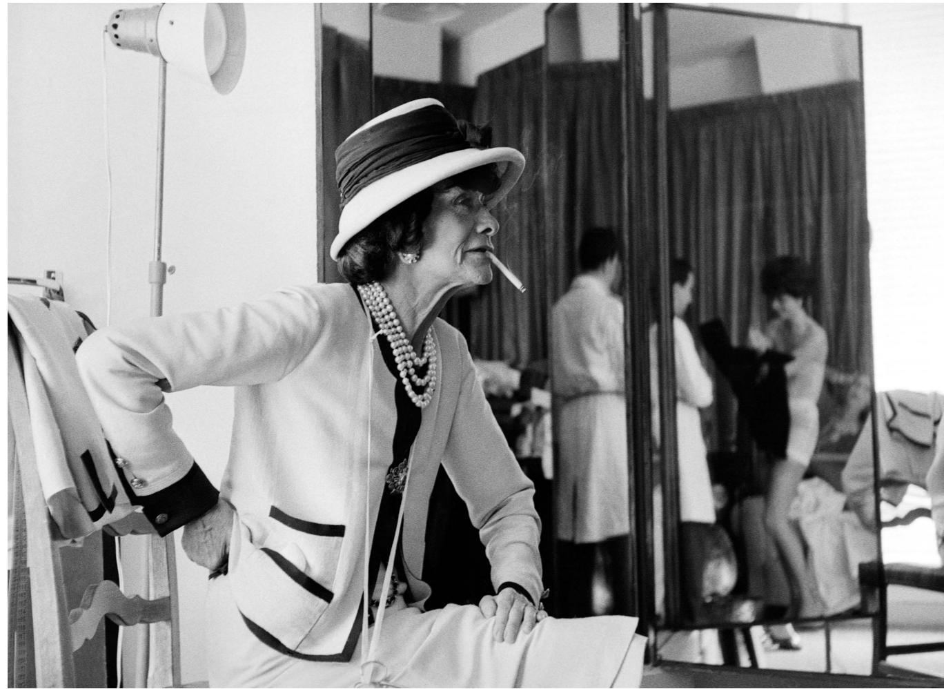
Coco Chanel, Paris, 1962 Photography, edition of 24 76 x 101,5 cm - 30 x 40 in.