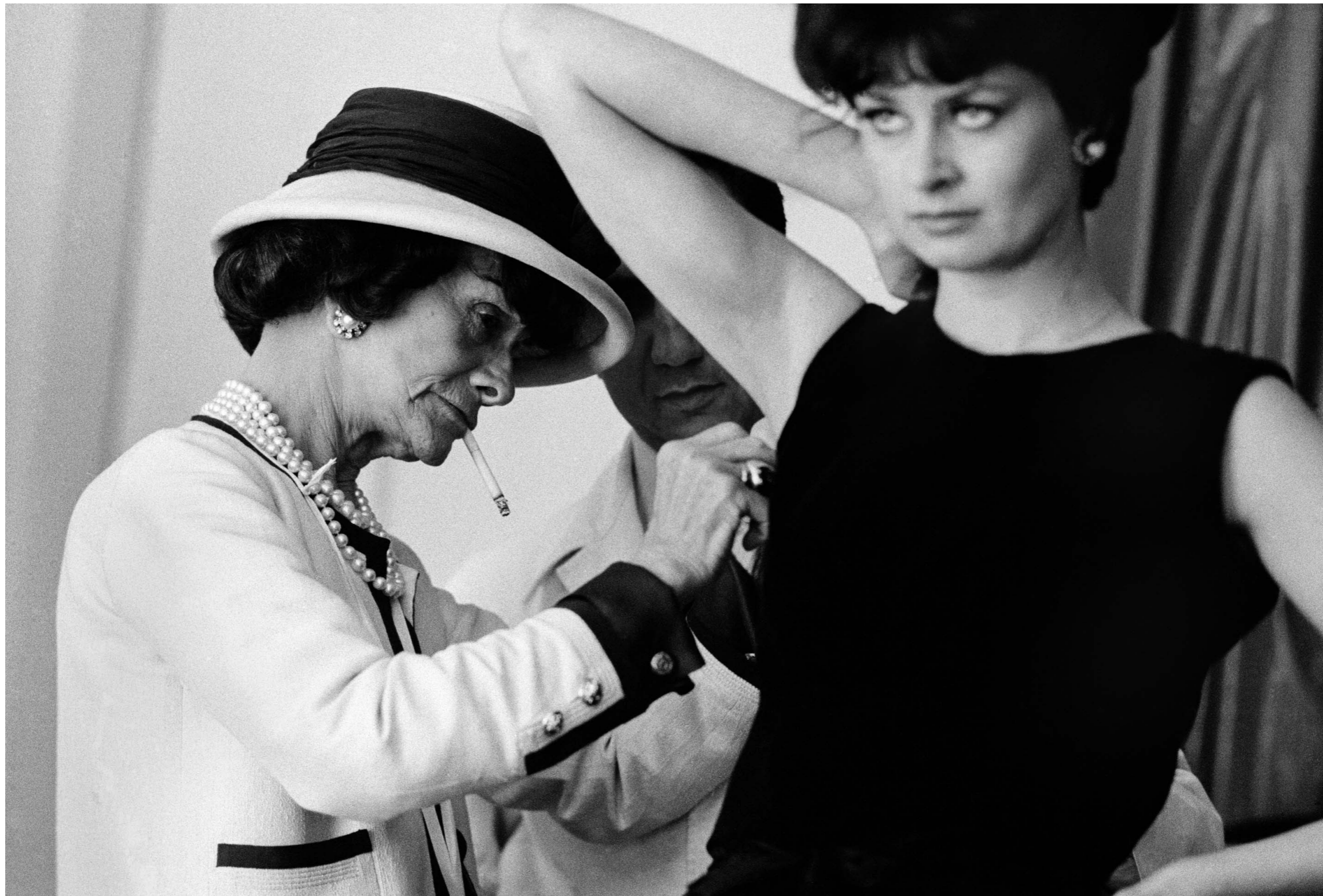
Coco Chanel, Paris, 1962 Photography, edition of 24 51 x 61 cm - 20 x 24 in.