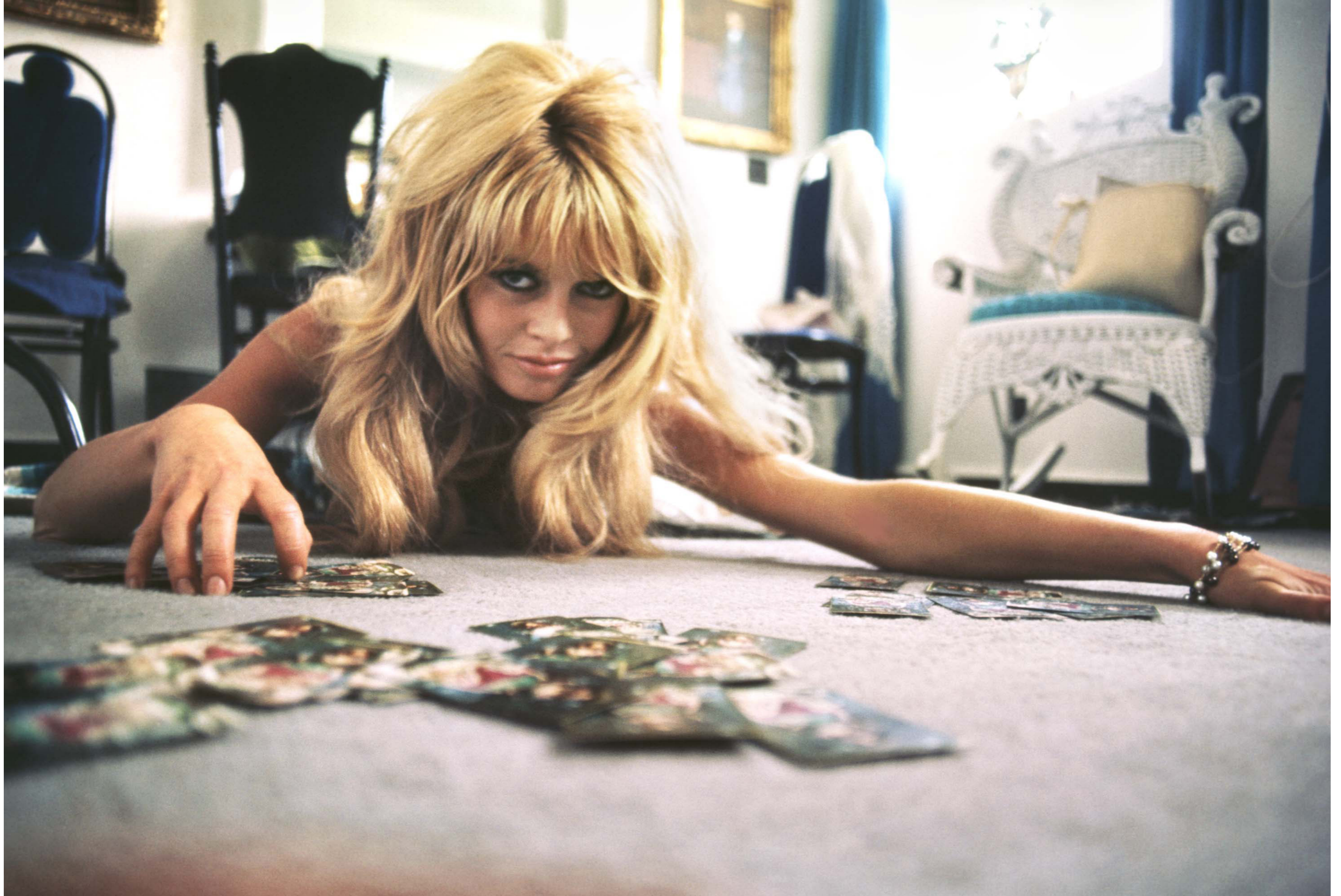
Brigitte Bardot, Mexico, 1965 Photography, edition of 25 101,5 x 152,5 cm - 40 x 60 in.