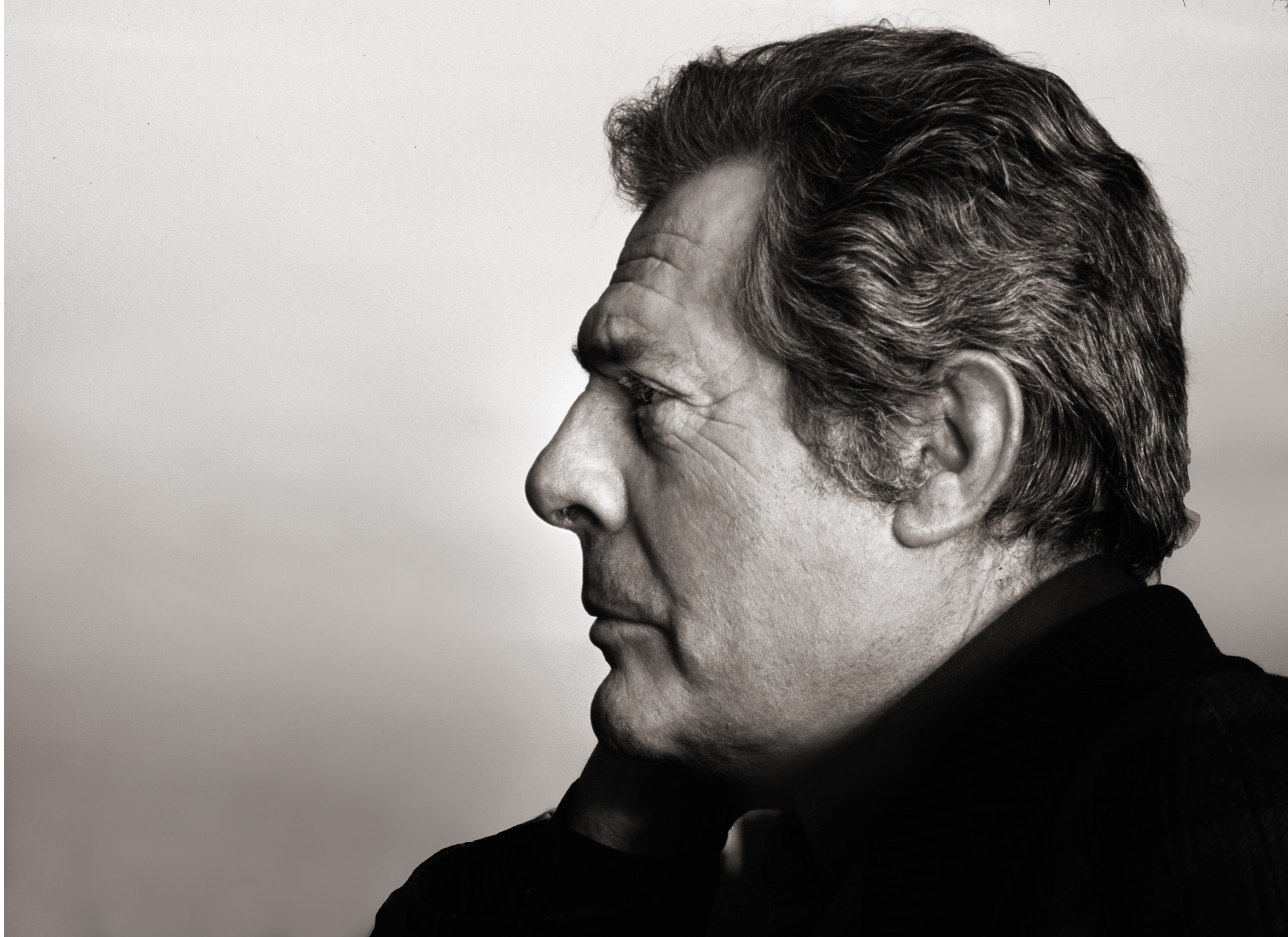
Marcello Mastroianni, 1993 Photography, edition of 24 51 x 61 cm - 20 x 24 in.