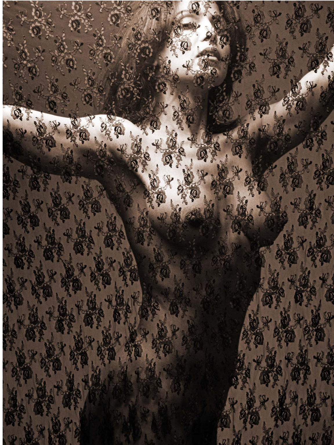
Veiled Beauty, 1996 Photography, edition of 24 101,5 x 76 cm - 40 x 30 in.