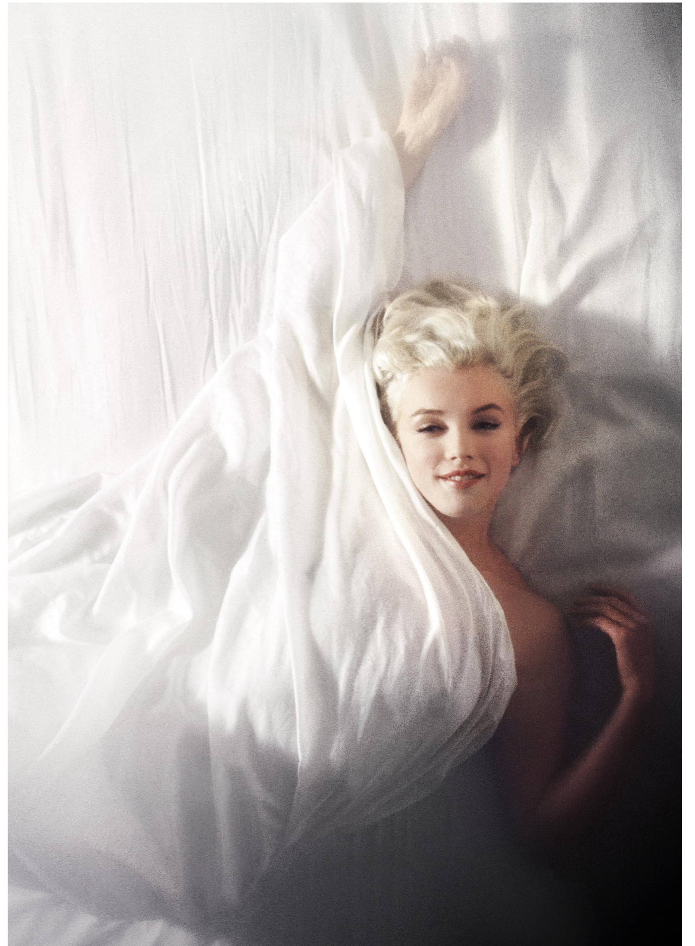
Marilyn Monroe, 1961 Photography, edition of 25 152,5 x 101,5 cm - 60 x 40 in.