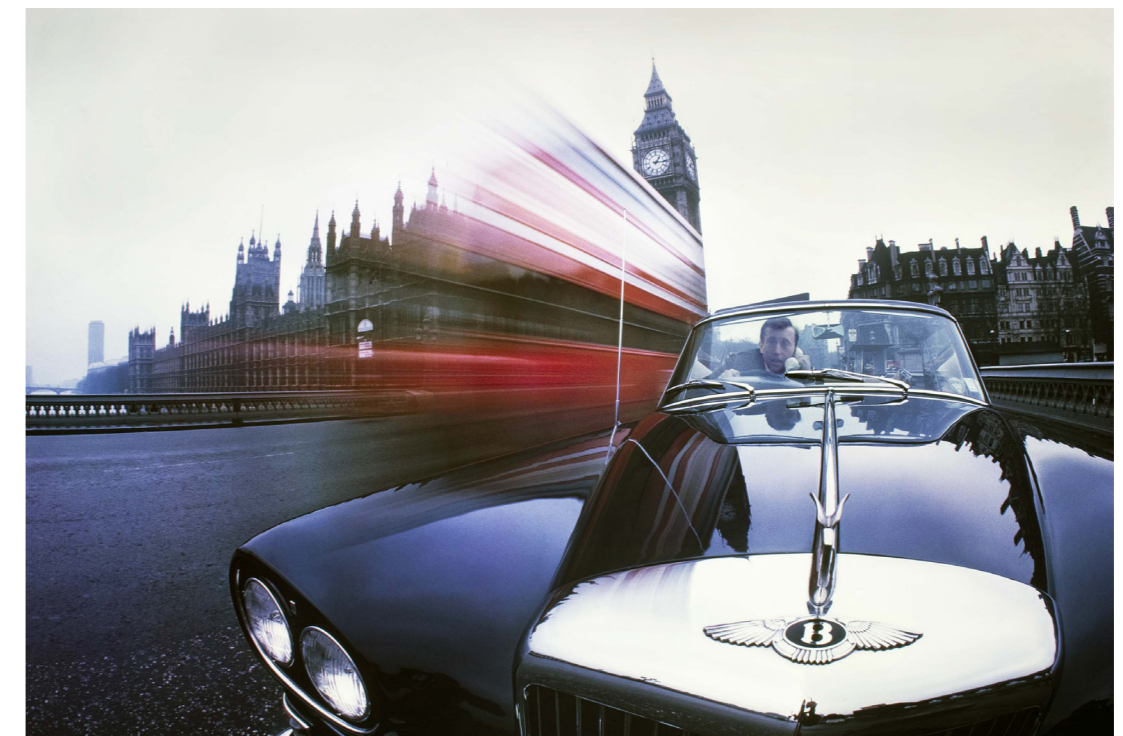
David Frost, 1969 Photography, edition of 24 51 x 61 cm - 20 x 24 in.