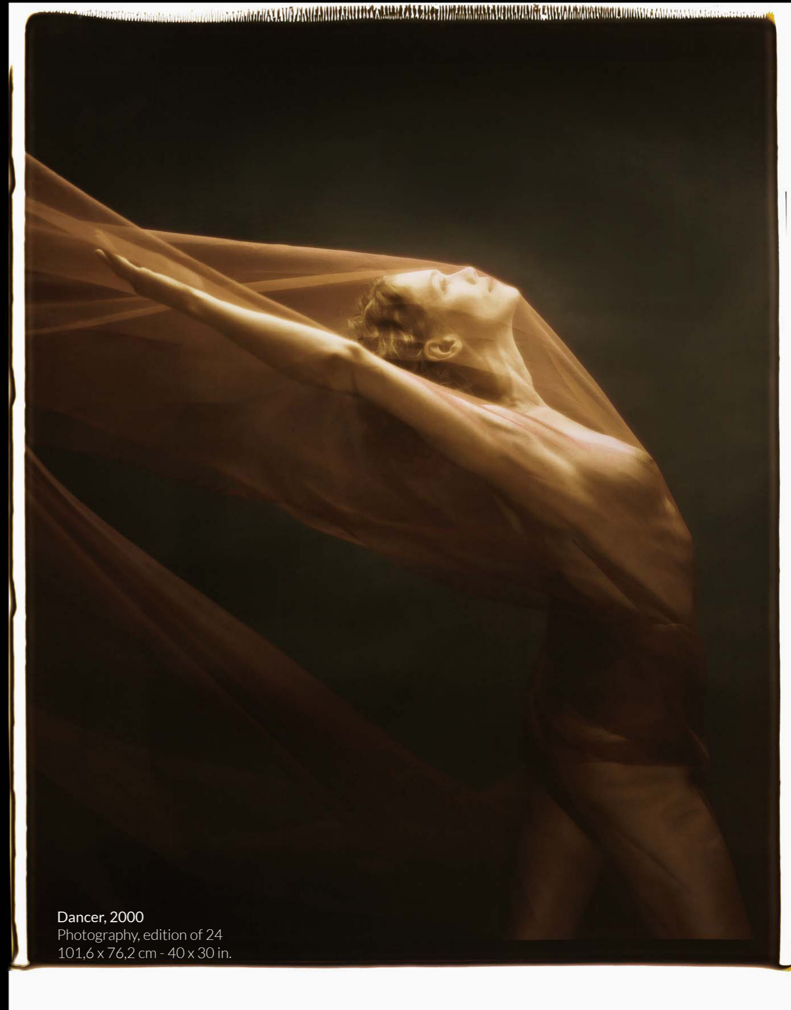
Dancer, 2000 Photography, edition of 24 101,6 x 76,2 cm - 40 x 30 in.