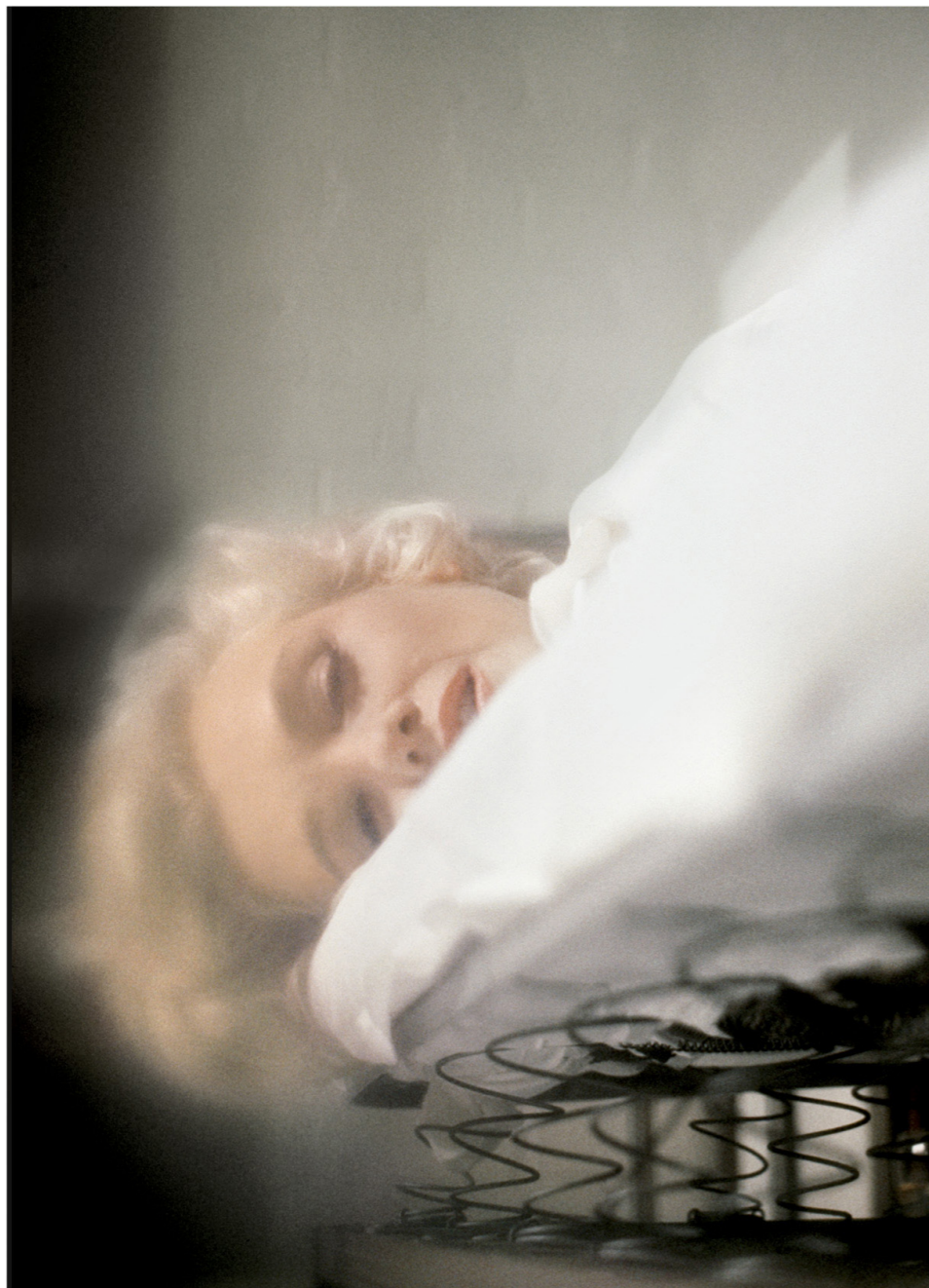
Marilyn Monroe, 1961 Photography, edition of 25 152,5 x 101,5 cm - 60 x 40 in.