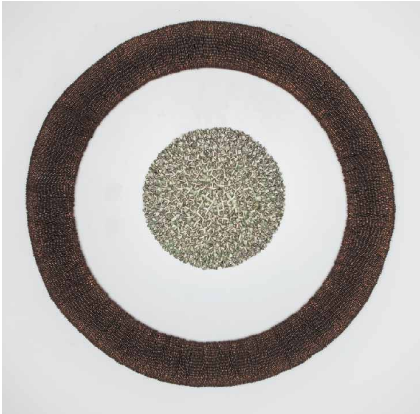
RICH & POOR, 2011

Coins and bills, unique piece - D: 152,5 cm - 60 in.