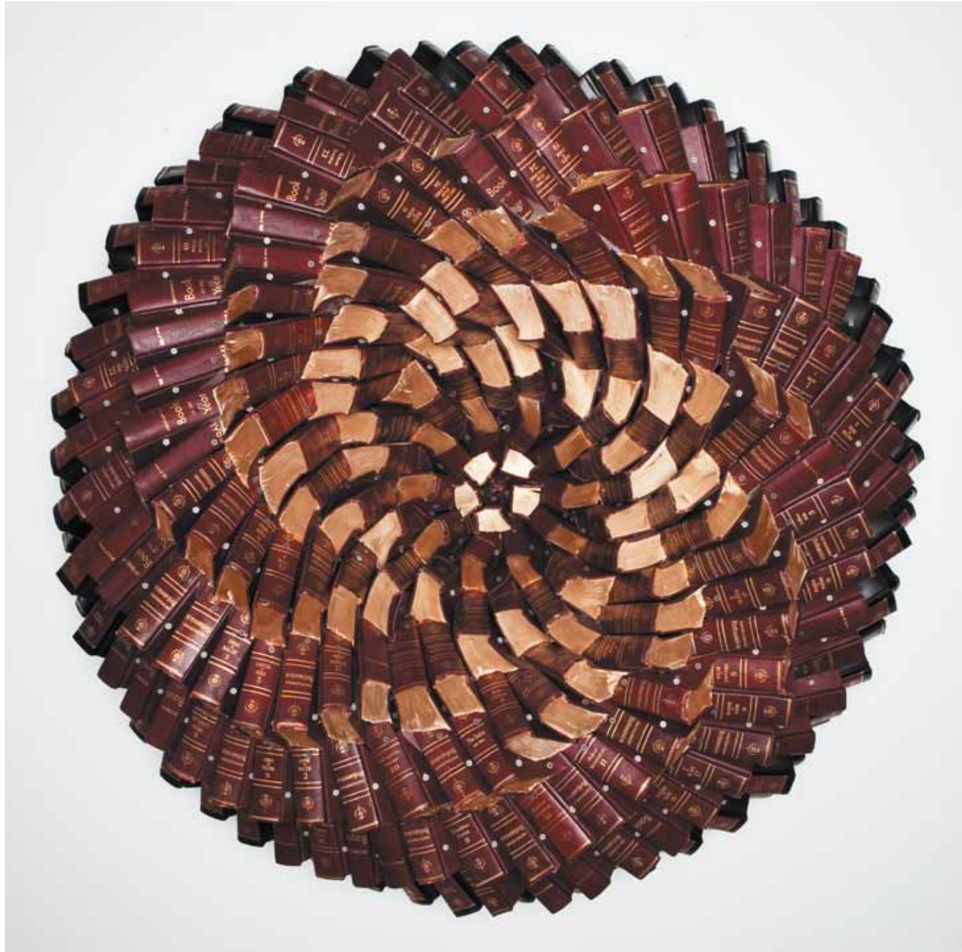
DEEP KNOWLEDGE, 2011 Books, unique piece - D: 122 cm - 48 in.