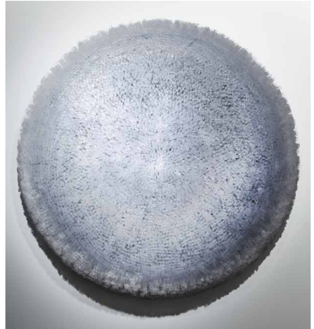
MOON, 2010 Forks, unique piece - D: 137 cm - 53.9 in.