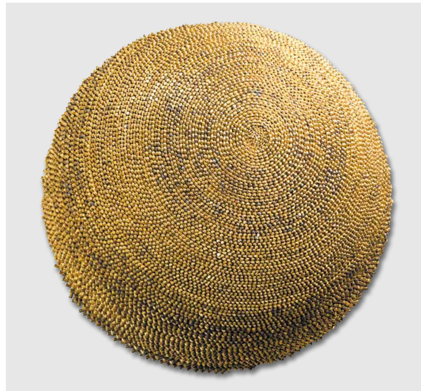
MISSED TARGET, 2011 Bullets, unique piece - D: 122 cm - 48 in.