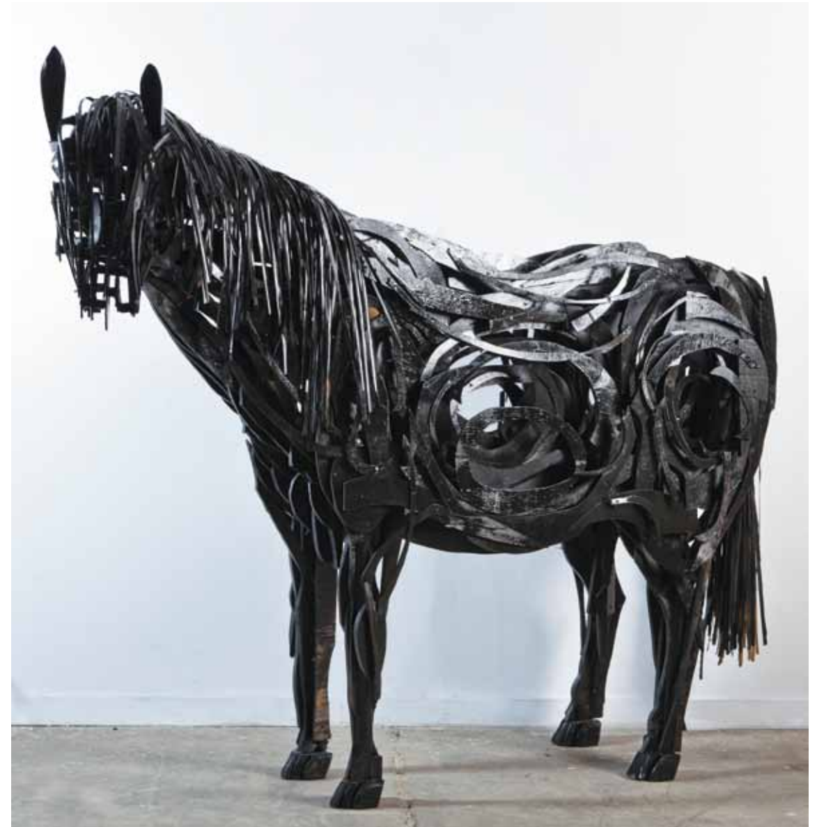
BLACK HORSE, 2010

Bicycle tyres, unique piece - 175,5 x 213,5 cm - 69.1 x 84.1 in.