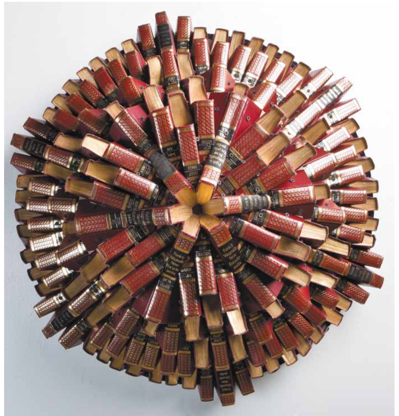
THE EYES OF KNOWLEDGE, 2011

Pencils, unique piece - D: 122 cm - 48 in.