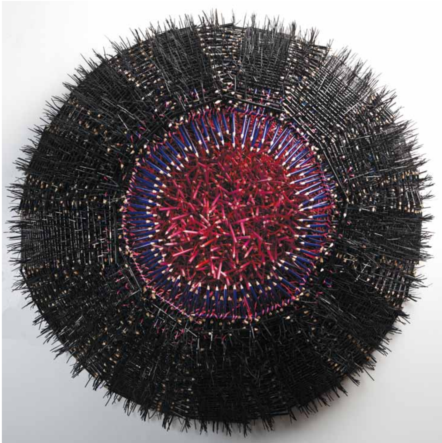
BLACK EYE, 2011

Pencils, unique piece - D: 122 cm - 48 in.