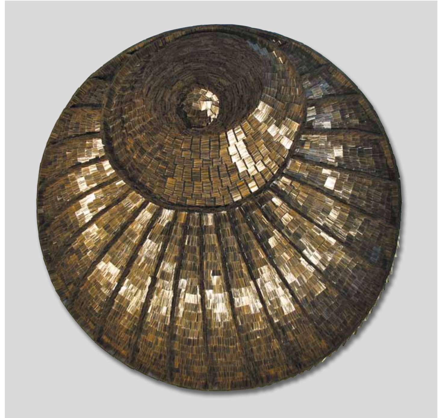
CROP CIRCLE, 2011

Coins and bills, unique piece - D: 152,5 cm - 60 in.