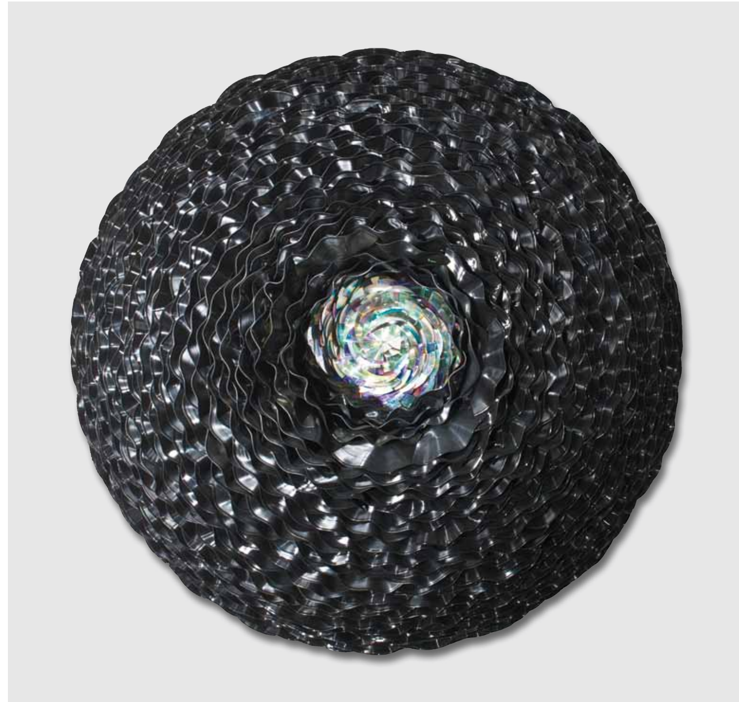
THE GOOD WAY, 2010 Long Playing and Compact Discs records, unique piece - D: 152,5 cm - 60 in.