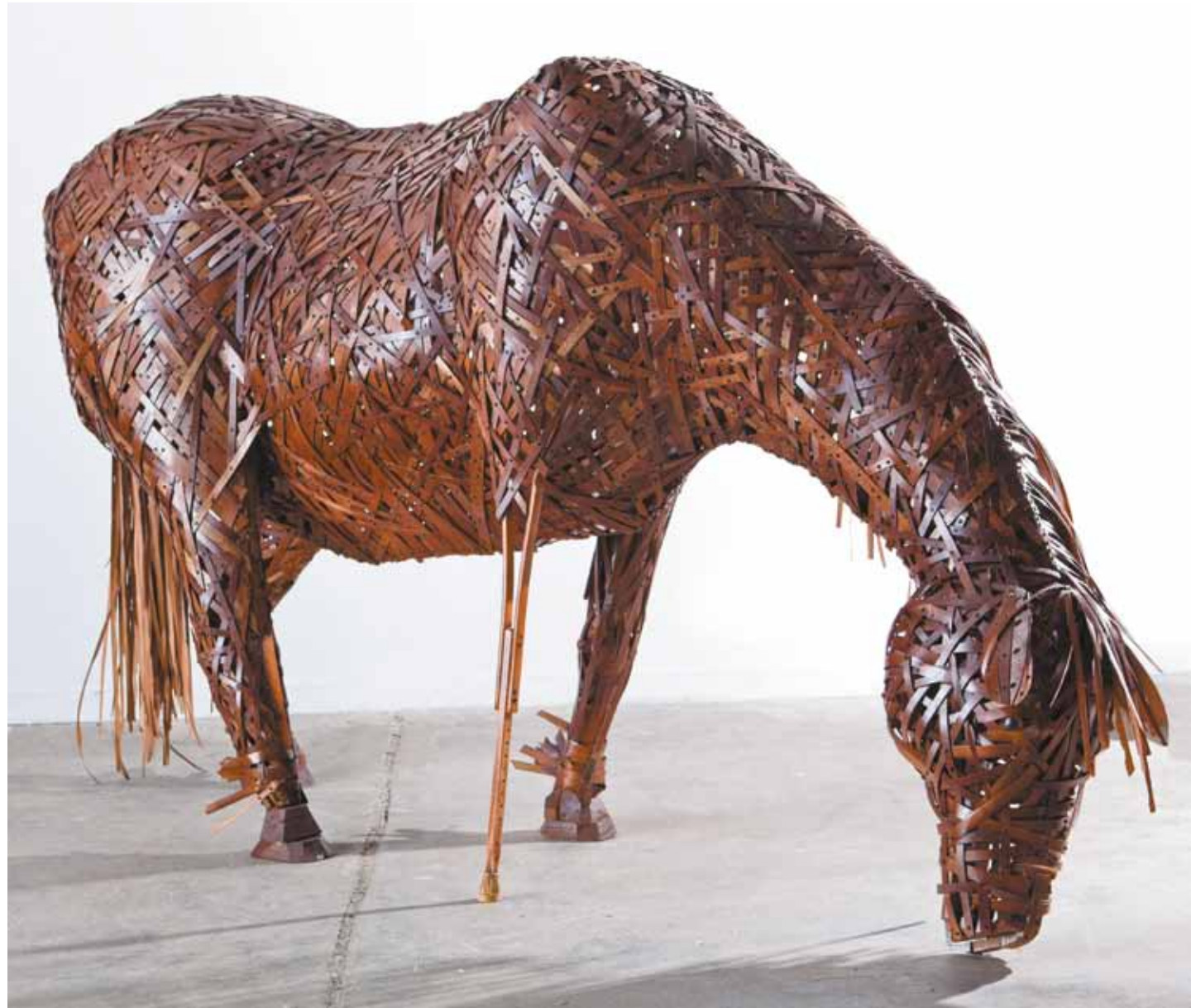
BROWN HORSE, 2010 Wood, unique piece - Life-size