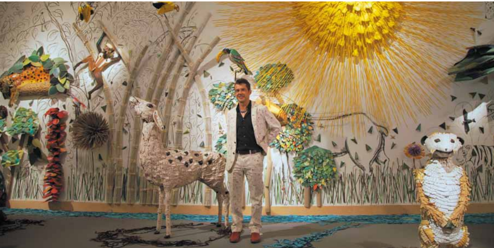
Installation The World According to Federico Uribe , Boca Raton Museum of Art, USA