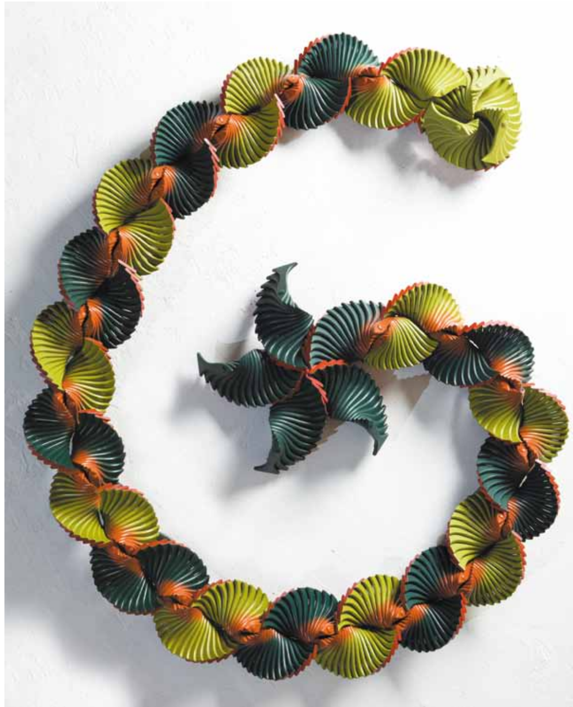
GREEN FLOWER, 2011

Brush handles, unique piece - H: 152,5 cm - 60 in.