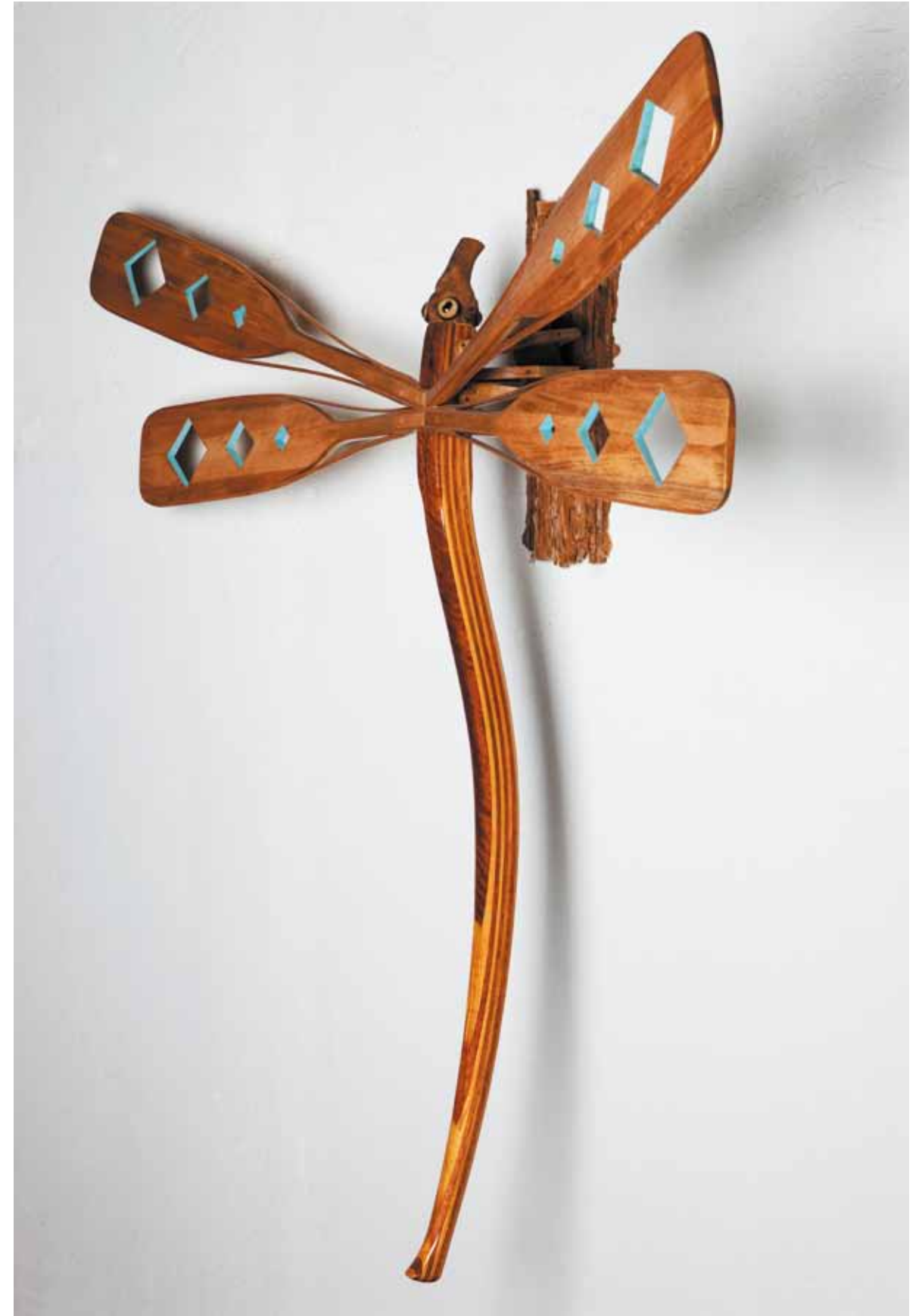
DRAGONFLY, 2011 Wood, unique piece - H: 122 cm - 48 in.