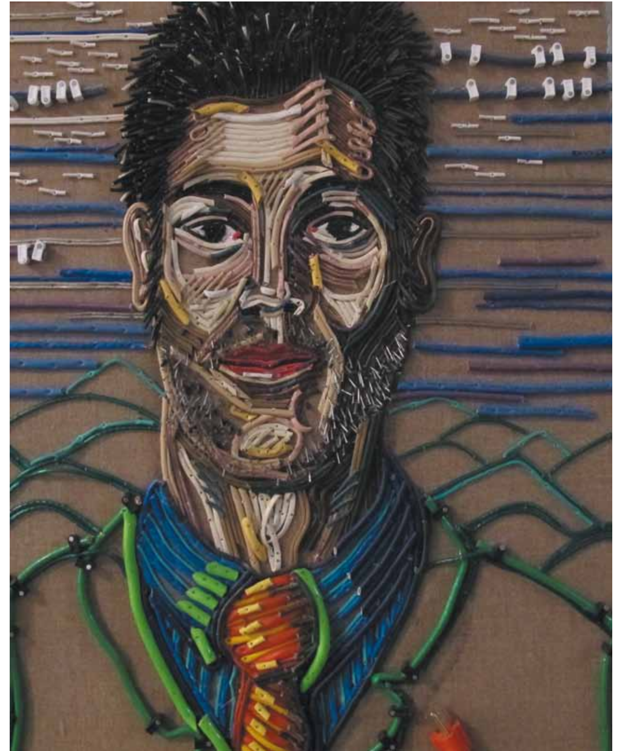
Portrait, 2011 Electric cables, unique piece - Base: 68,5 x 48 cm - 27 x 19 in.